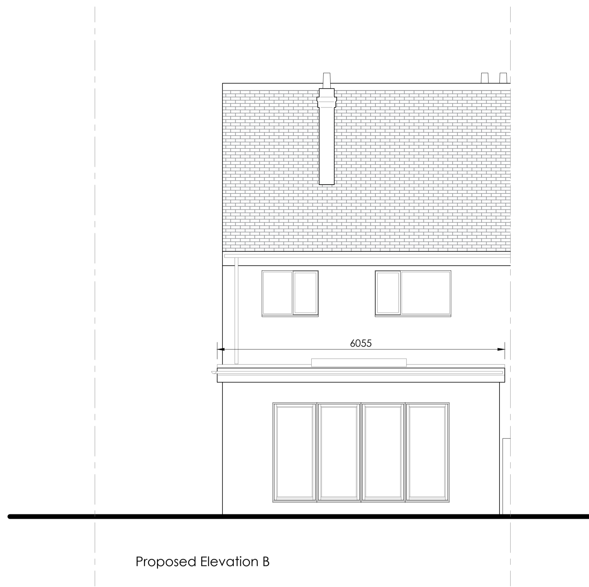
Proposed Elevation B