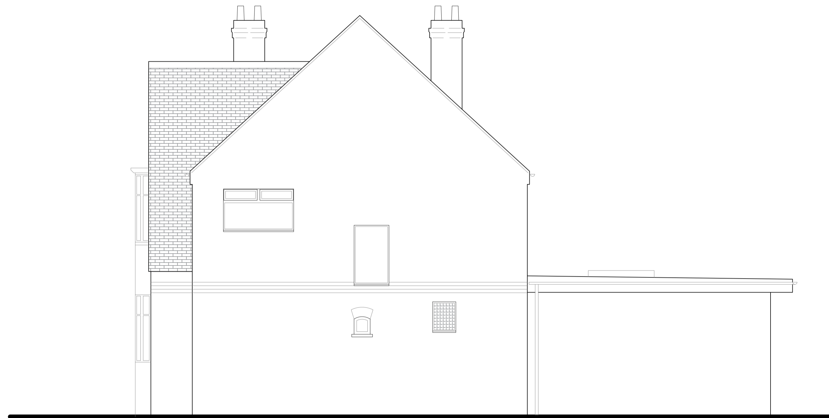
Proposed Elevation A