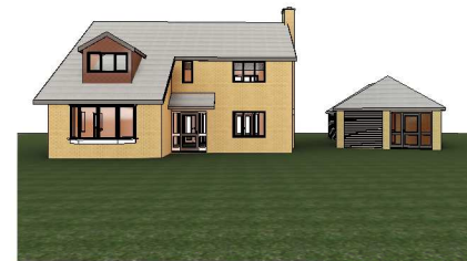
3D Street View (Proposed)