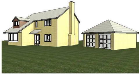
3D Side View (Existing)