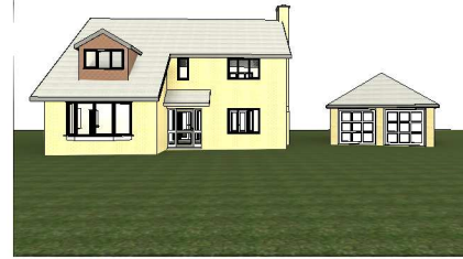
3D Street View (Existing)