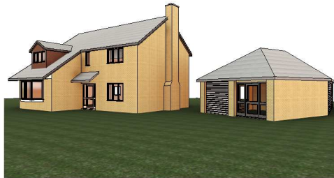
3D Side View (Proposed)