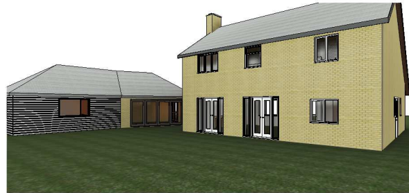
3D Rear View (Proposed)