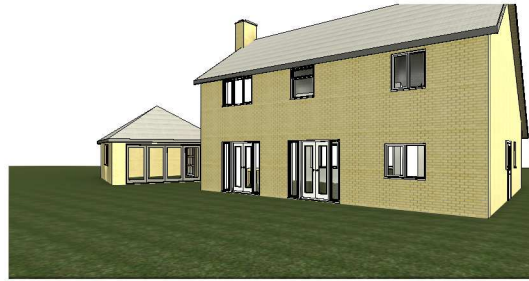
3D Rear View (Existing)