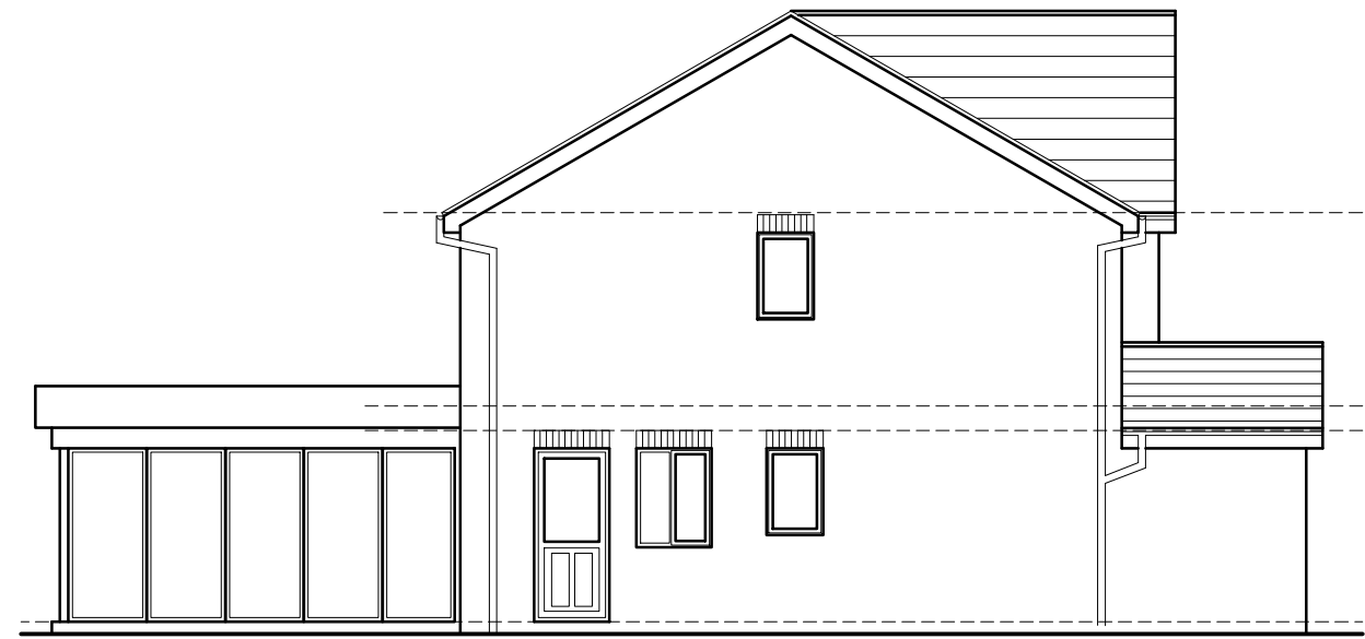
Proposed Side Elevation 2