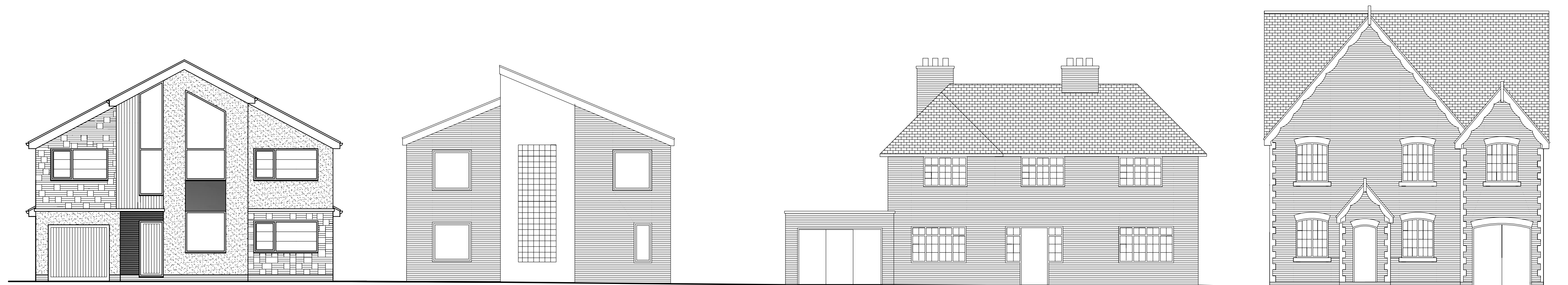
No 260a PROPOSED