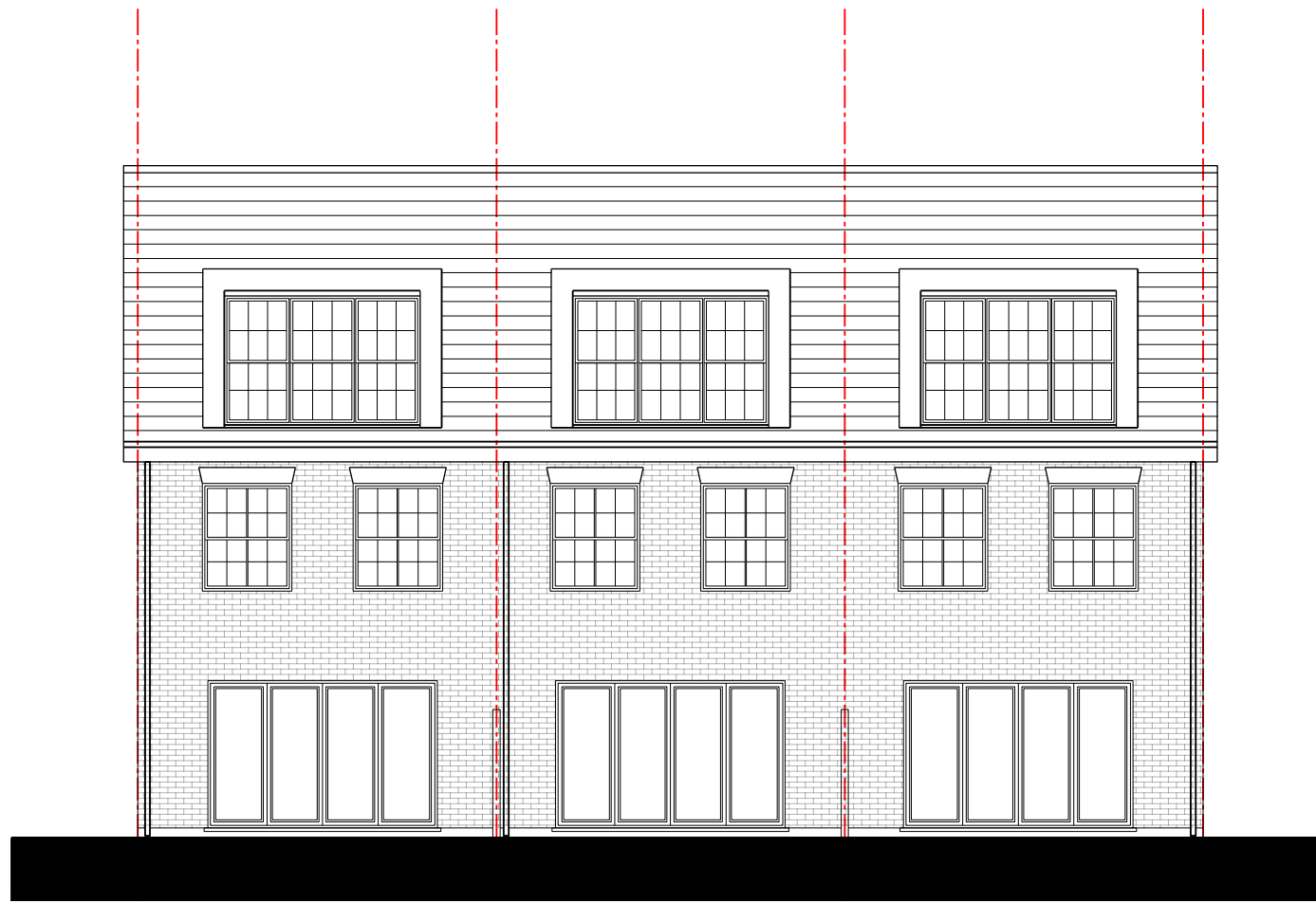
1 ELEVATION Proposed North Elevation SCALE 1: 100