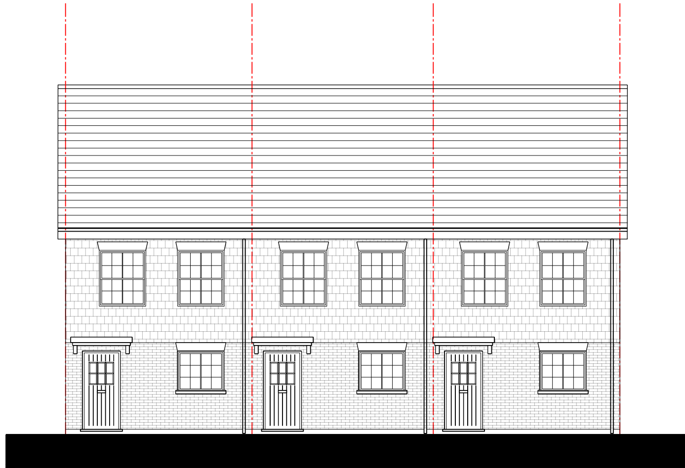
3 ELEVATION Proposed South Elevation SCALE 1: 100