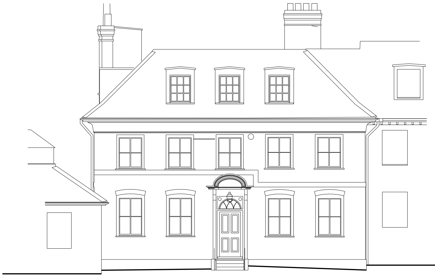
3 PLAN Existing North Elevation SCALE 1: 100