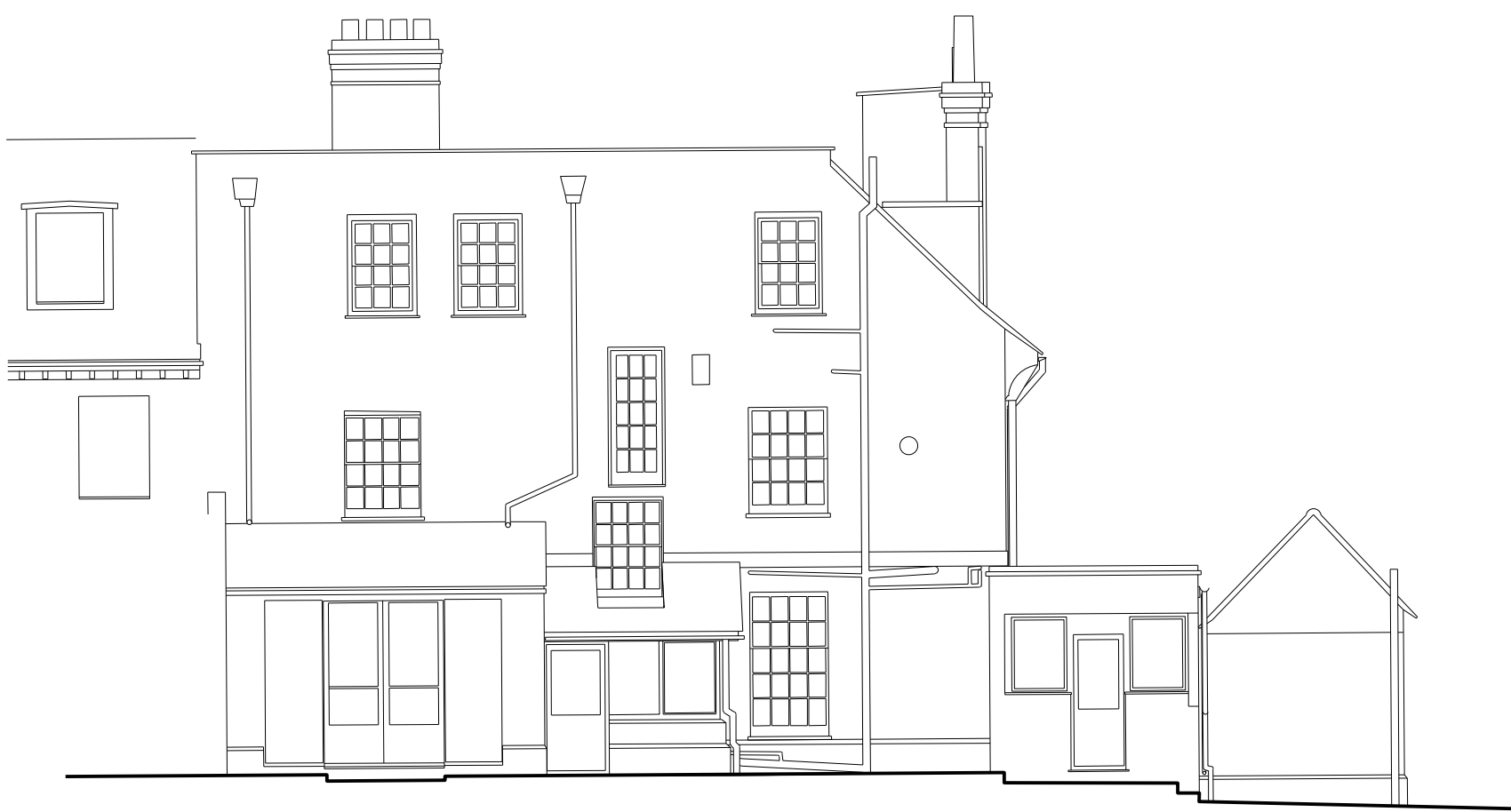
1 PLAN Existing South Elevation SCALE 1: 100