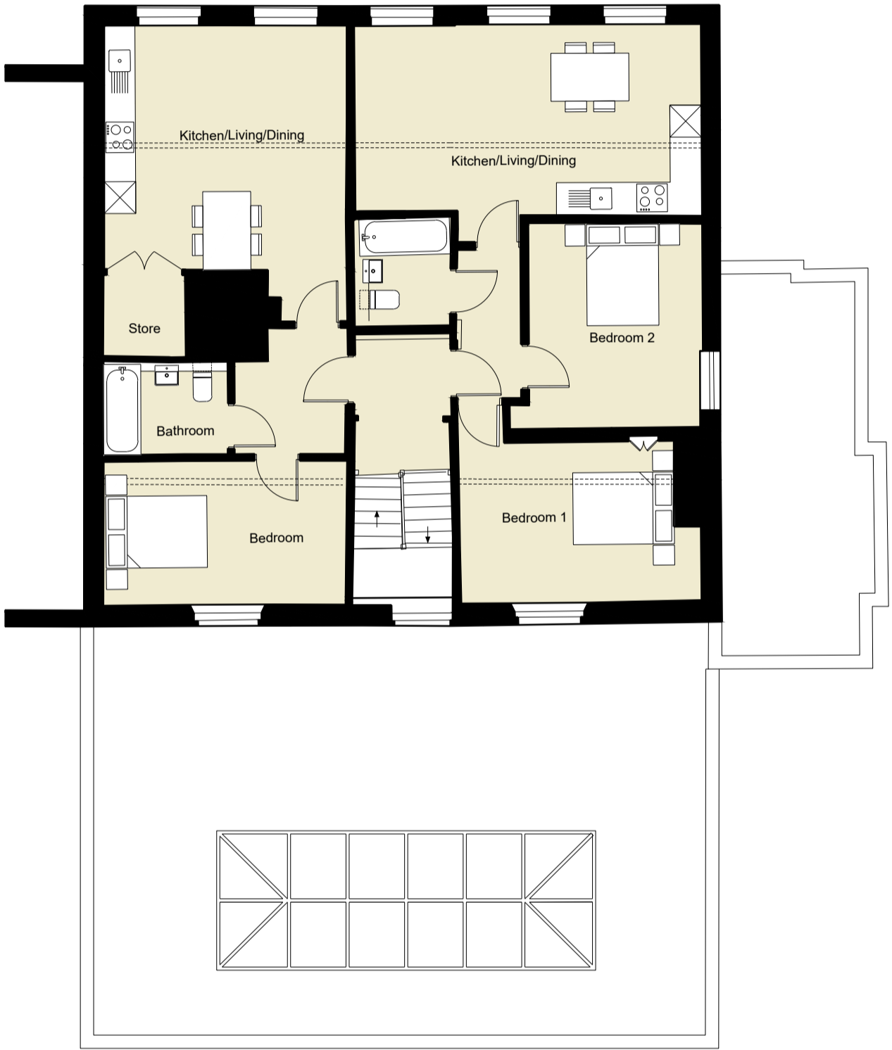
2 PLAN Proposed First Floor Plan SCALE 1: 100