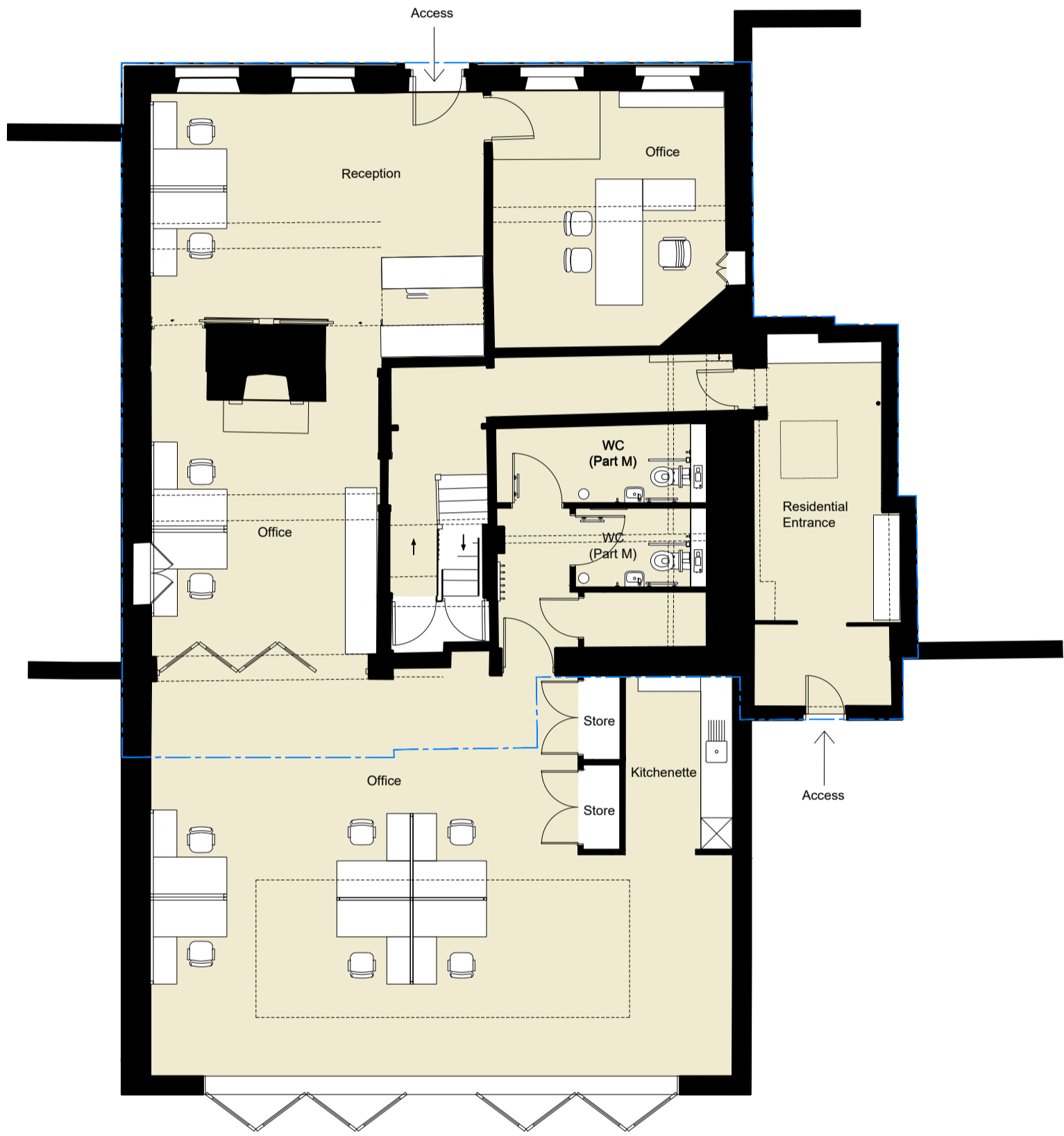
1 PLAN Proposed Ground Floor Plan SCALE 1: 100