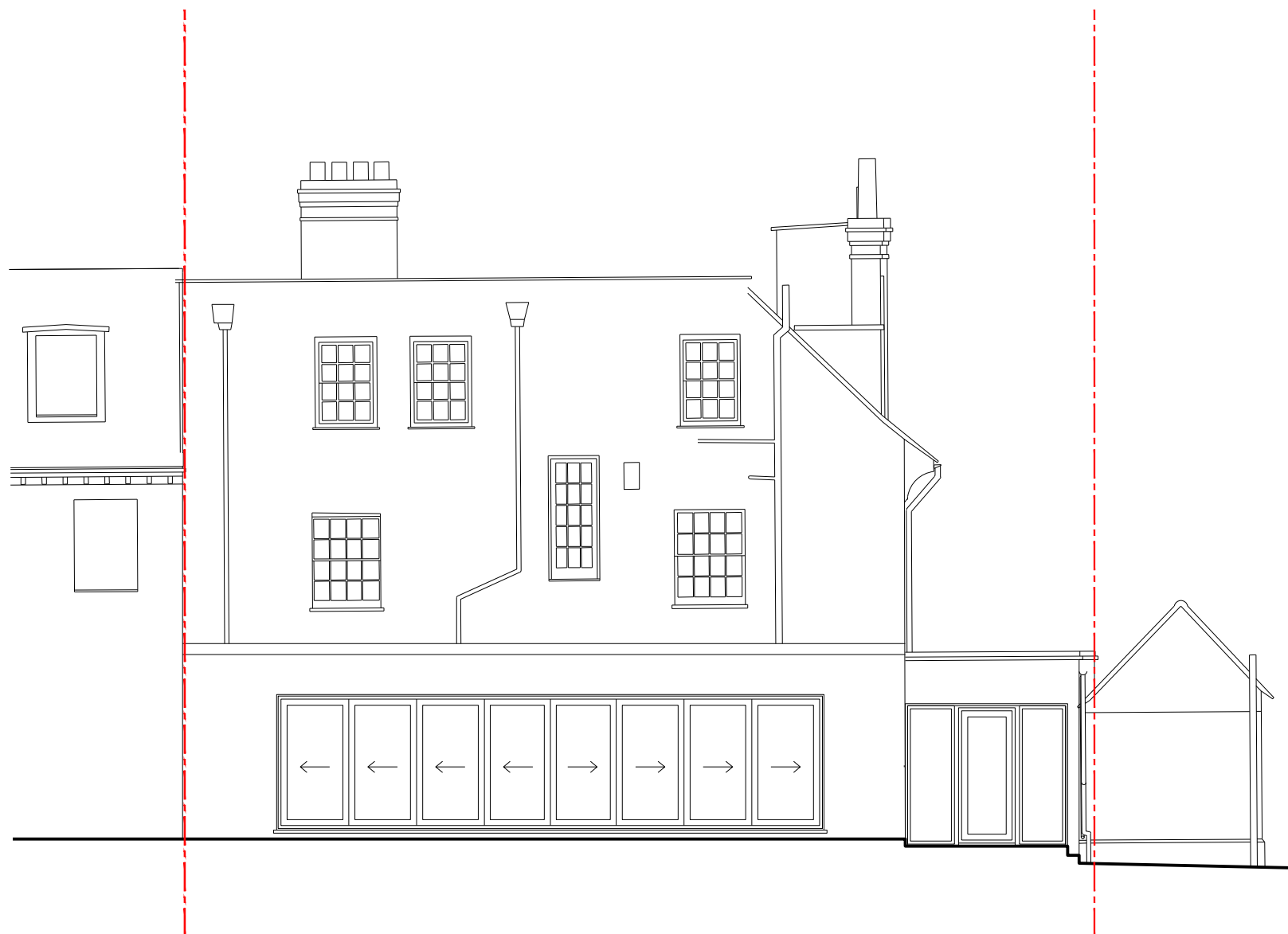
3 ELEVATION Proposed South Elevation SCALE 1: 100