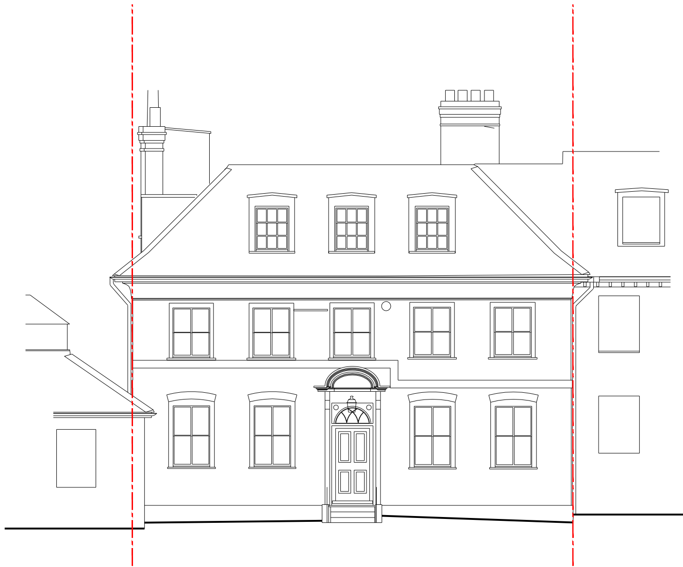
1 ELEVATION Proposed North Elevation SCALE 1: 100