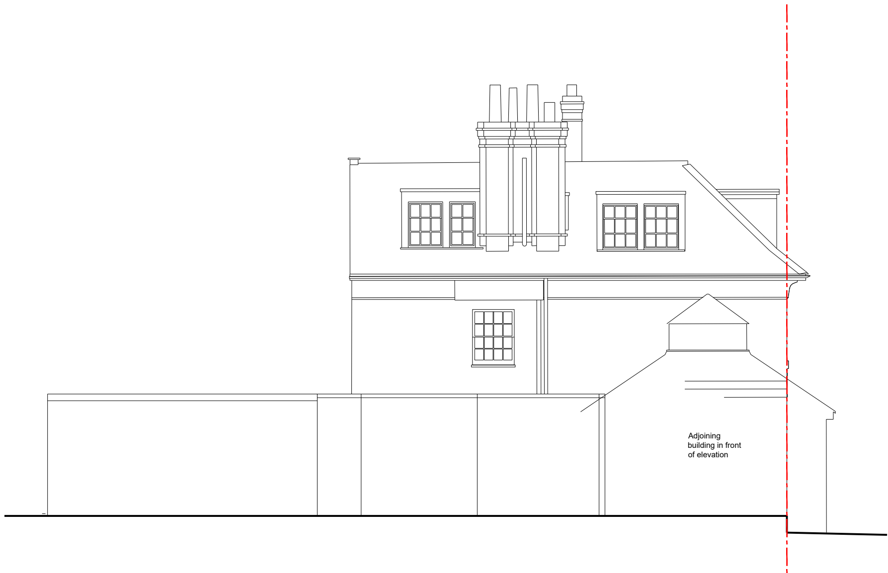
2 ELEVATION Proposed East Elevation SCALE 1: 100