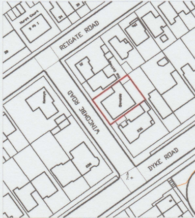
Existing site location plan Scale 1:1250 @A3