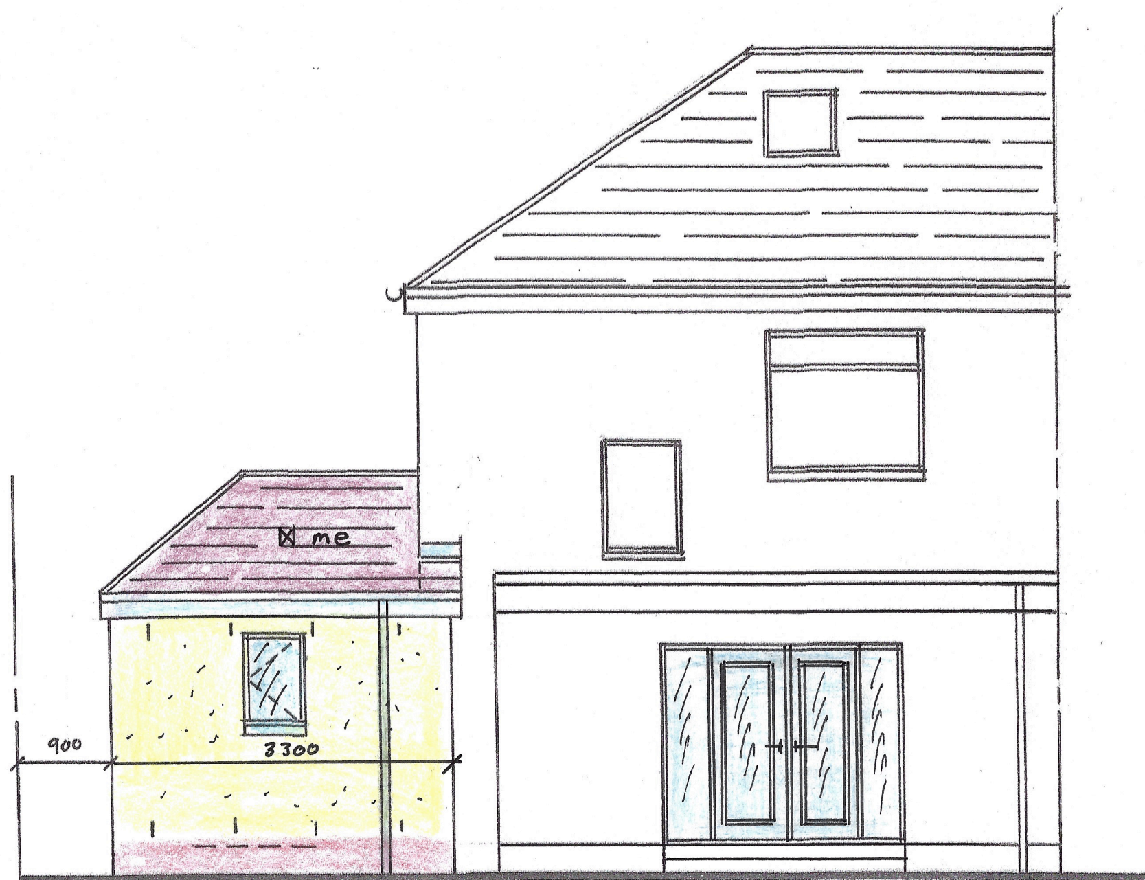
Rear Elevation As Proposed