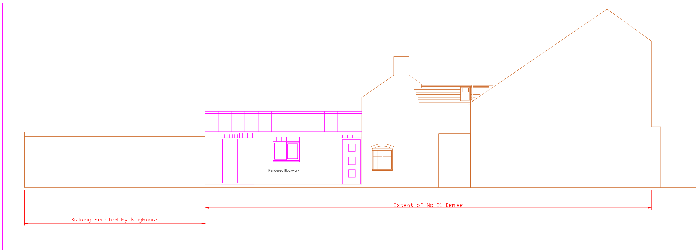
PROPOSED WEST ELEVATION Scale 1:100

Copyright of this drawing is reserved by GadARCH DESIGN and issued on the condition that it is not copied, reproduced or disclosed to any third party either wholly or in part without the consent in writing of GadARCH DESIGN. The contractor must verify all dimensions on site before making shop drawings or commencing work of any kind. No dimensions to be scaled from this drawing.