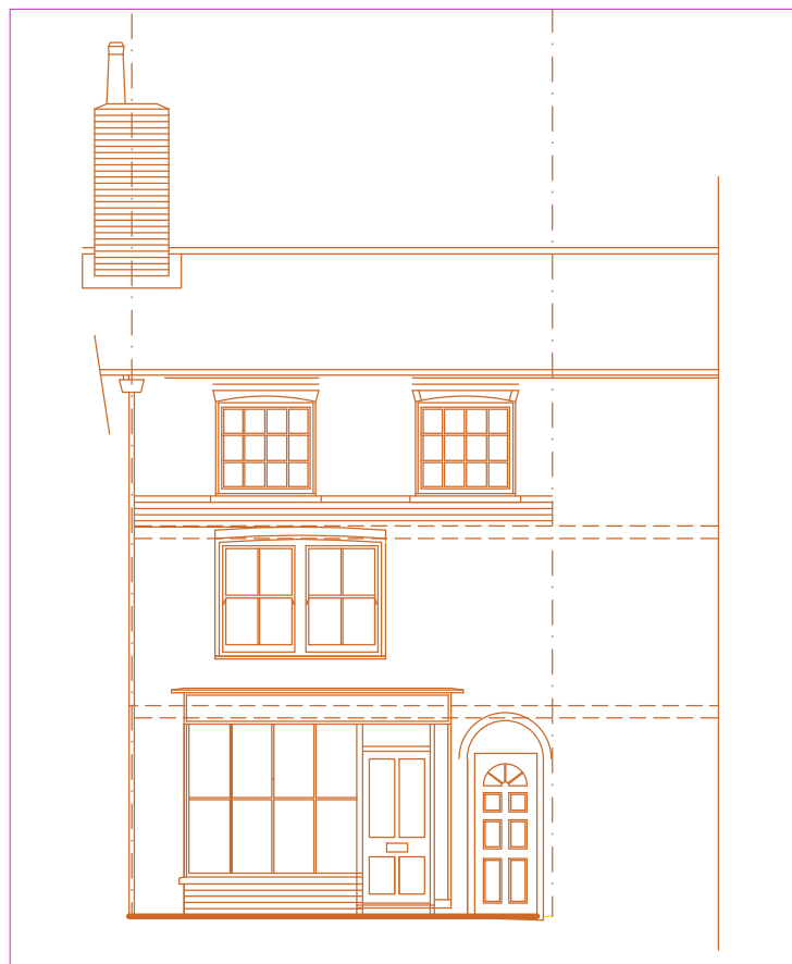
FRONT ( SOUTH ) ELEVATION Scale 1:100