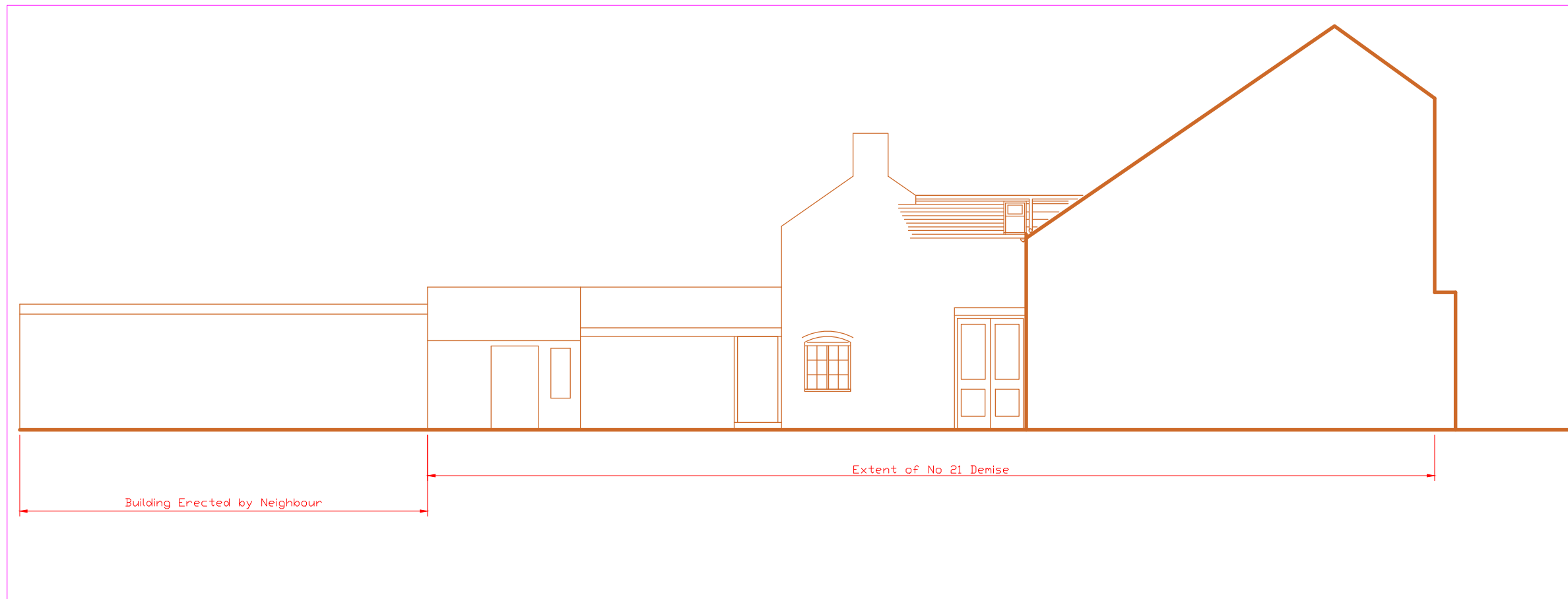
EXISTING WEST ELEVATION Scale 1:100

Copyright of this drawing is reserved by GadARCH DESIGN and issued on the condition that it is not copied, reproduced or disclosed to any third party either wholly or in part without the consent in writing of GadARCH DESIGN. The contractor must verify all dimensions on site before making shop drawings or commencing work of any kind. No dimensions to be scaled from this drawing.