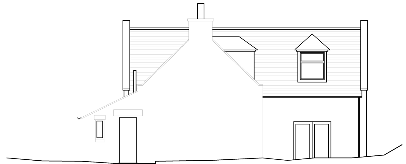
EXISTING WEST ELEVATION 1:100 @ A3