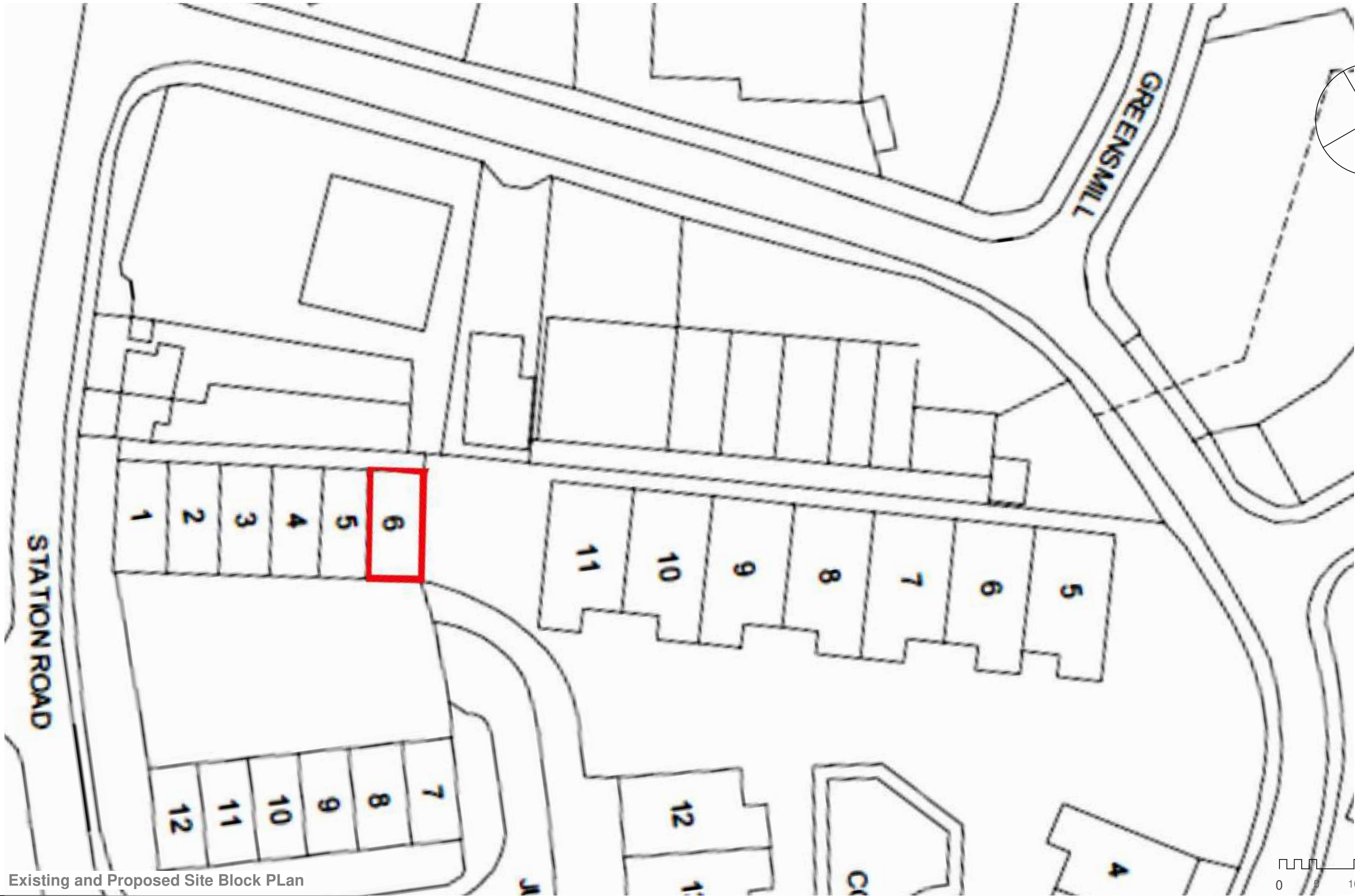
Existing and Proposed Site Block Plan