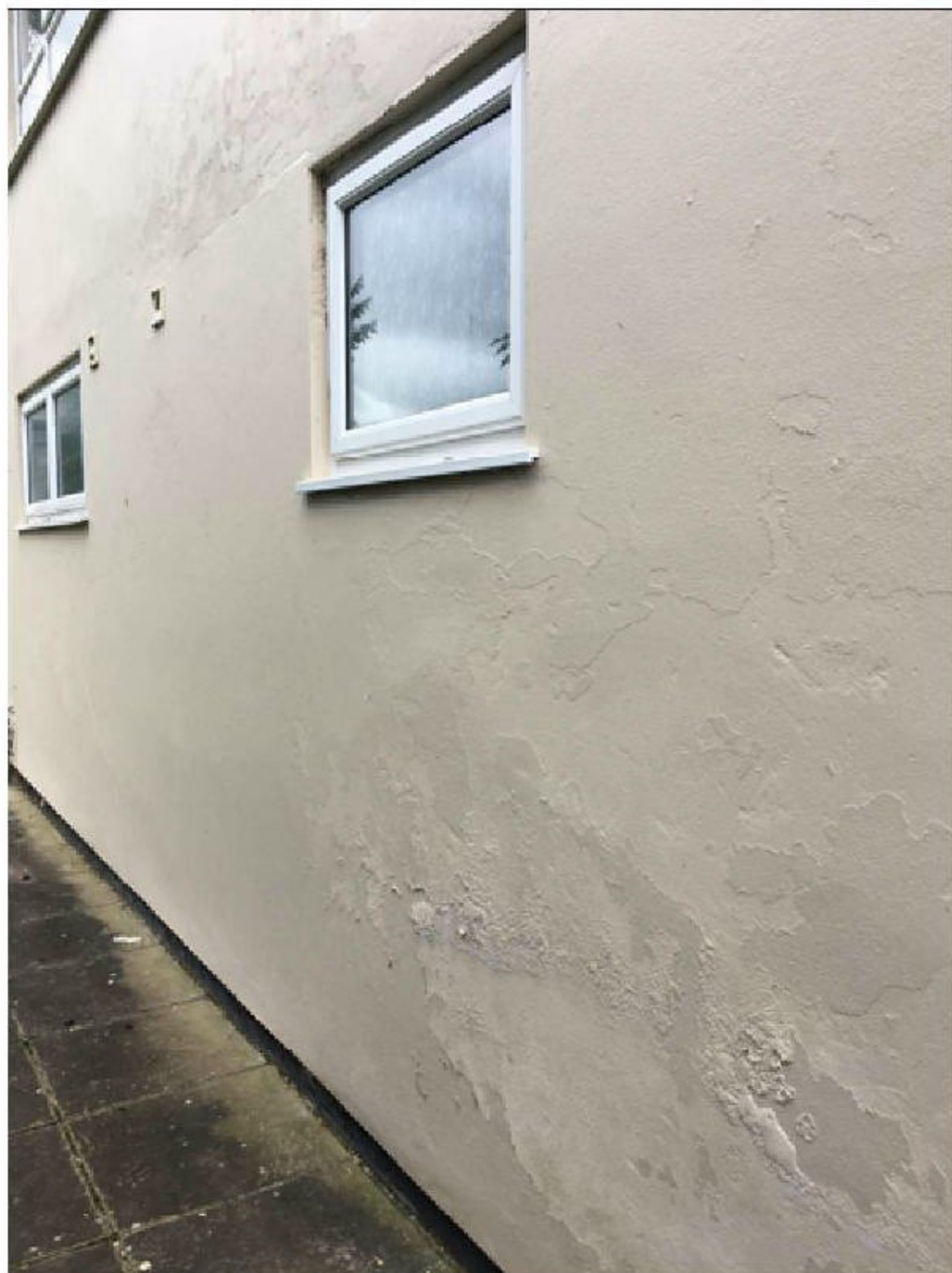
Internal Photo PW01a