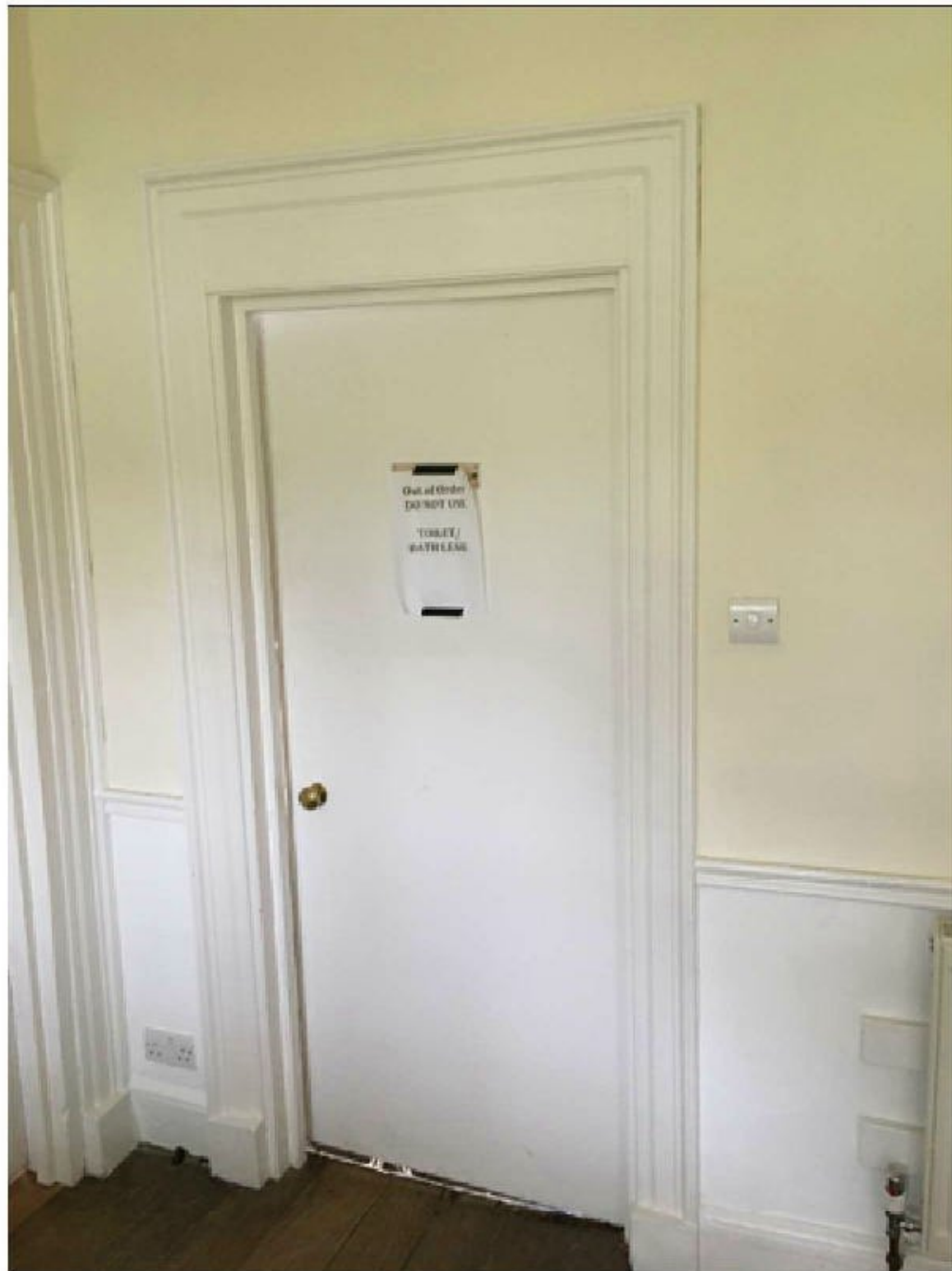
Internal Photo PW06

Photo Location - First floor wc - PW06 - See floor plans for location