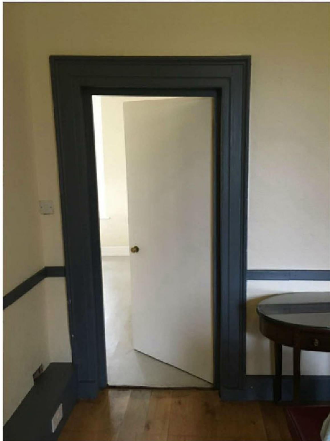
Internal Photo PW17

Photo Location - Bedroom 1 - PW17 - See floor plans for location