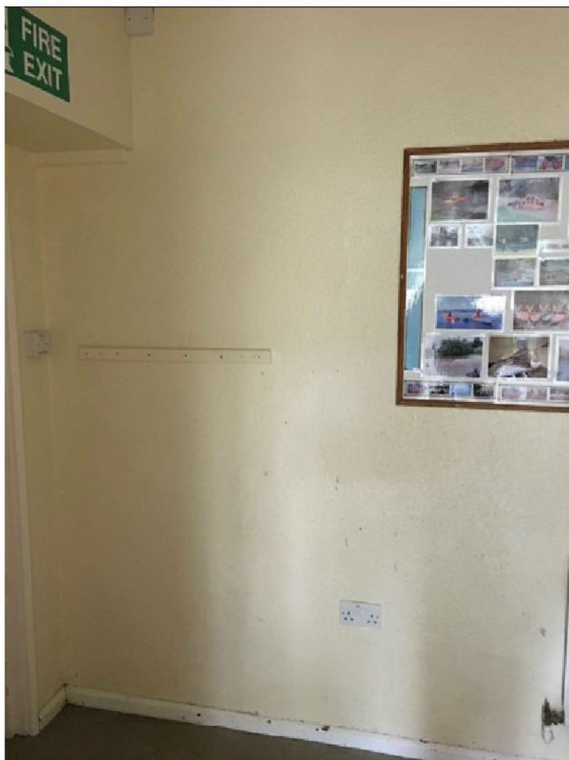
Internal Photo PW05

Photo Location - Showers - PW05 - See floor plans for location