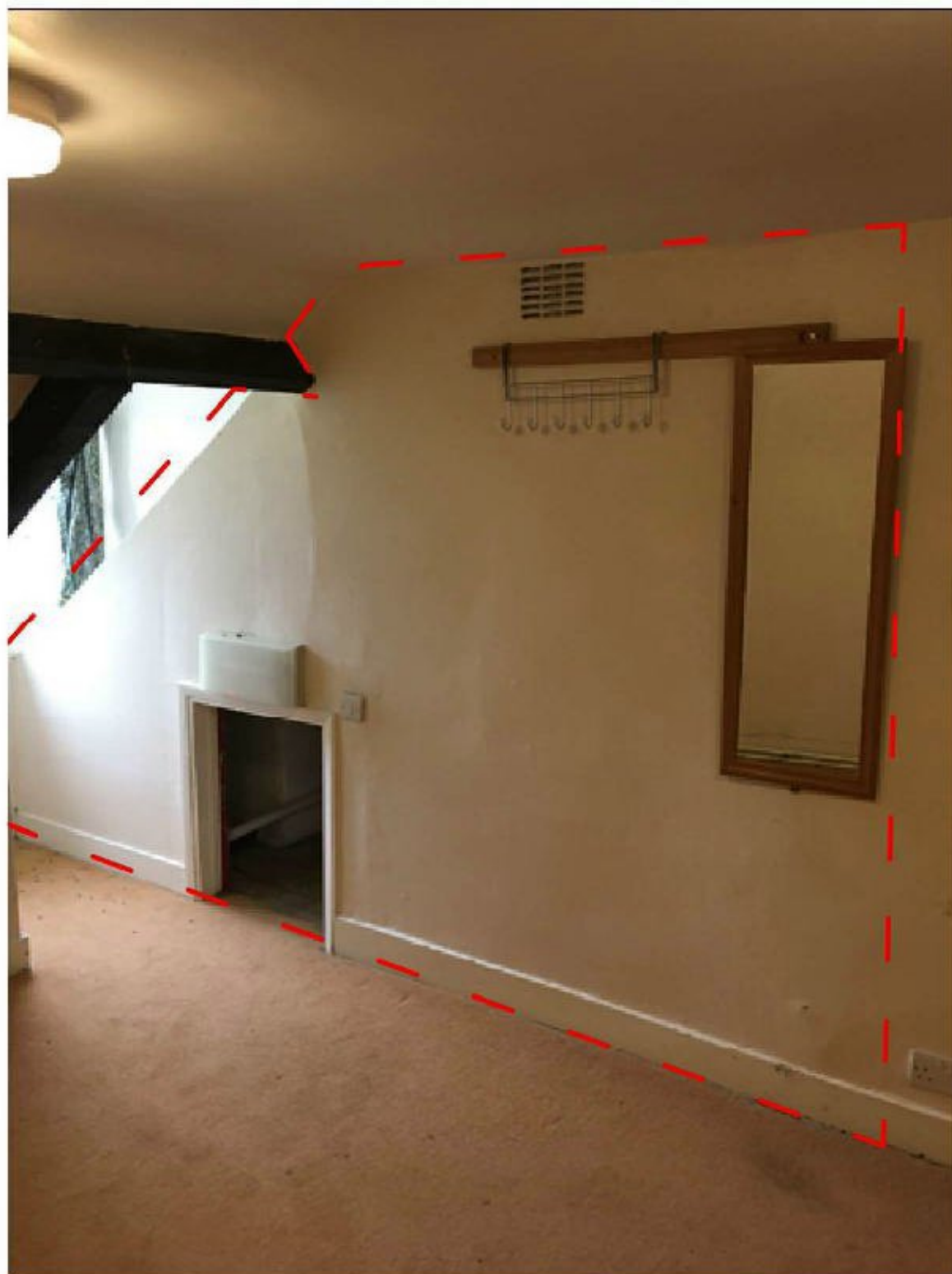
Internal Photo PW27

Photo Location - Bedroom 7 - PW27 - See floor plans for location