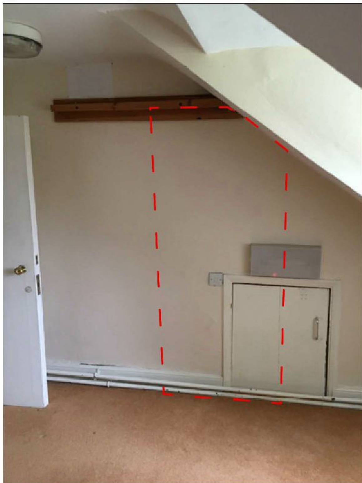
Internal Photo PW25

Photo Location - Bedroom 6 - PW25 - See floor plans for location