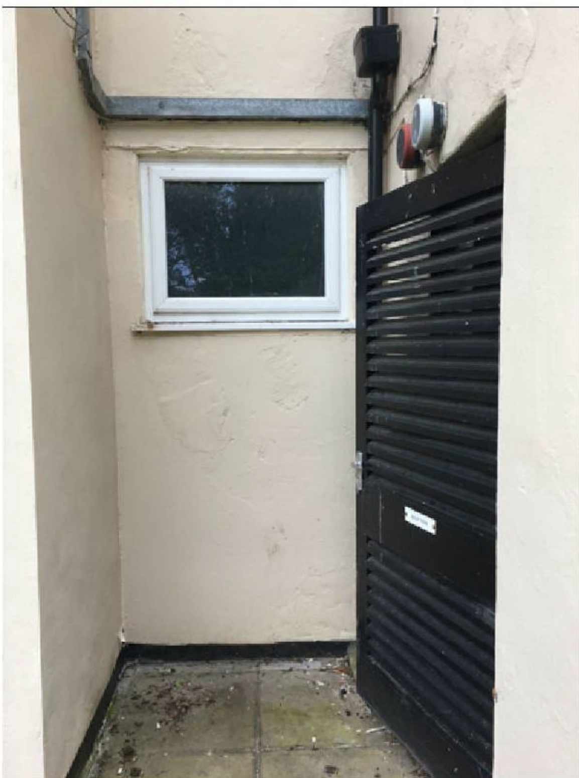
Internal Photo PW02a