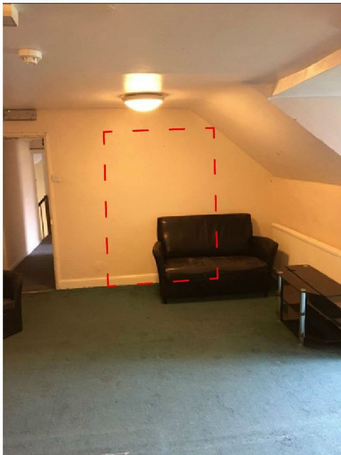
Internal Photo PW23

Photo Location - Bedroom 1 - PW23 - See floor plans for location