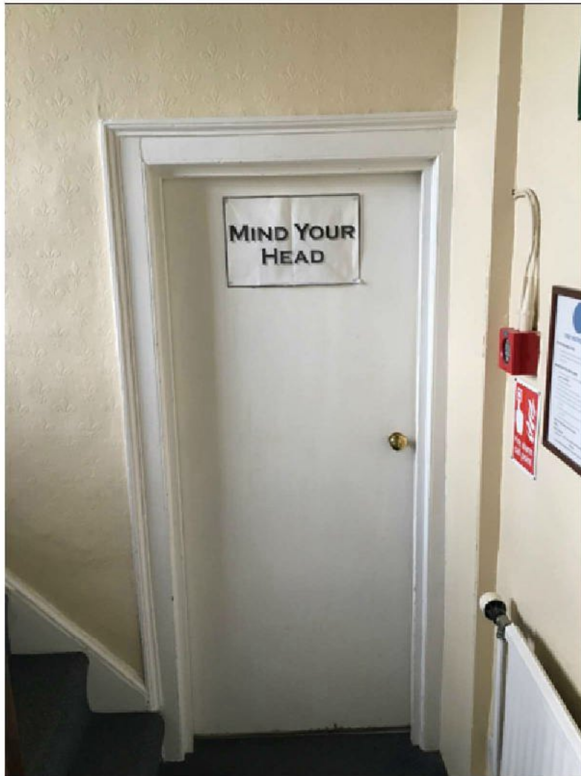
Internal Photo PW07

Photo Location - Second floor stairs - PW07 - See floor plans for location