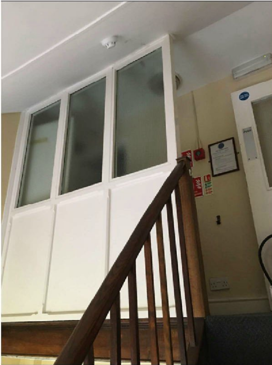
Internal Photo PW20

Photo Location - Bedroom 1 - PW20 - See floor plans for location