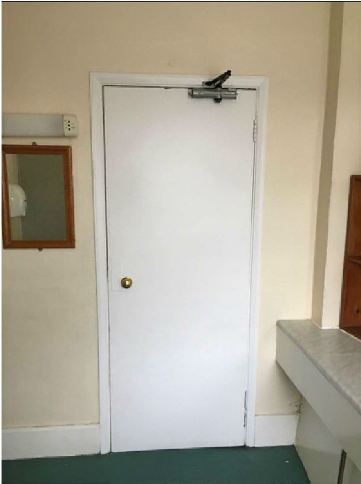
Internal Photo PW14

Photo Location - Bedroom 5 washroom - PW14 - See floor plans for location