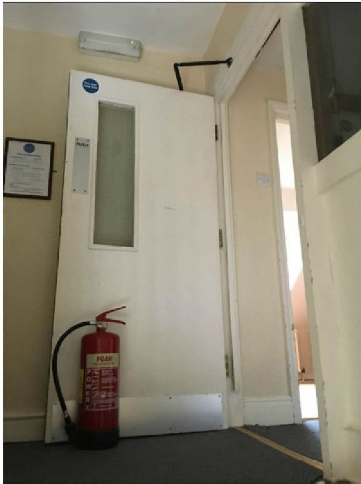
Internal Photo PW21

Photo Location - Bedroom 1 - PW21 - See floor plans for location