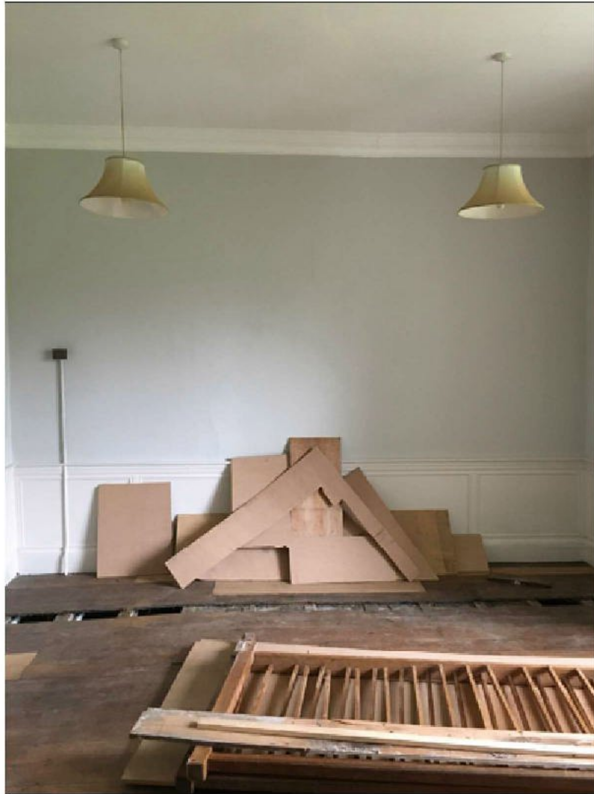
Internal Photo PW28