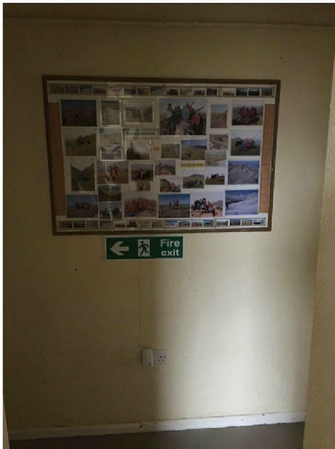
Internal Photo PW03

Photo Location - Showers - PW03 - See floor plans for location