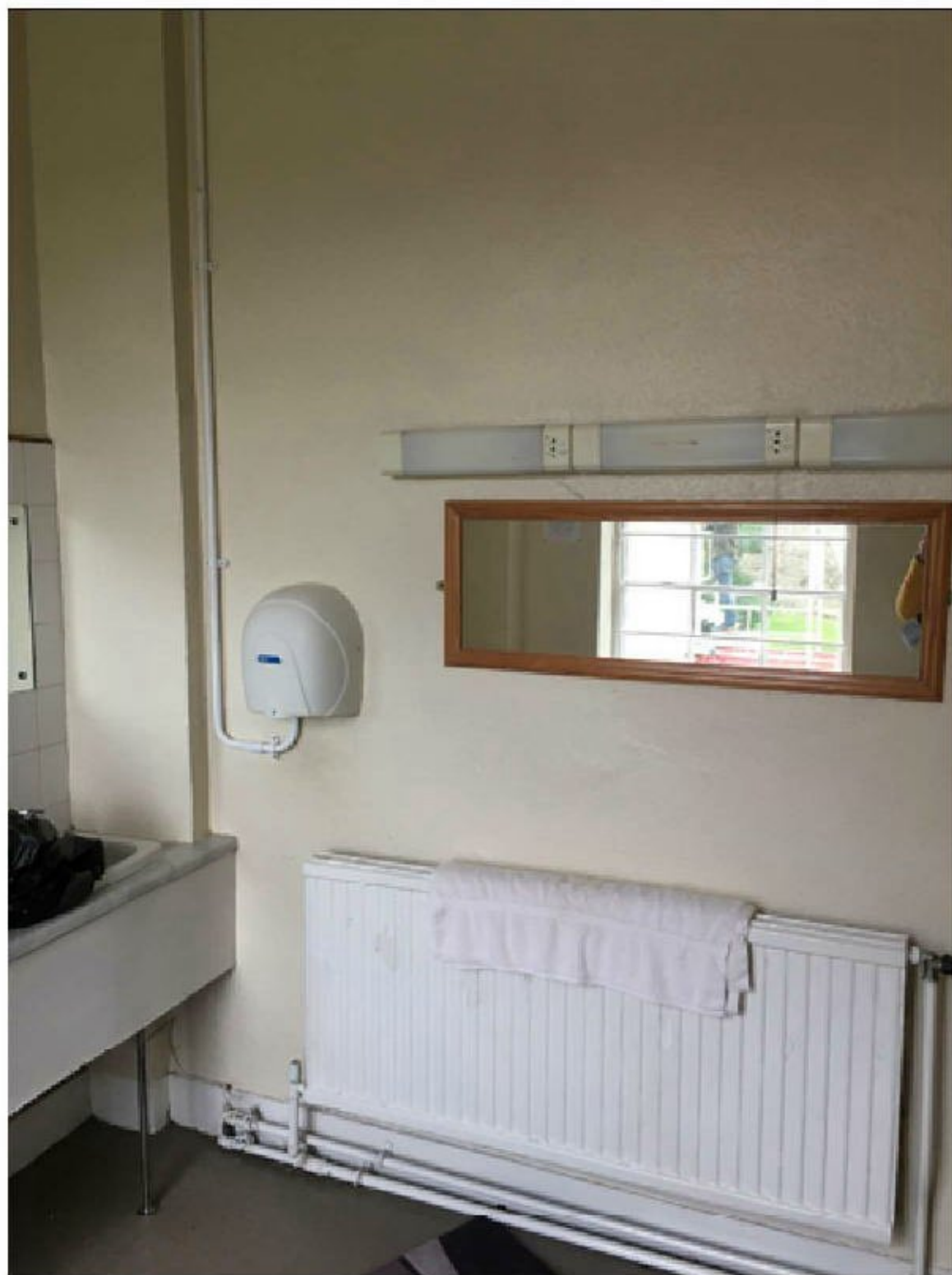
Internal Photo PW09

Photo Location - First floor washroom - PW09 - See floor plans for location