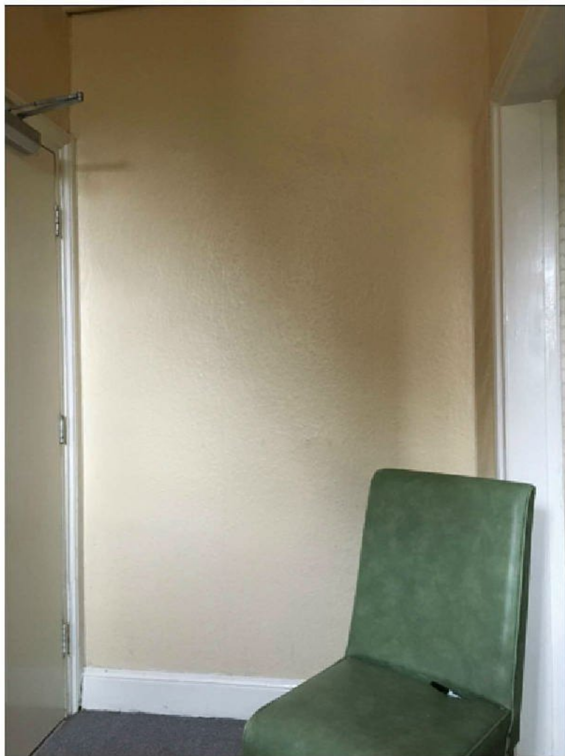
Internal Photo PW13

Photo Location - First floor landing - PW13 - See floor plans for location