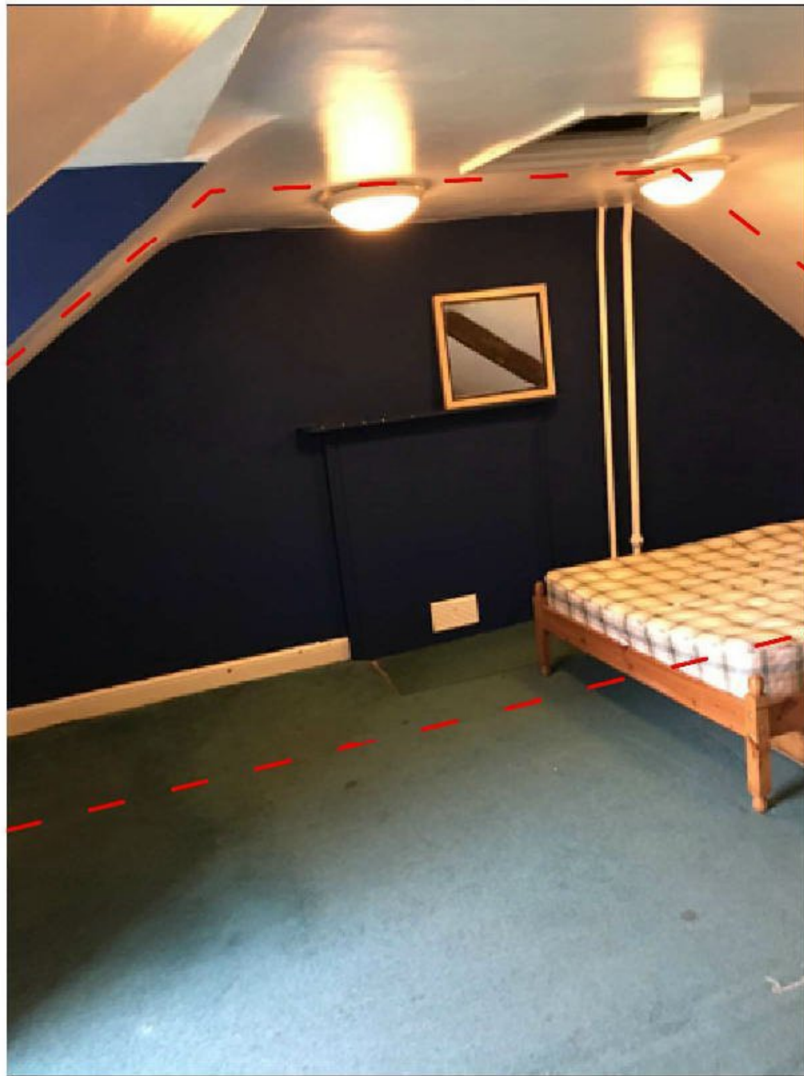
Internal Photo PW22

Photo Location - Bedroom 1 - PW22 - See floor plans for location