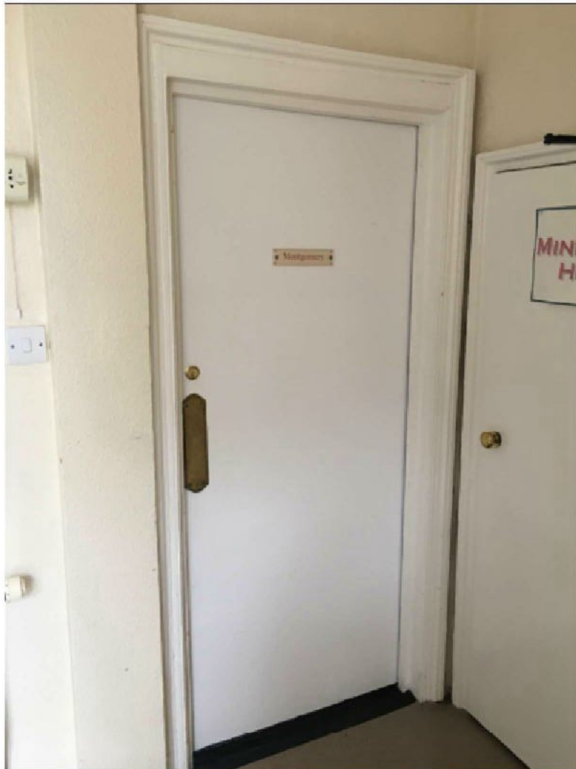
Internal Photo PW08

Photo Location - First floor washroom - PW08 - See floor plans for location