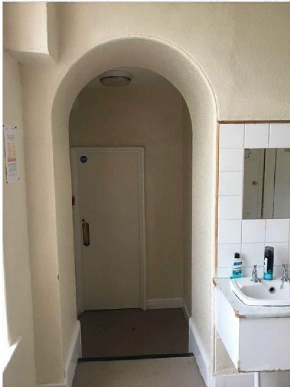
Internal Photo PW10

Photo Location - First floor washroom - PW10 - See floor plans for location