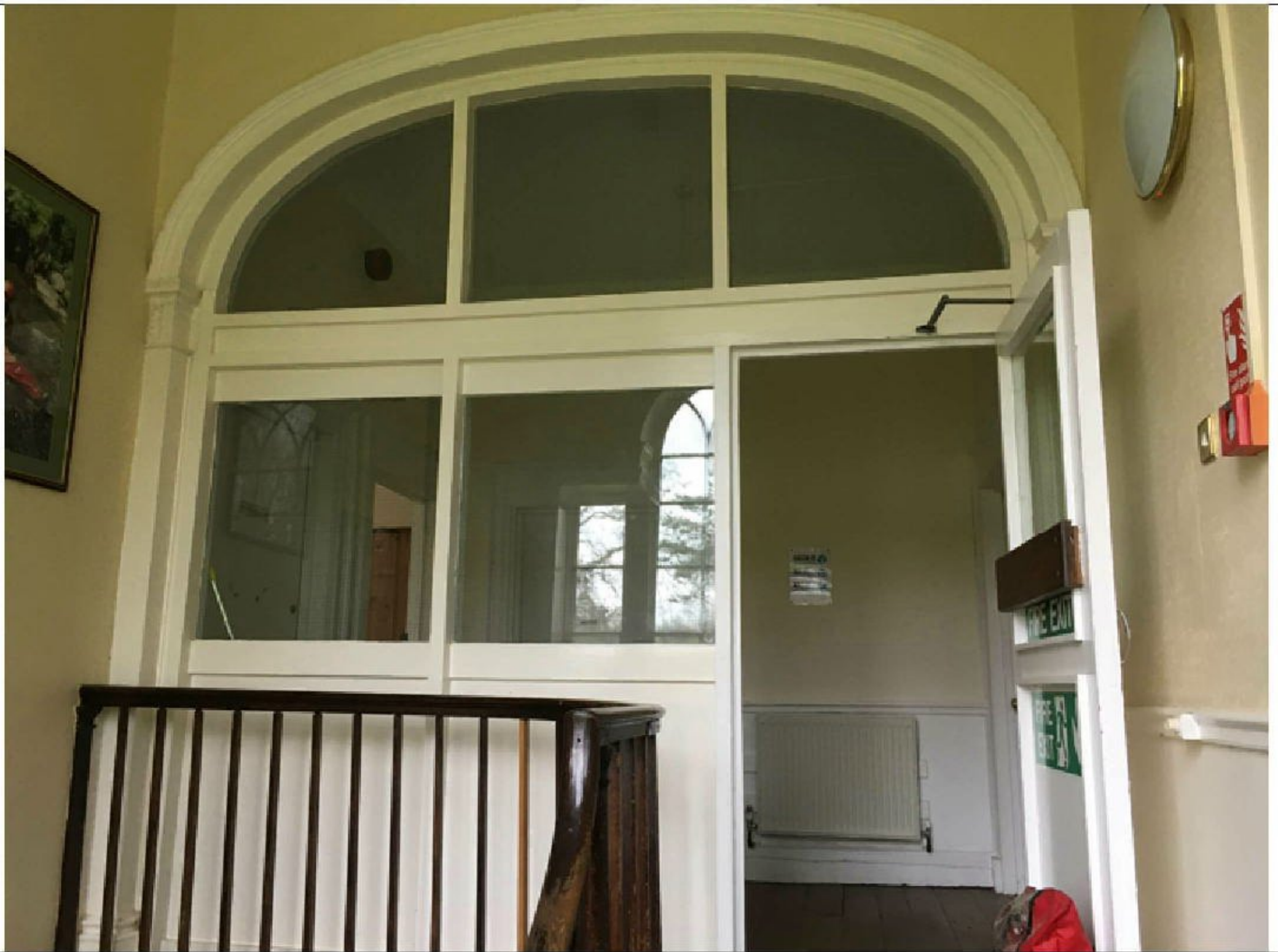
Internal Photo PW19

Photo Location - Bedroom 1 - PW19 - See floor plans for location