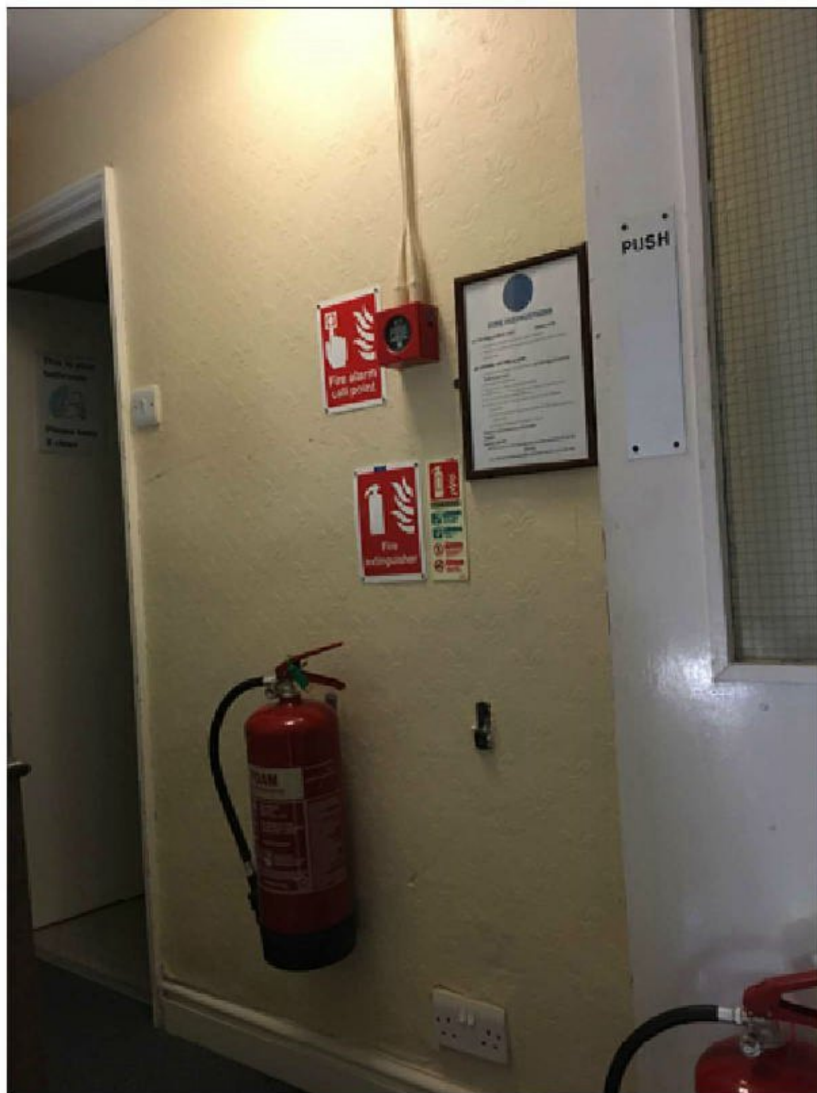
Internal Photo PW26

Photo Location - Bedroom 1 - PW26 - See floor plans for location