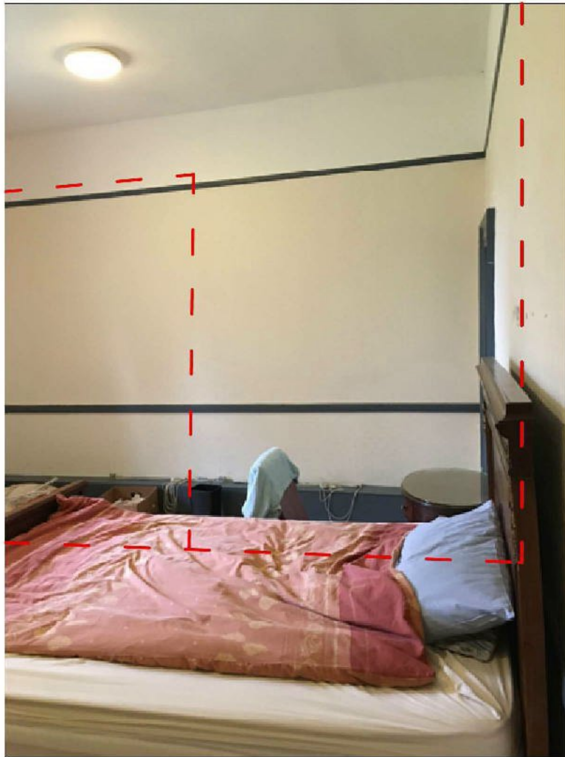
Internal Photo PW18

Photo Location - Bedroom 1 - PW18 - See floor plans for location