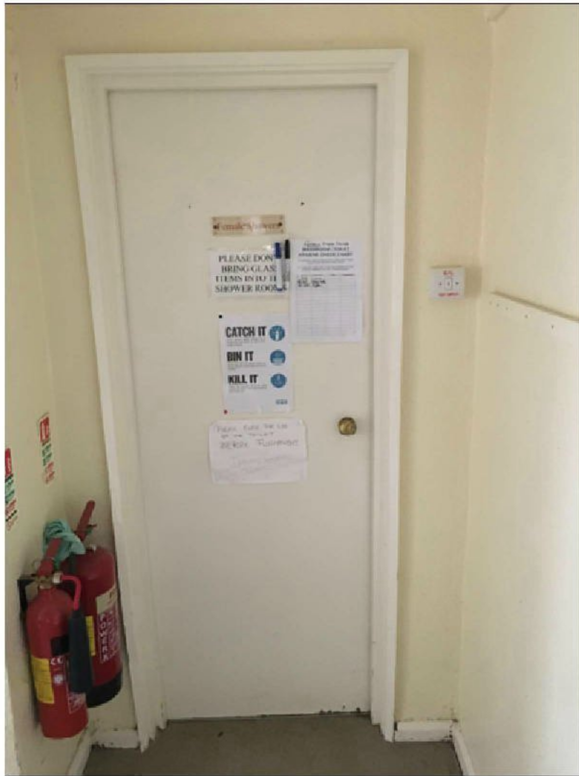
Internal Photo PW04

Photo Location - Showers - PW04 - See floor plans for location