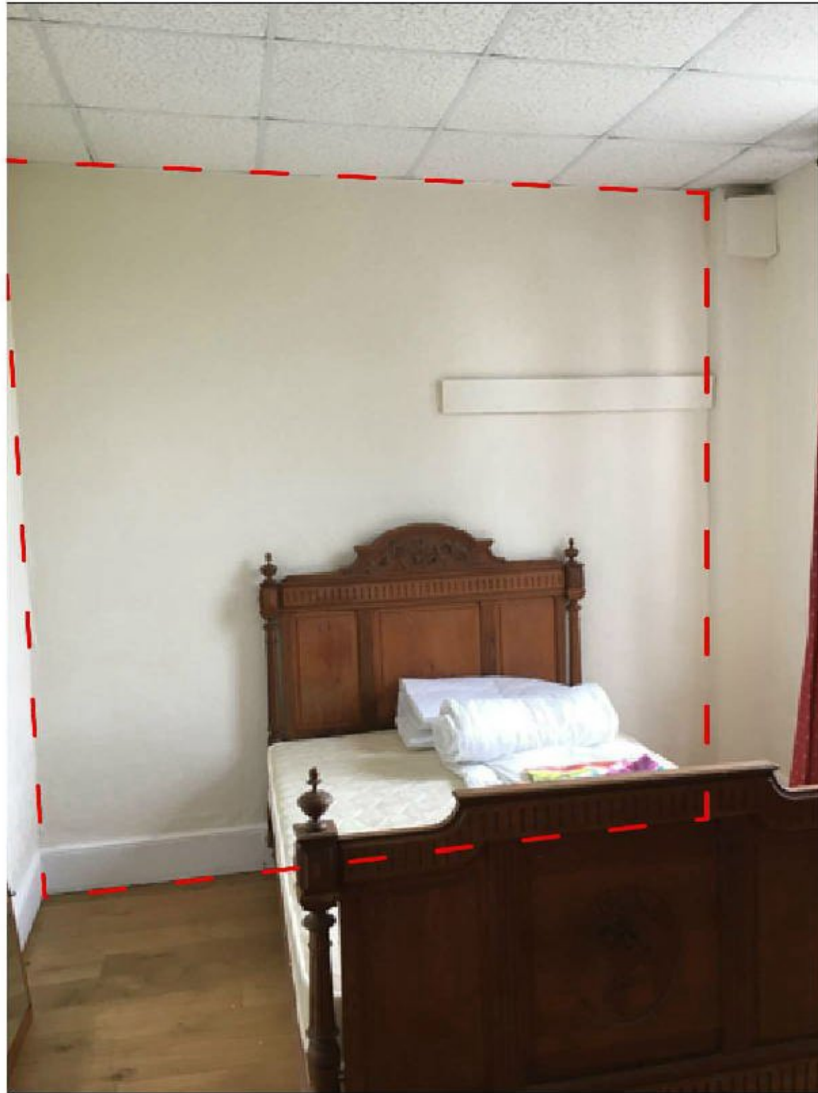
Internal Photo PW16

Photo Location - Bedroom 2 - PW16 - See floor plans for location