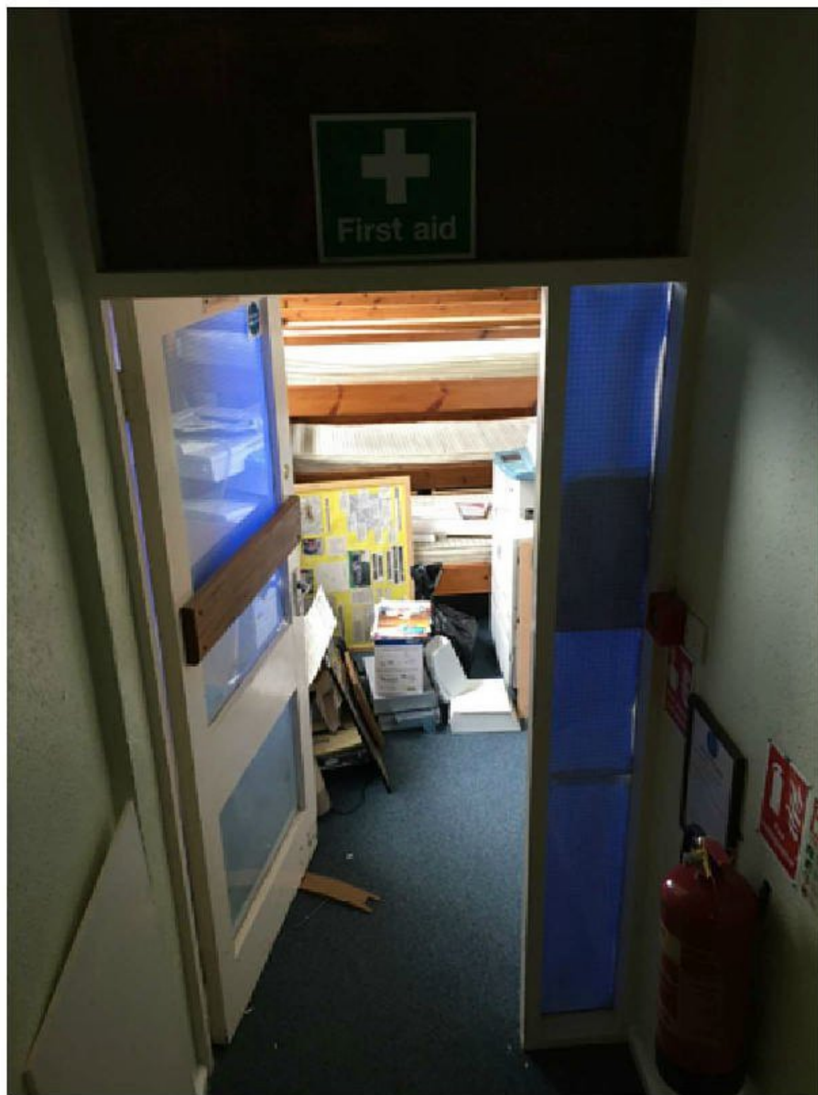
Internal Photo PW12

Photo Location - First floor corridor - PW12 - See floor plans for location