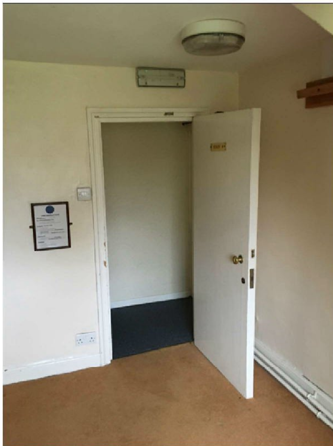
Internal Photo PW24

Photo Location - Bedroom 6 - PW24 - See floor plans for location