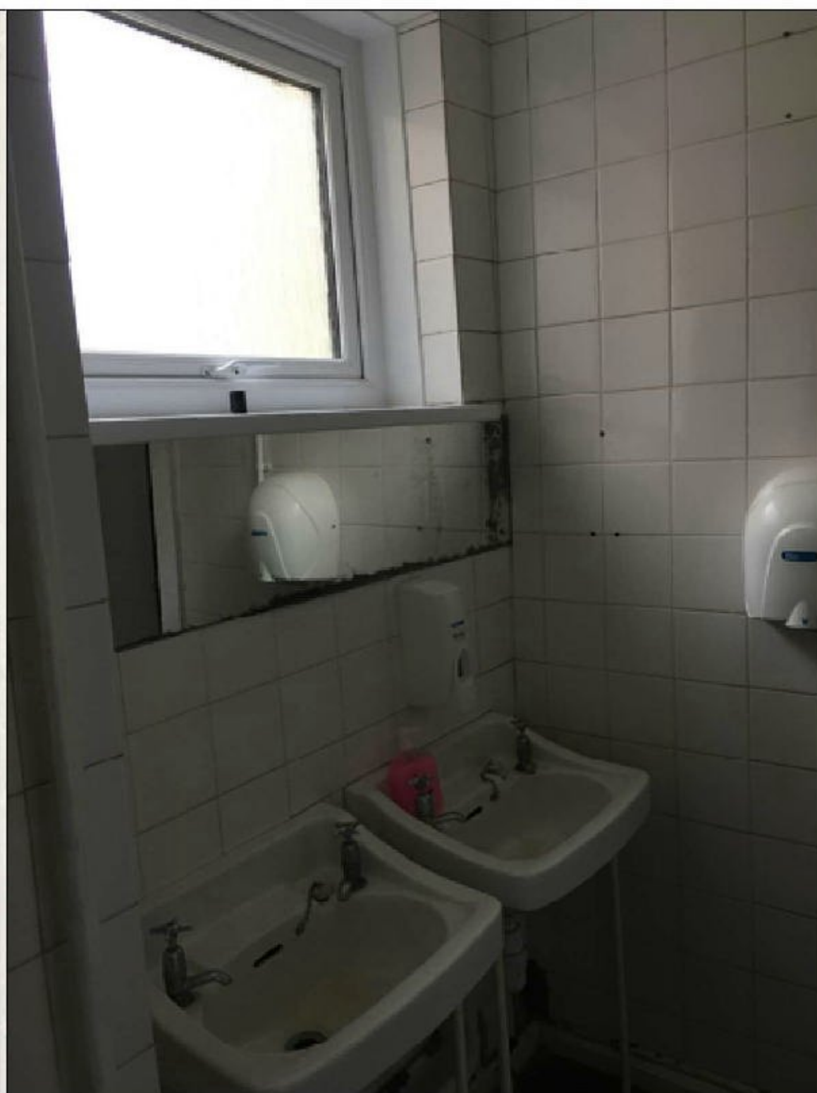
Internal Photo PW02b

Photo Location - Showers - PW02a & PW02b - See floor plans for location