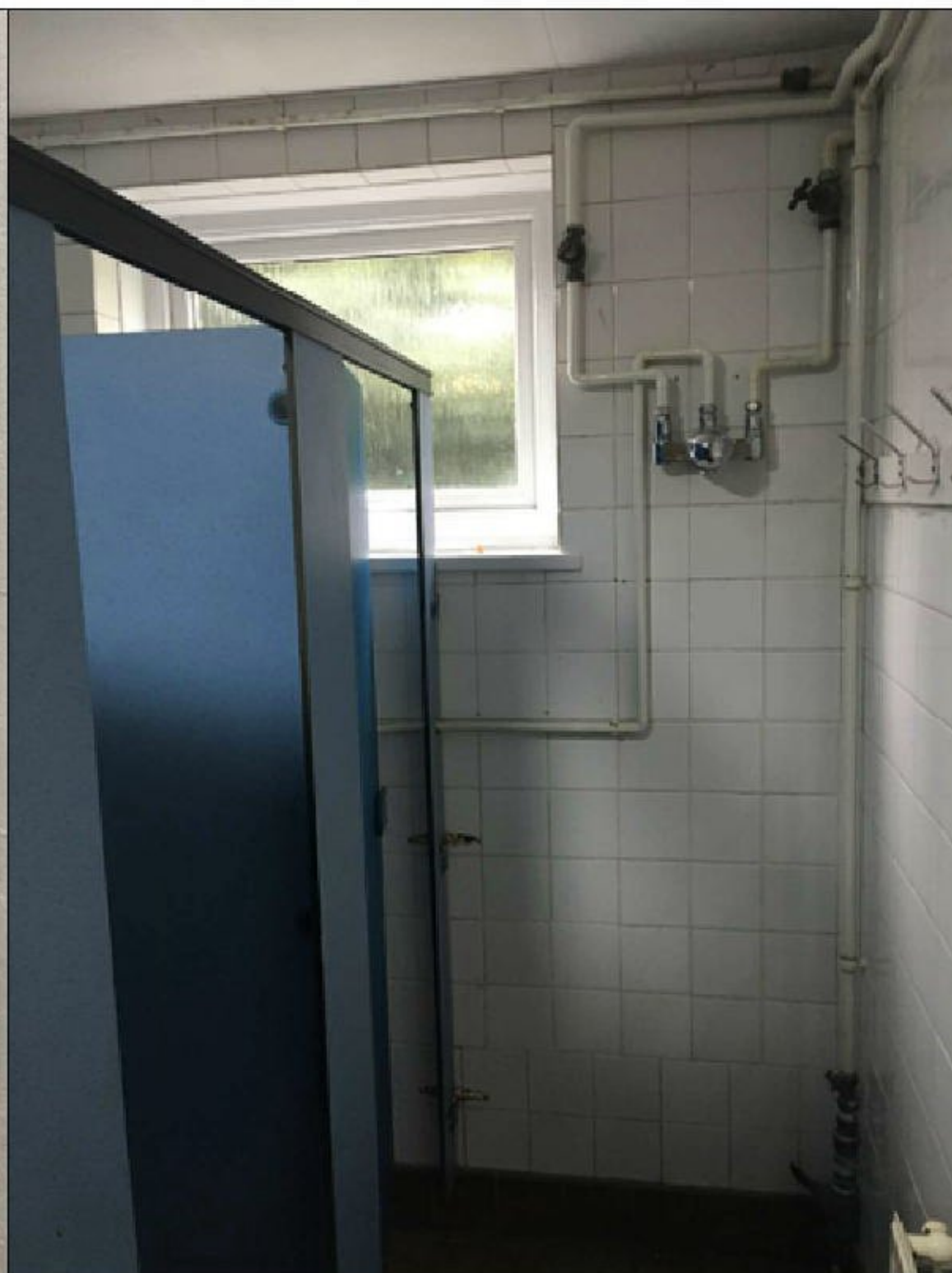
Internal Photo PW01b

Photo Location - Showers - PW01a & PW01b - See floor plans for location