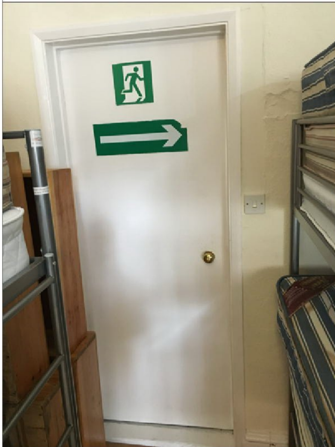
Internal Photo D102i

Photo Location - Brecon Dorm - Door Number D102 - See floor plans for location