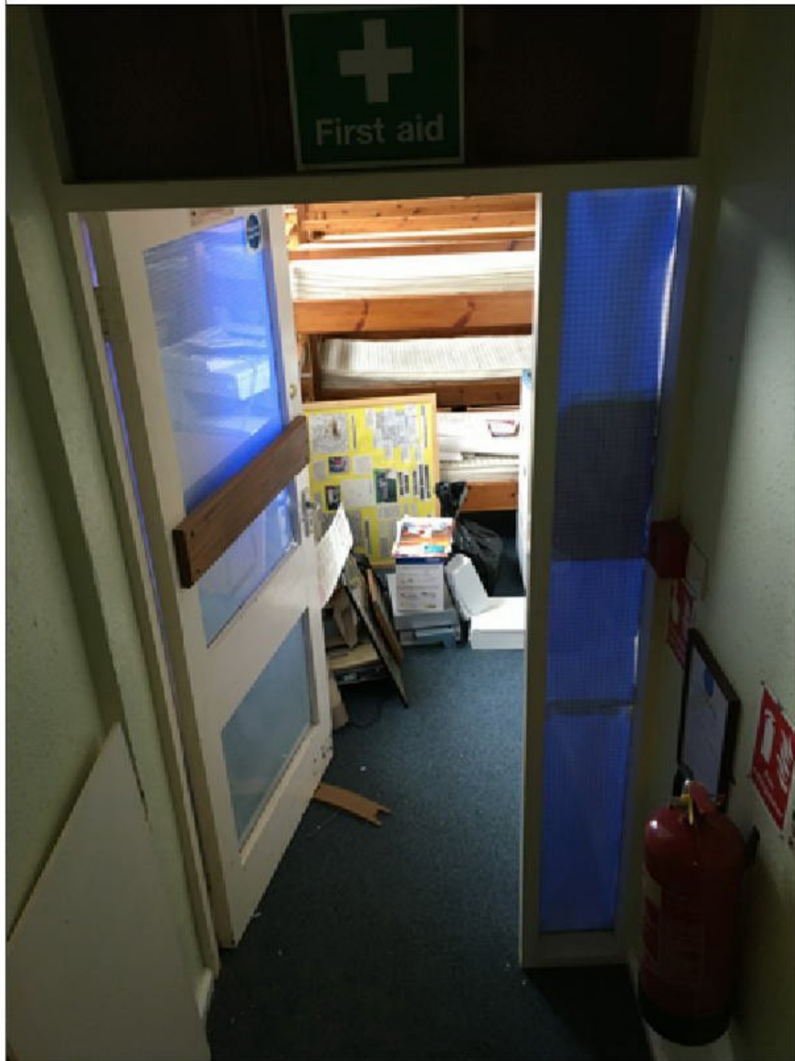
Internal Photo D107i

Photo Location - Lecture room - Door Number D107 - See floor plans for location