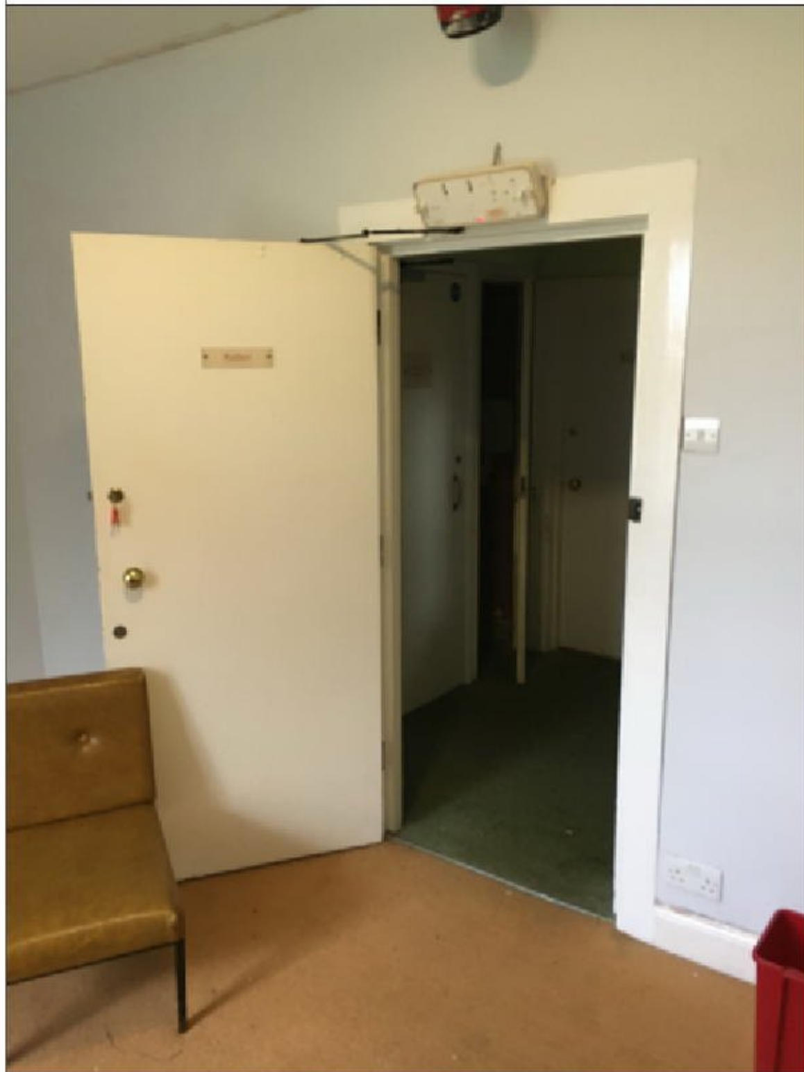
Internal Photo D108i

Photo Location - Nador Dorm - Door Number D108 - See floor plans for location