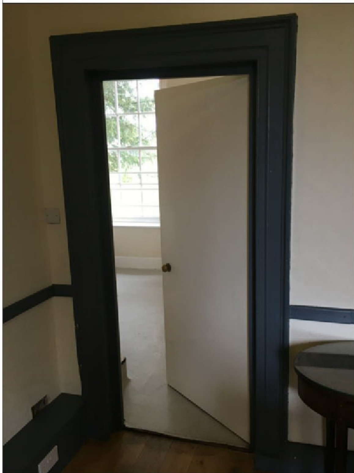
Internal Photo D116i

Photo Location - Bedroom 1 - Door Number D116 - See floor plans for location