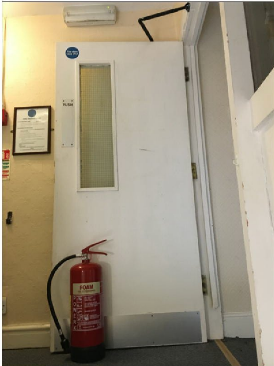
Internal Photo D203i

Photo Location - Landing - Door Number D203 - See floor plans for location