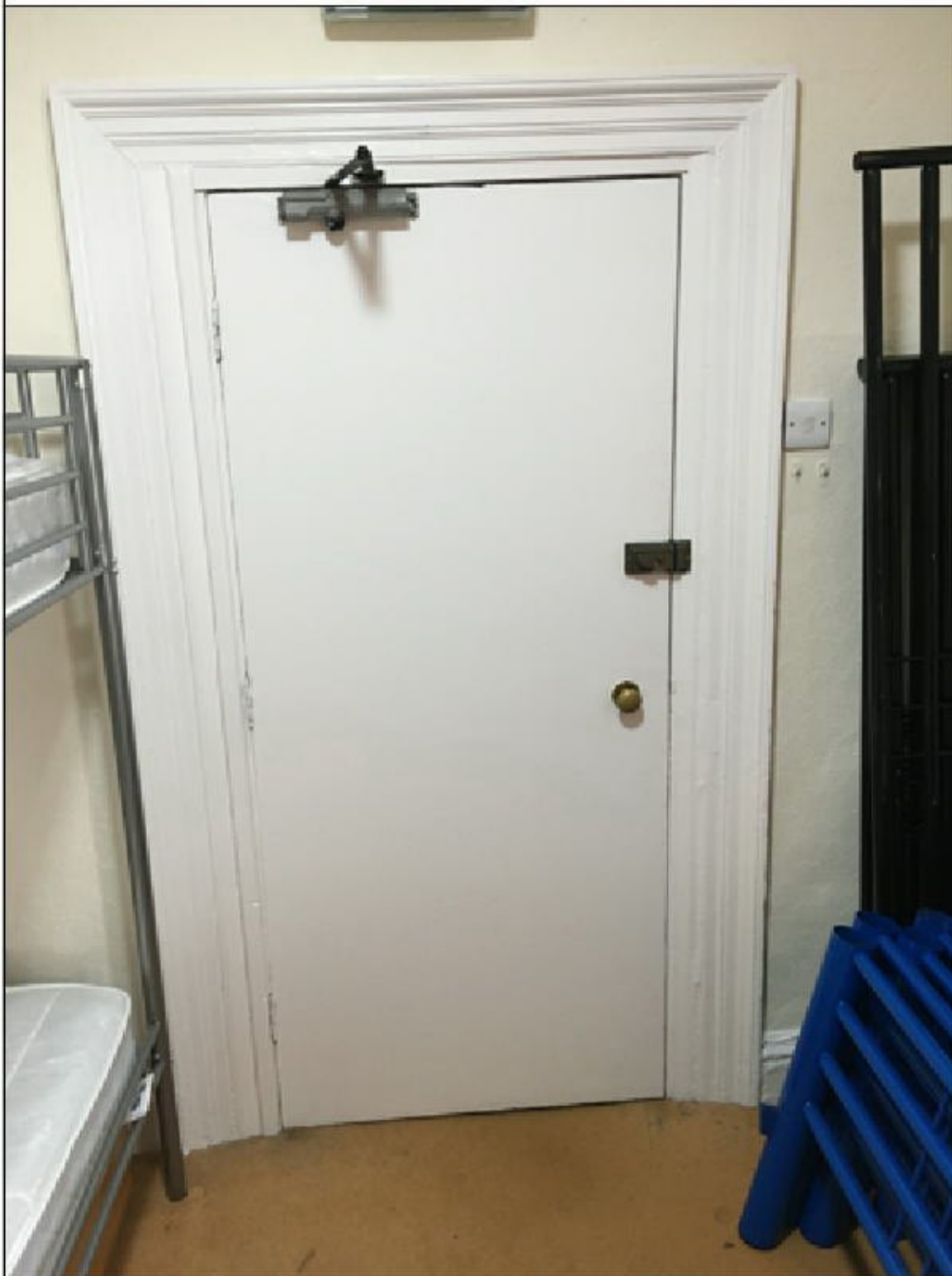
Internal Photo D101i

Photo Location - Brecon Dorm - Door Number D101 - See floor plans for location