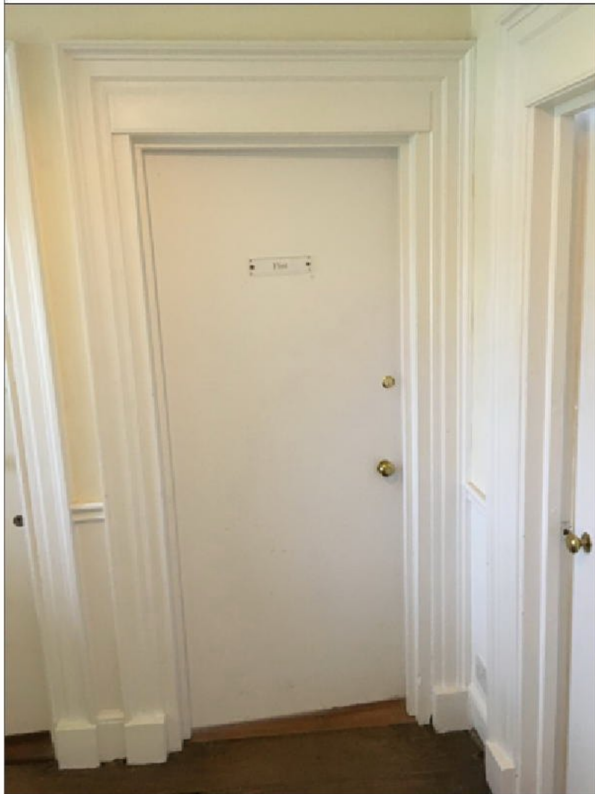
Internal Photo D1114i

Photo Location - Landing - Door Number D114 - See floor plans for location