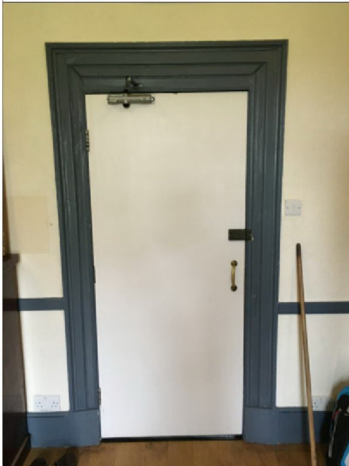
Internal Photo D110i

Photo Location - Wc - Door Number D110 - See floor plans for location