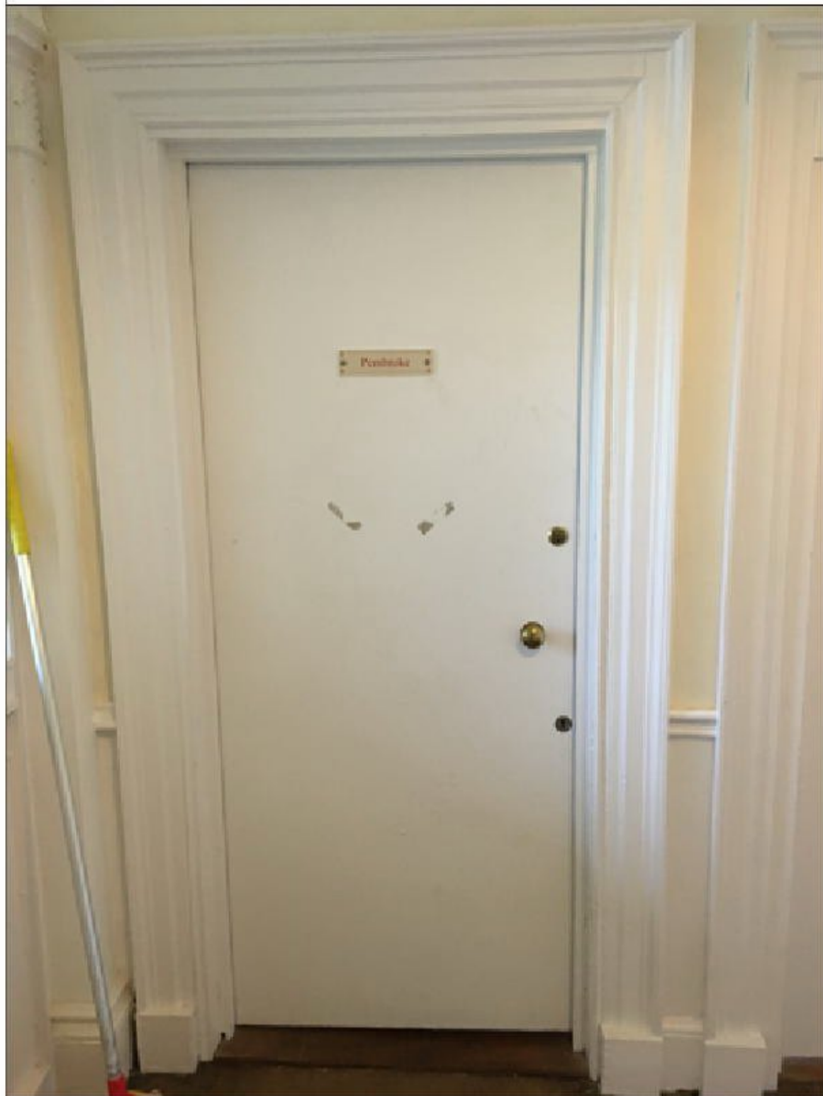
Internal Photo D115i

Photo Location - Landing - Door Number D115 - See floor plans for location