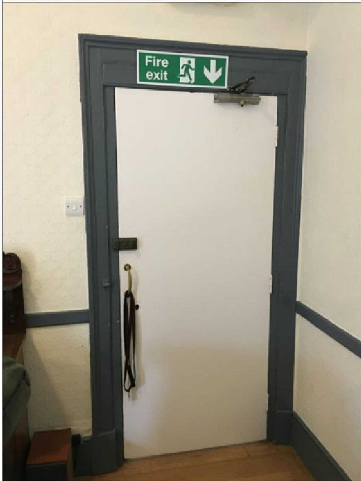
Internal Photo D111i

Photo Location - Landing - Door Number D111 - See floor plans for location