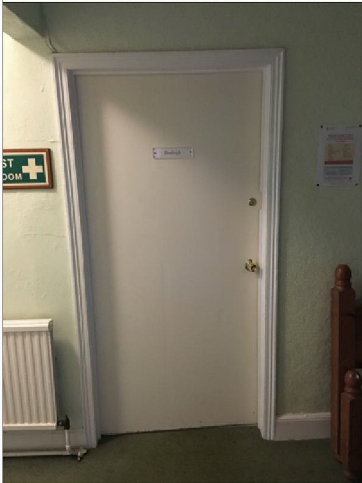
Internal Photo D106i

Photo Location - Landing - Door Number D106 - See floor plans for location