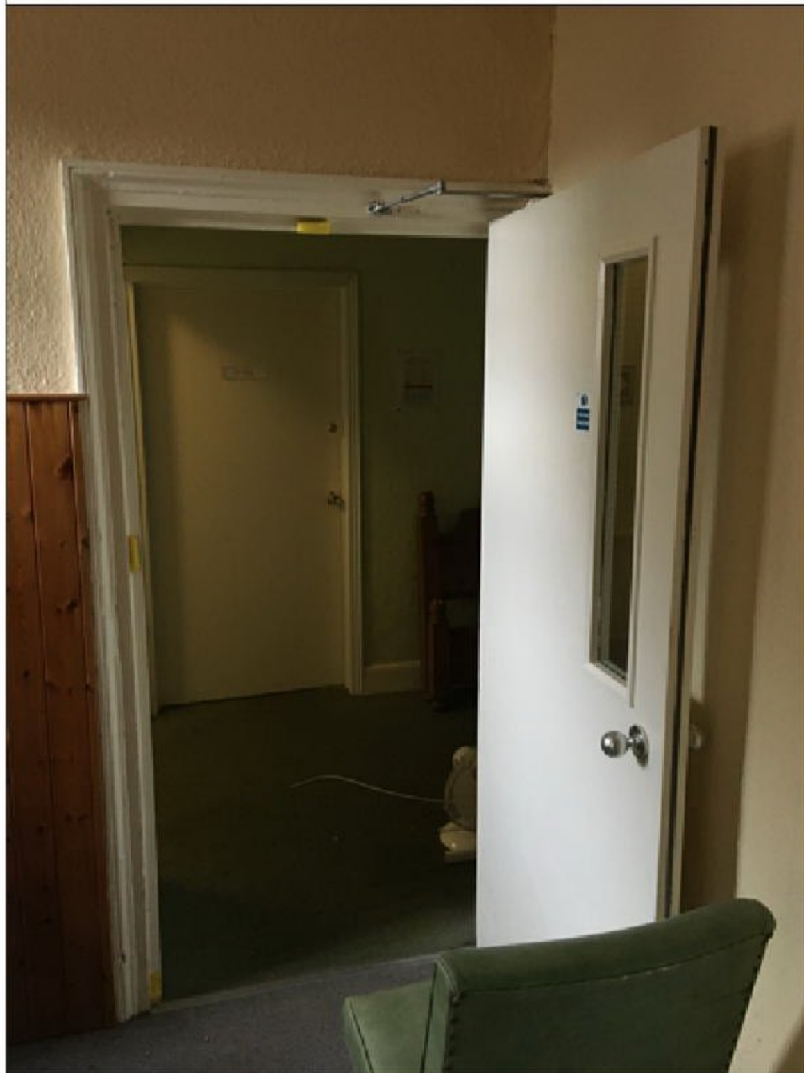
Internal Photo D105i

Photo Location - Back stairs - Door Number D105 - See floor plans for location