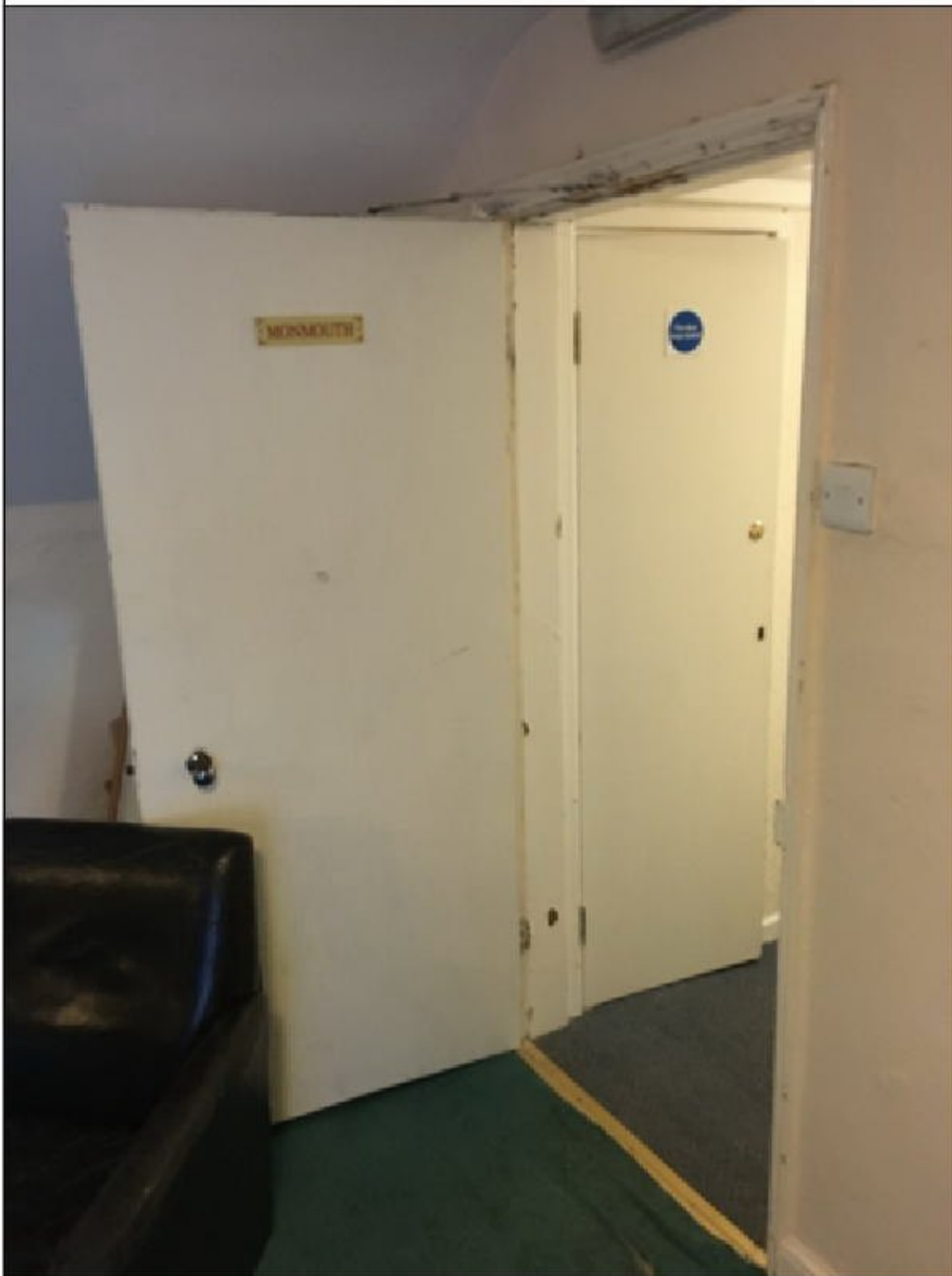
Internal Photo D201i

Photo Location - Bedroom 6 - Door Number D201 - See floor plans for location