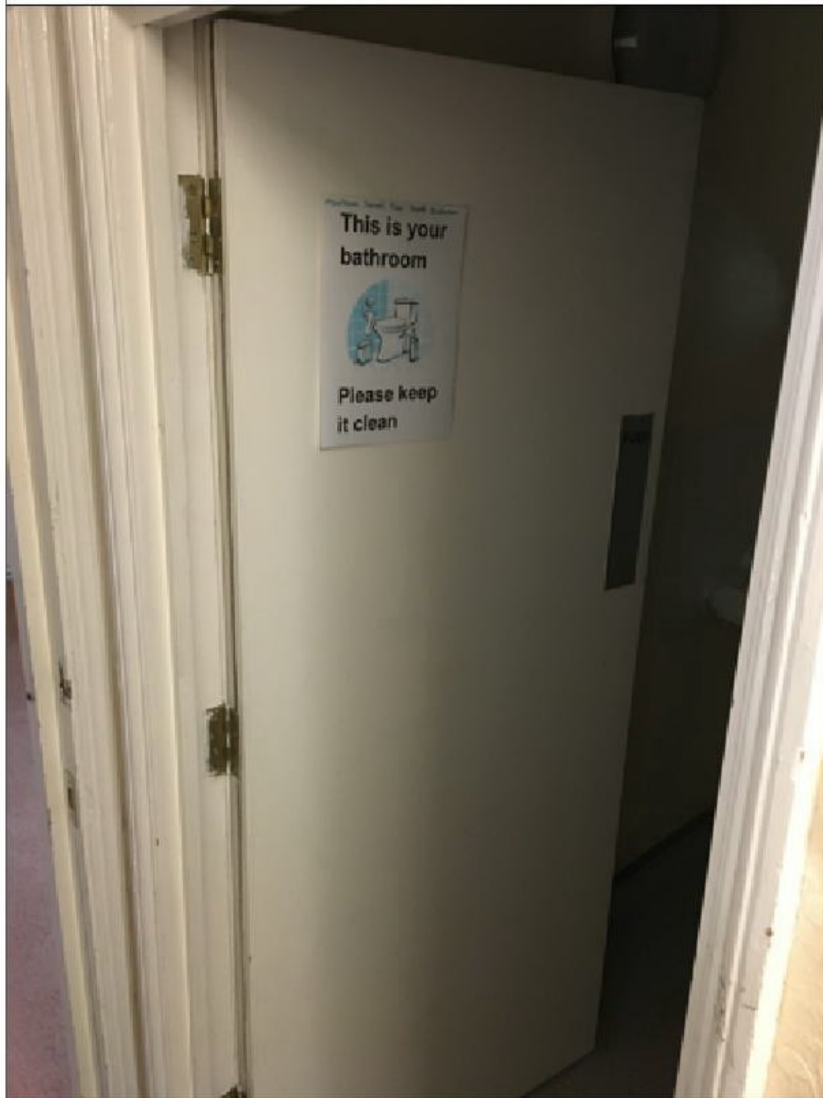
Internal Photo D204i

Photo Location - Landing - Door Number D204 - See floor plans for location