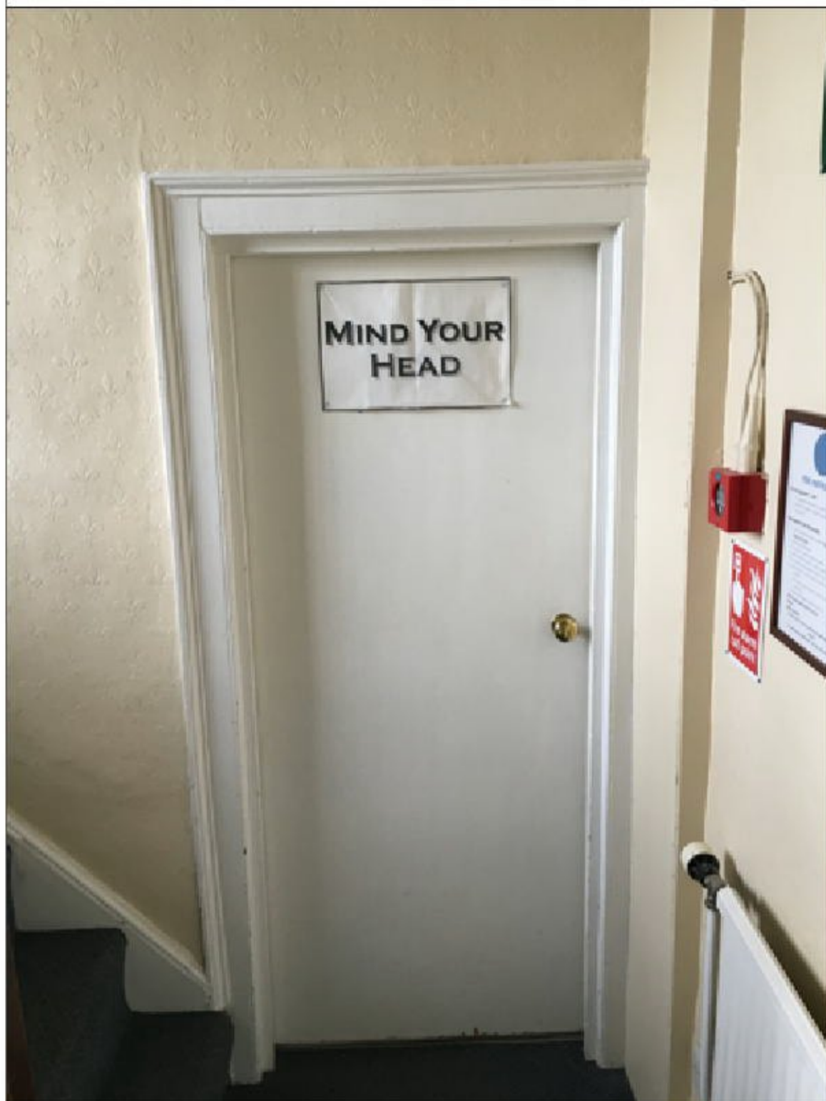
Internal Photo D117i

Photo Location - Stairwell - Door Number D117 - See floor plans for location