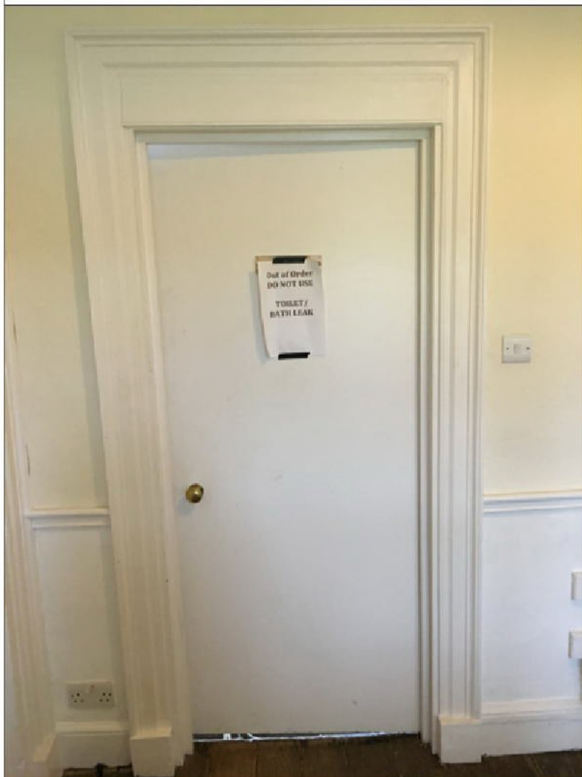
Internal Photo D1113i

Photo Location - Landing - Door Number D113 - See floor plans for location