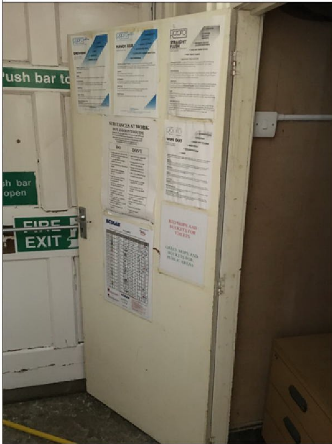
Internal Photo D004i

Photo Location - Cupboard in hall - Door Number D004 - See floor plans for location