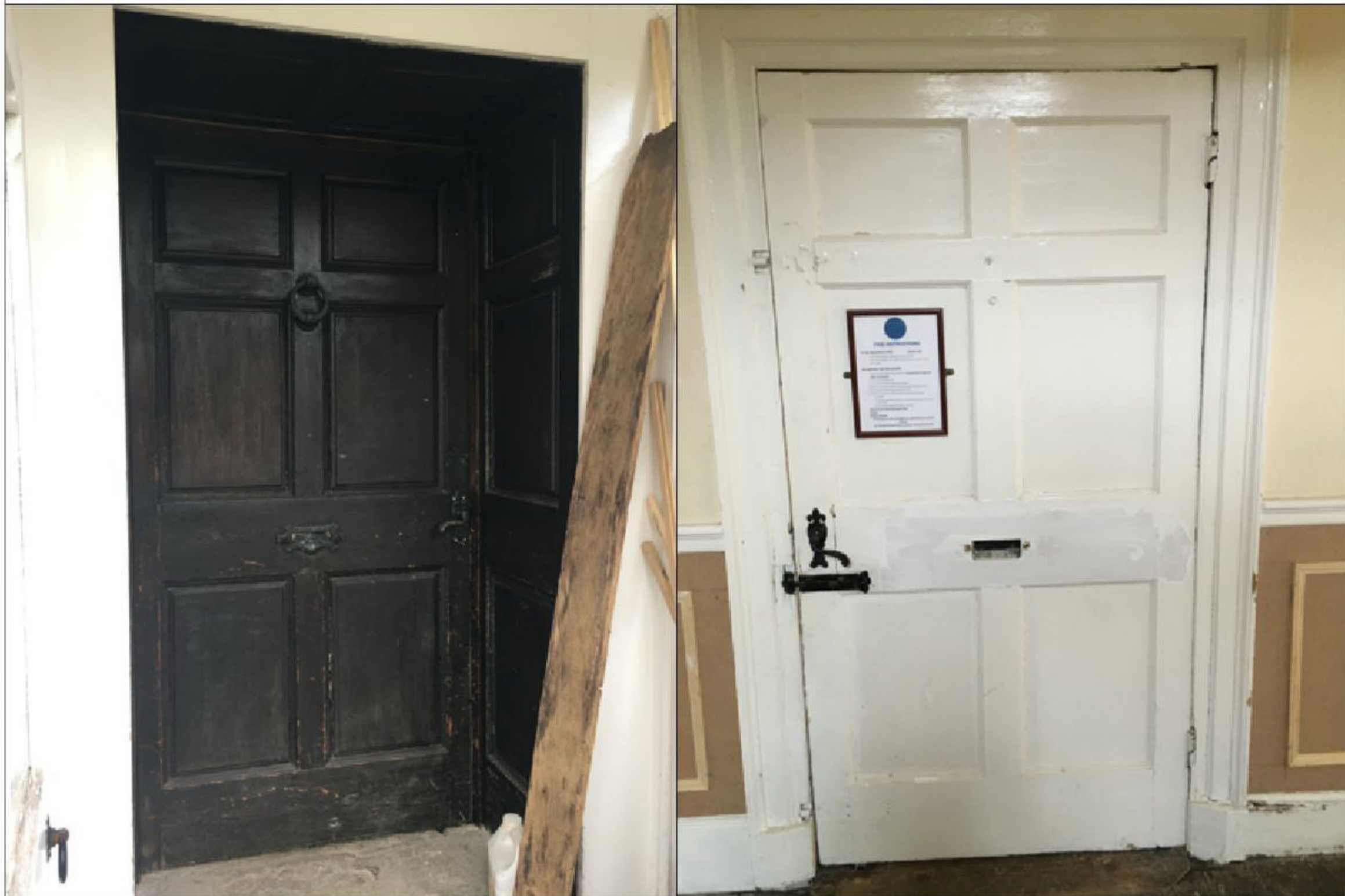
External Photo ED003E