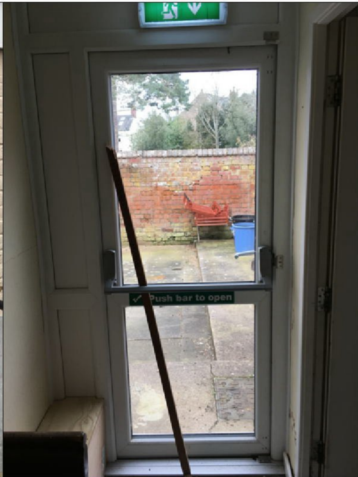
External Photo ED008i

Photo Location - External West - Door Number ED008 - See floor plans for location