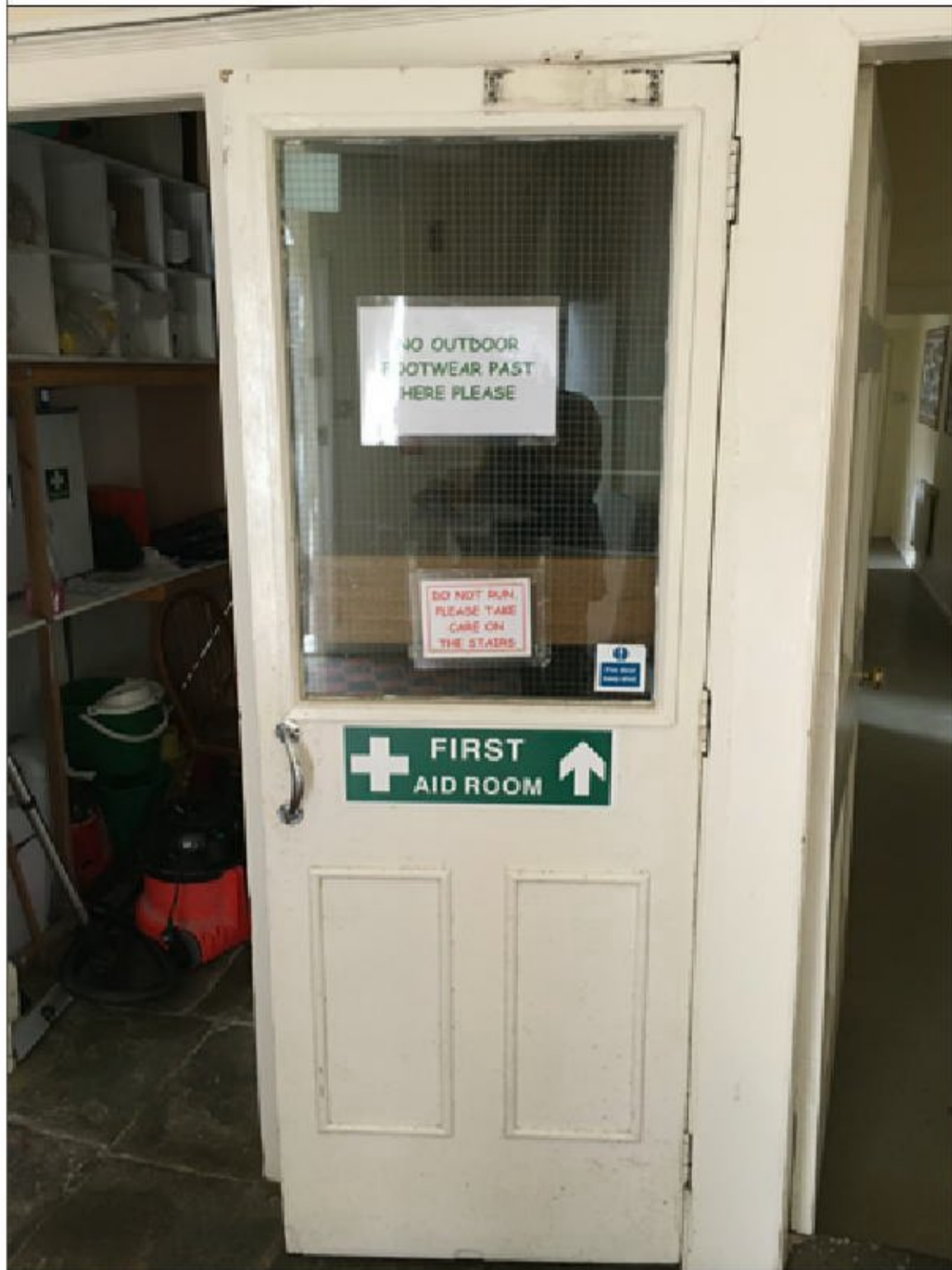
Internal Photo D008i

Photo Location - Entrance Hall - Door Number D008 - See floor plans for location