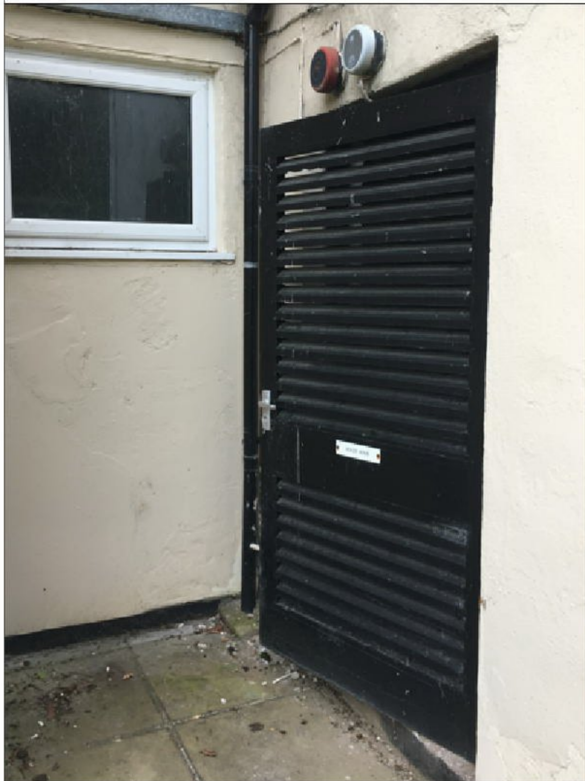
External Photo ED007E

Photo Location - External South - Door Number ED007 - See floor plans for location