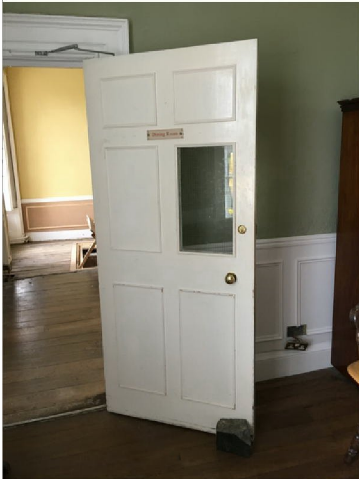
Internal Photo D003i

Photo Location - Dining Room - Door Number D003 - See floor plans for location