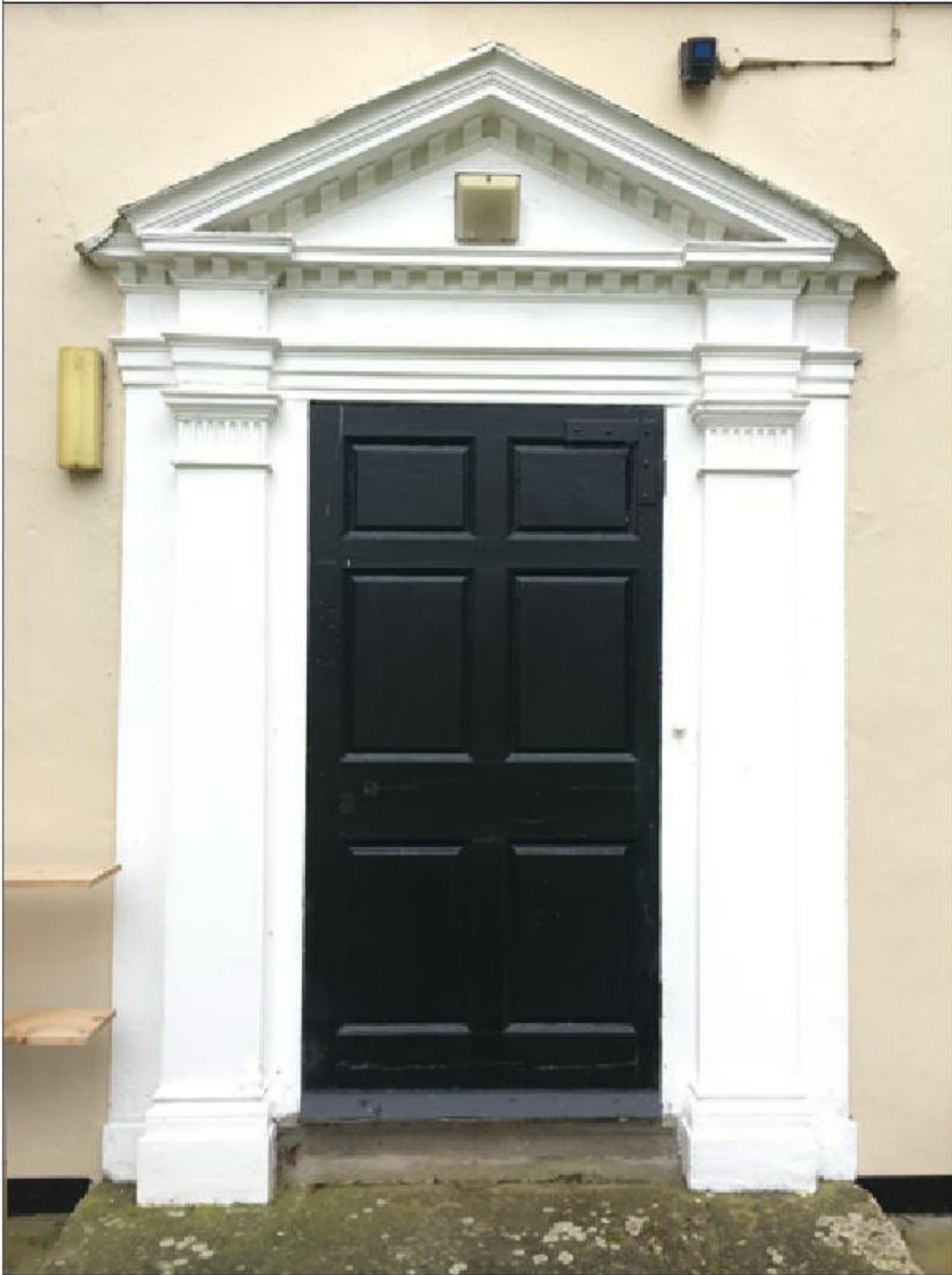
External Photo ED004E

Photo Location - External East - Door Number ED005 - See floor plans for location