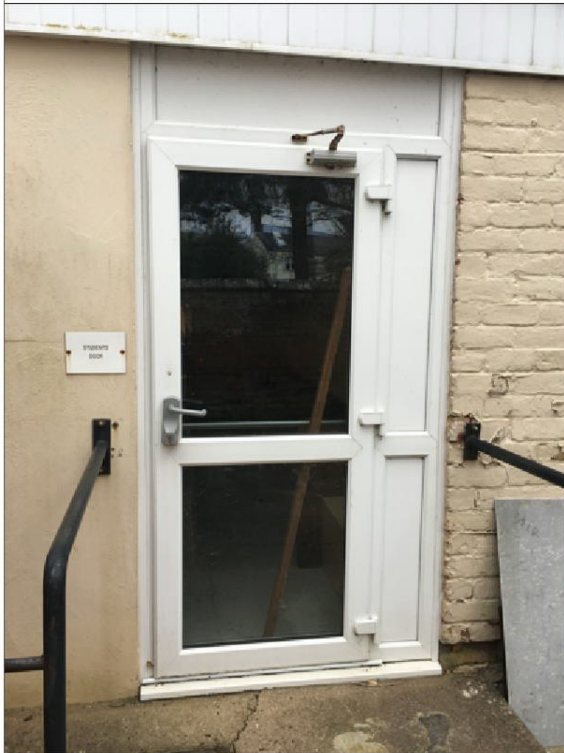
External Photo ED008E