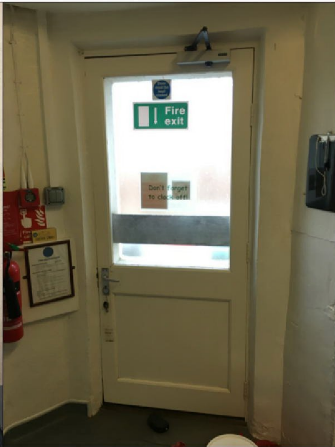
External Photo ED009E