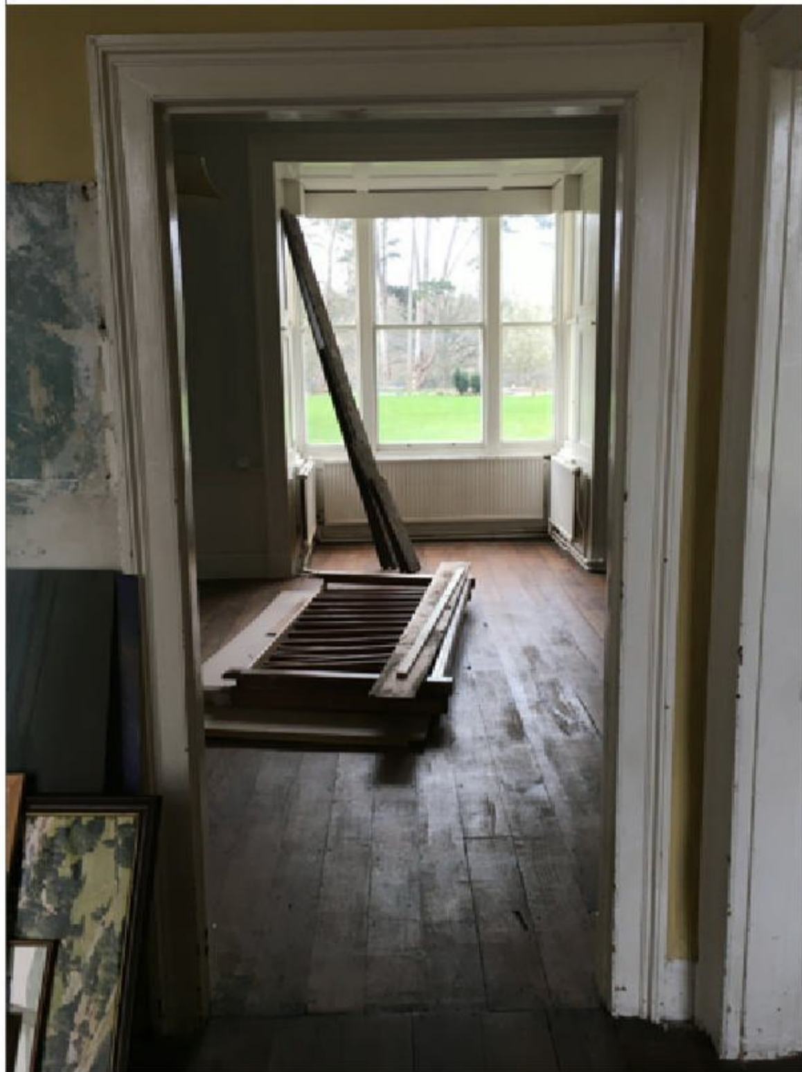
Internal Photo D002i

Photo Location - Lounge - Door Number D002 - See floor plans for location