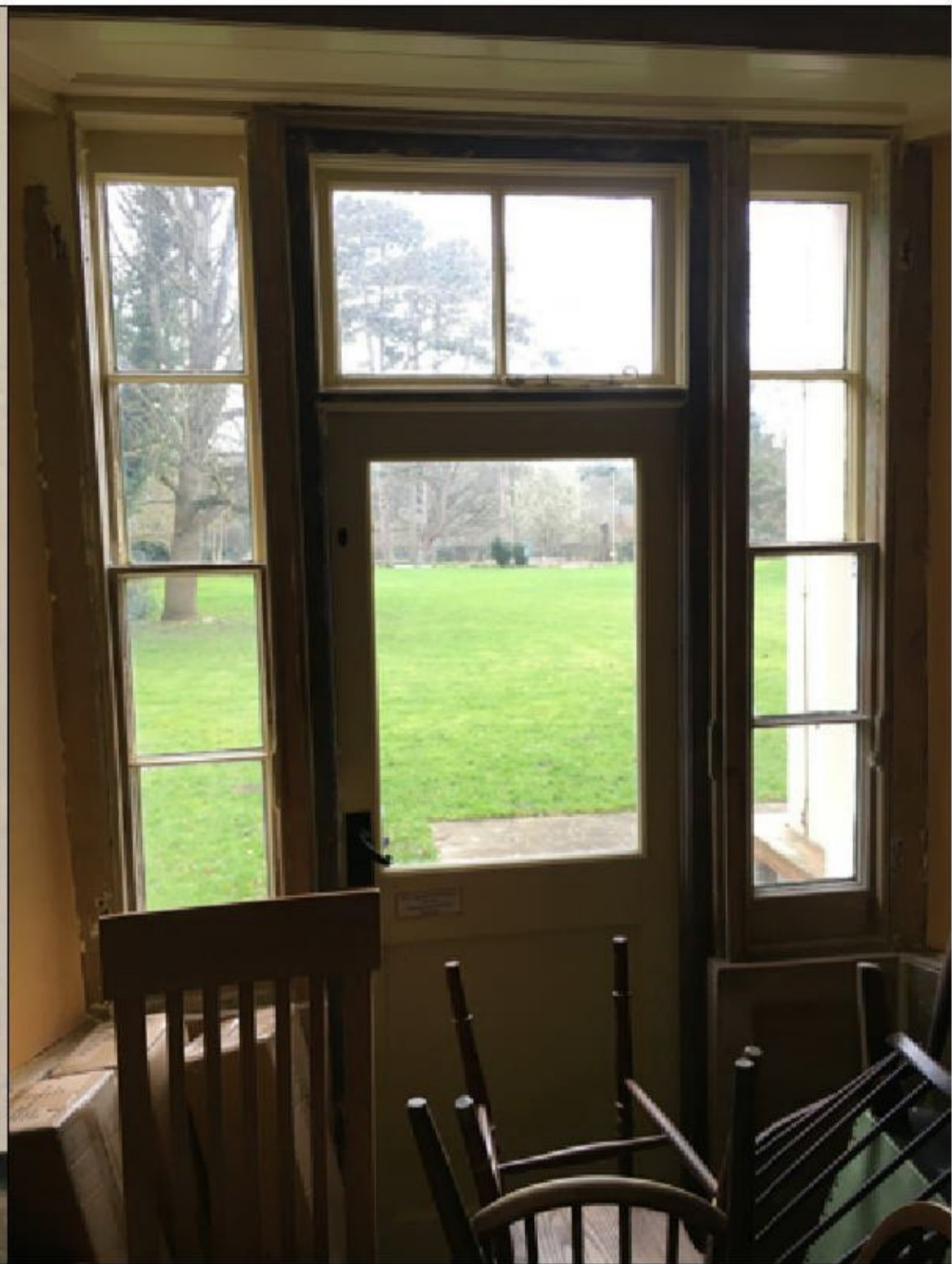
Internal Photo ED006i

Photo Location - External East - Door Number ED006 - See floor plans for location