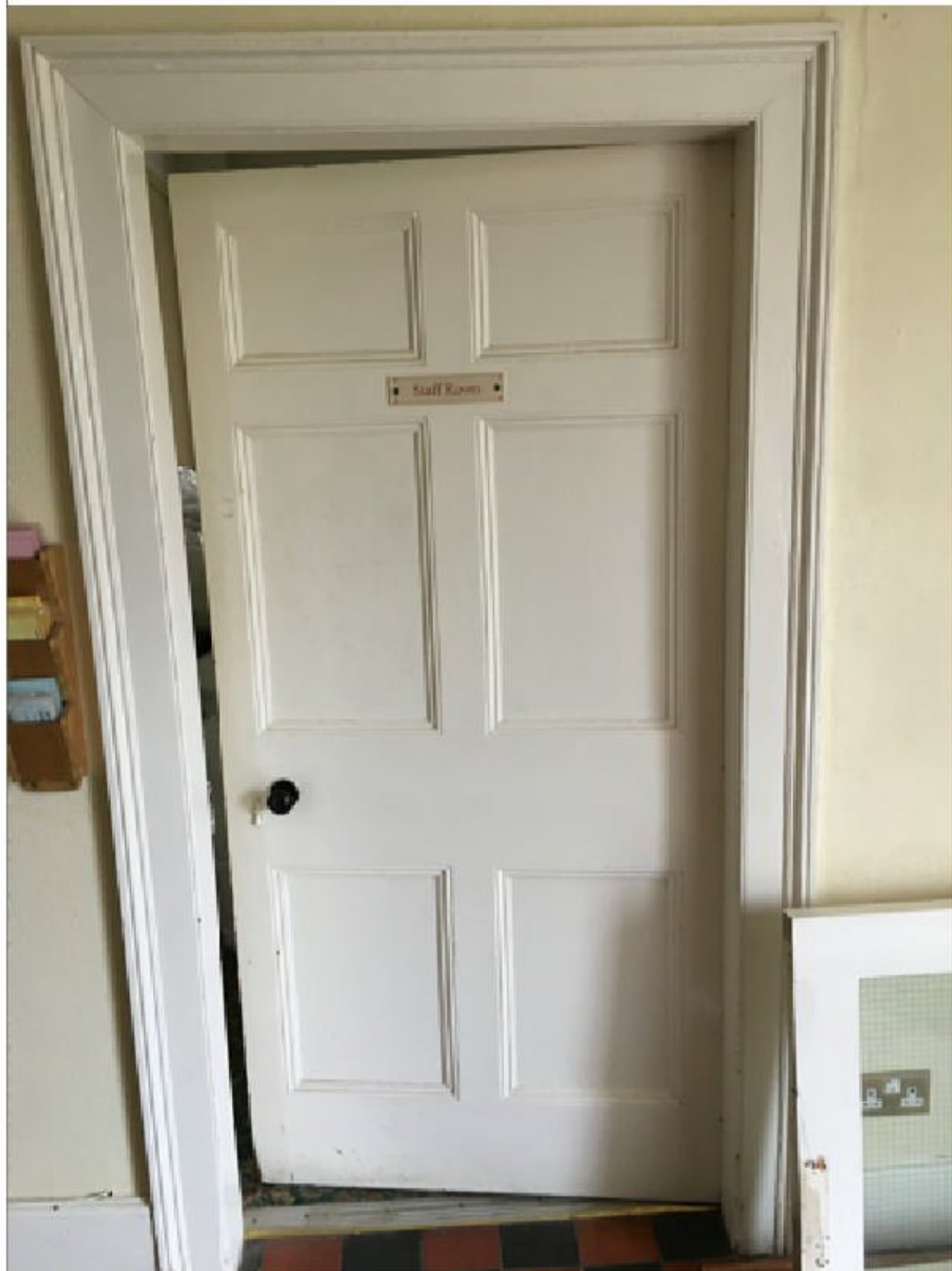
Internal Photo D005i

Photo Location - Staff Room - Door Number D005 - See floor plans for location