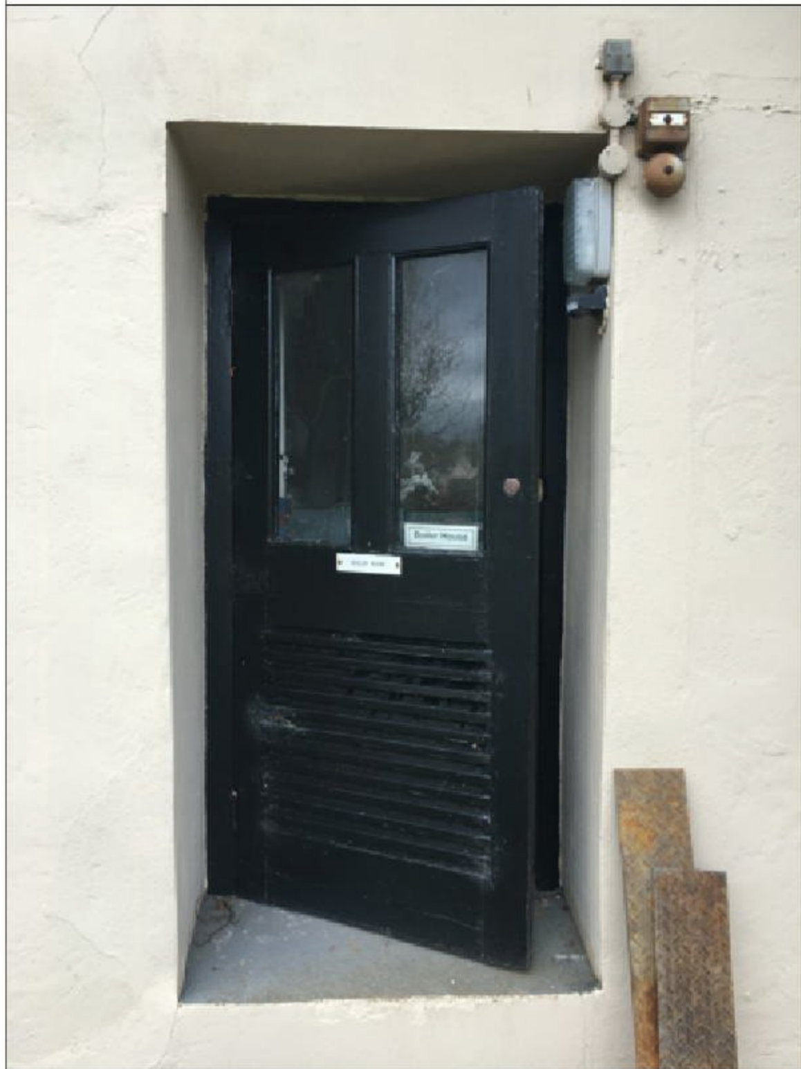
External Photo ED004E

Photo Location - External West - Door Number ED004 - See floor plans for location