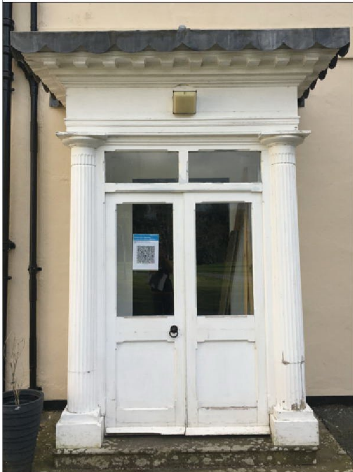
External Photo ED002E

Photo Location - External West - Door Number ED002 - See floor plans for location