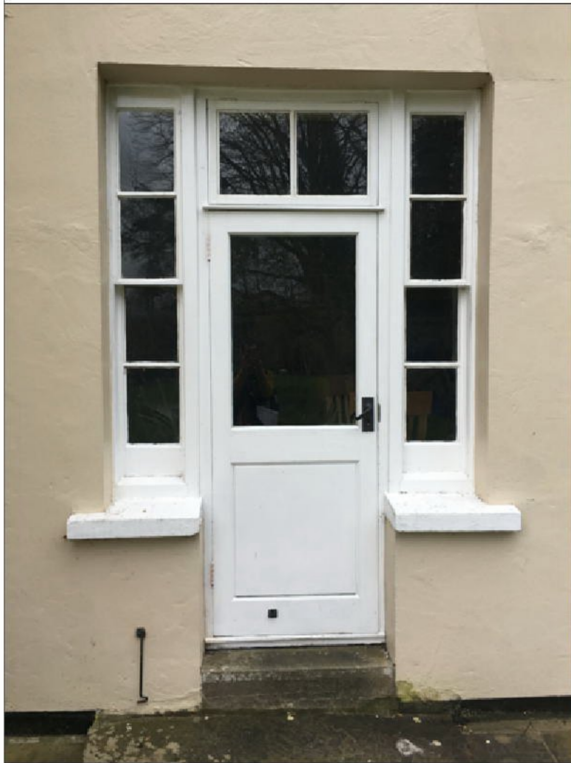
External Photo ED006E