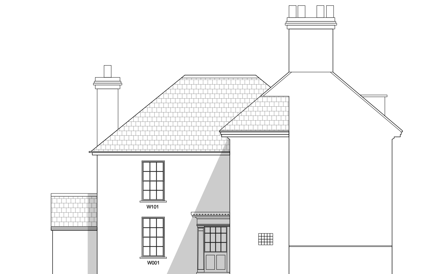
Existing South Elevation Scale: 1:100