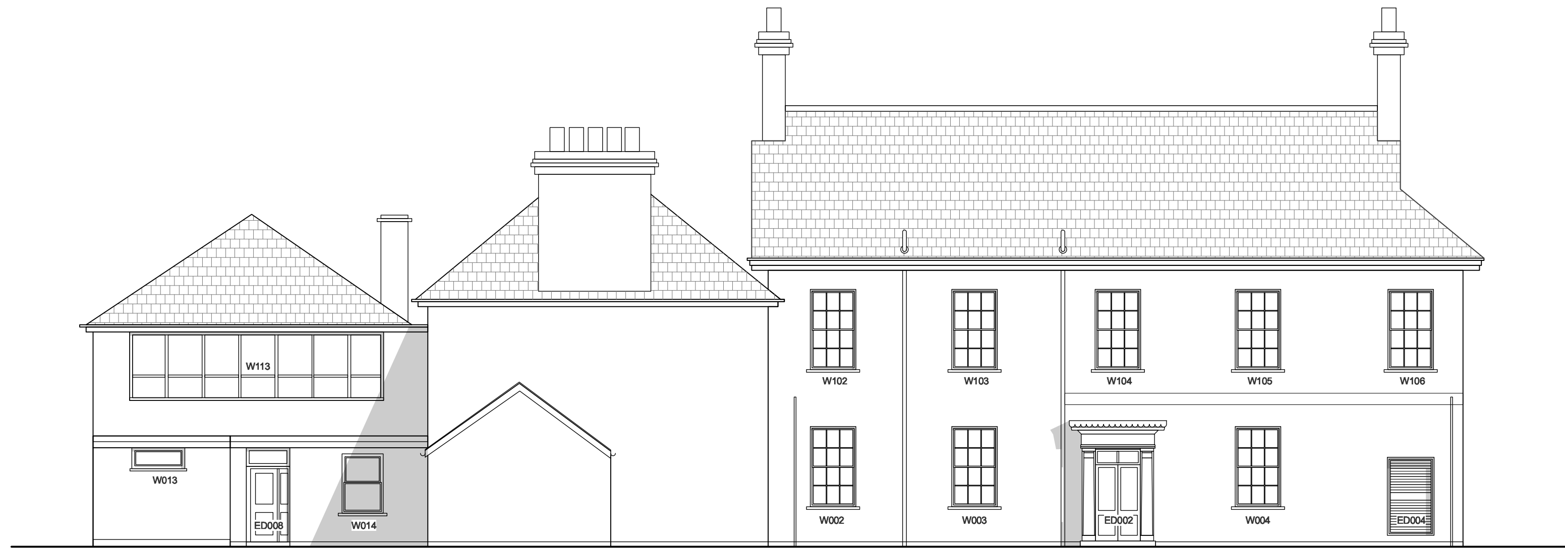
Existing West Elevation Scale: 1:100