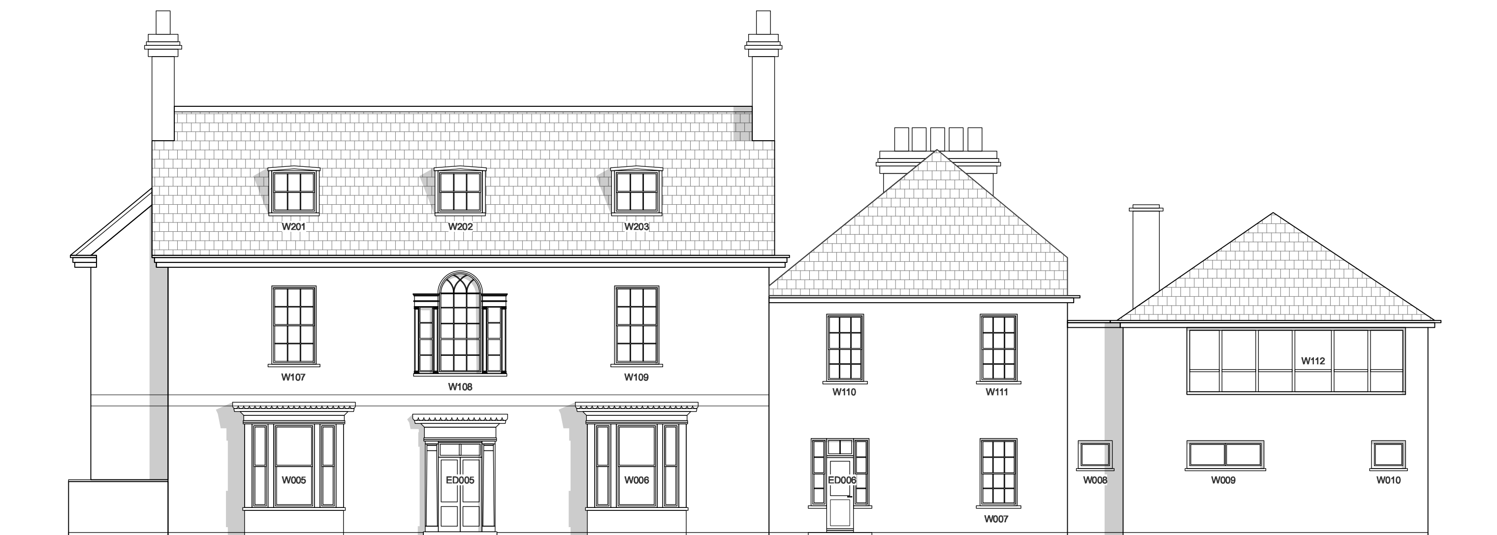
Existing East Elevation Scale: 1:100