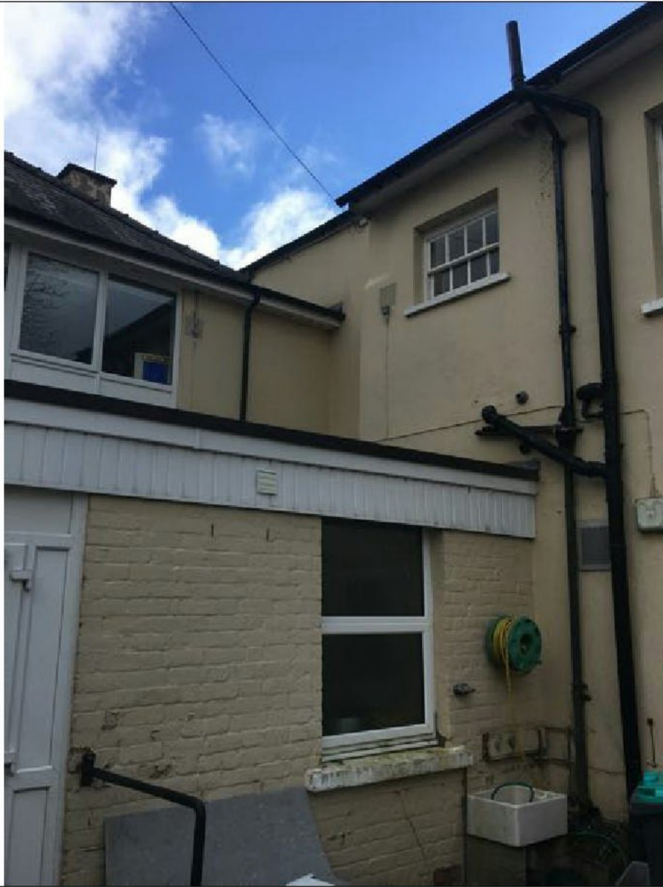
Photo Location - West Courtyard b