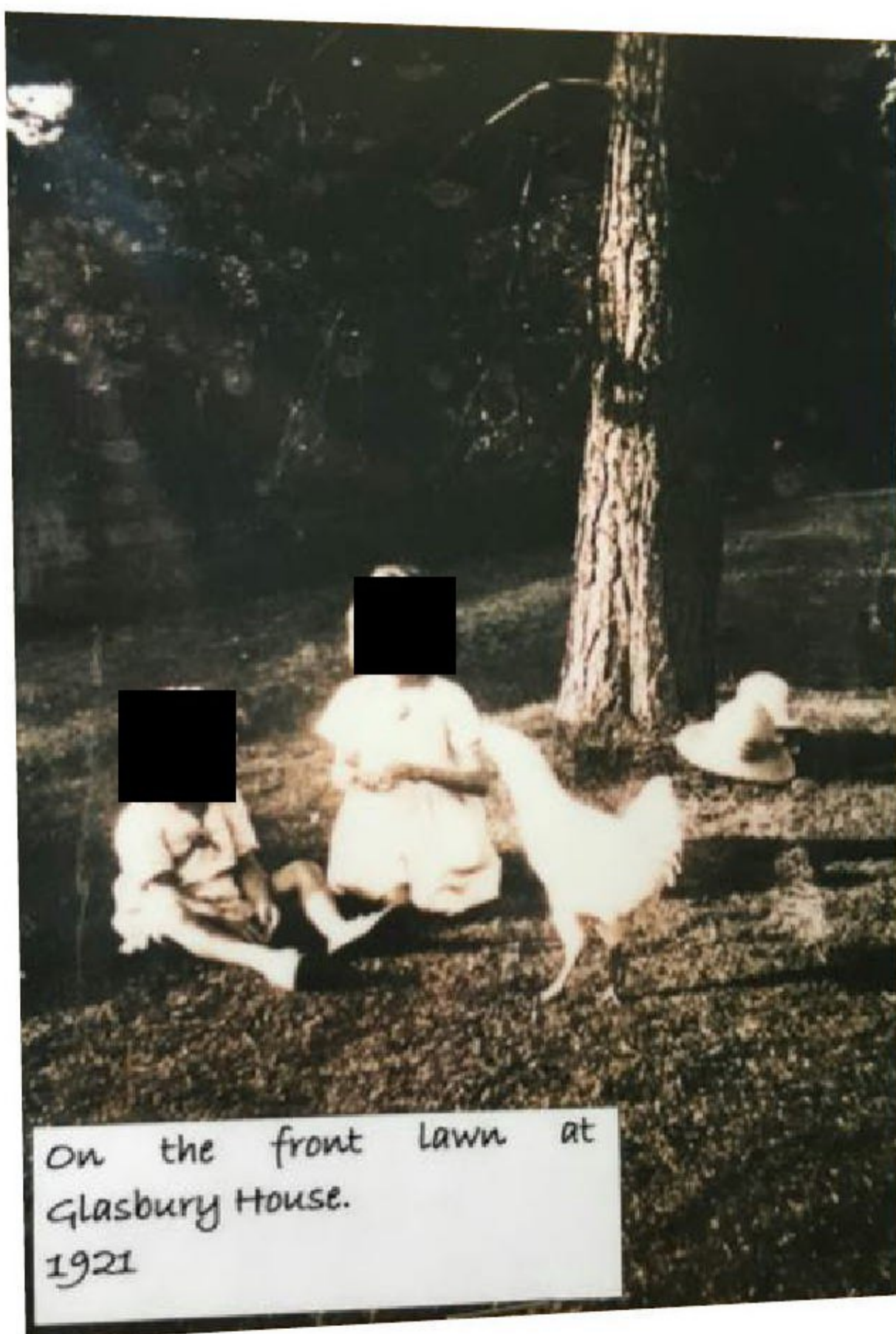
On the front lawn at Glasbury House. 1921