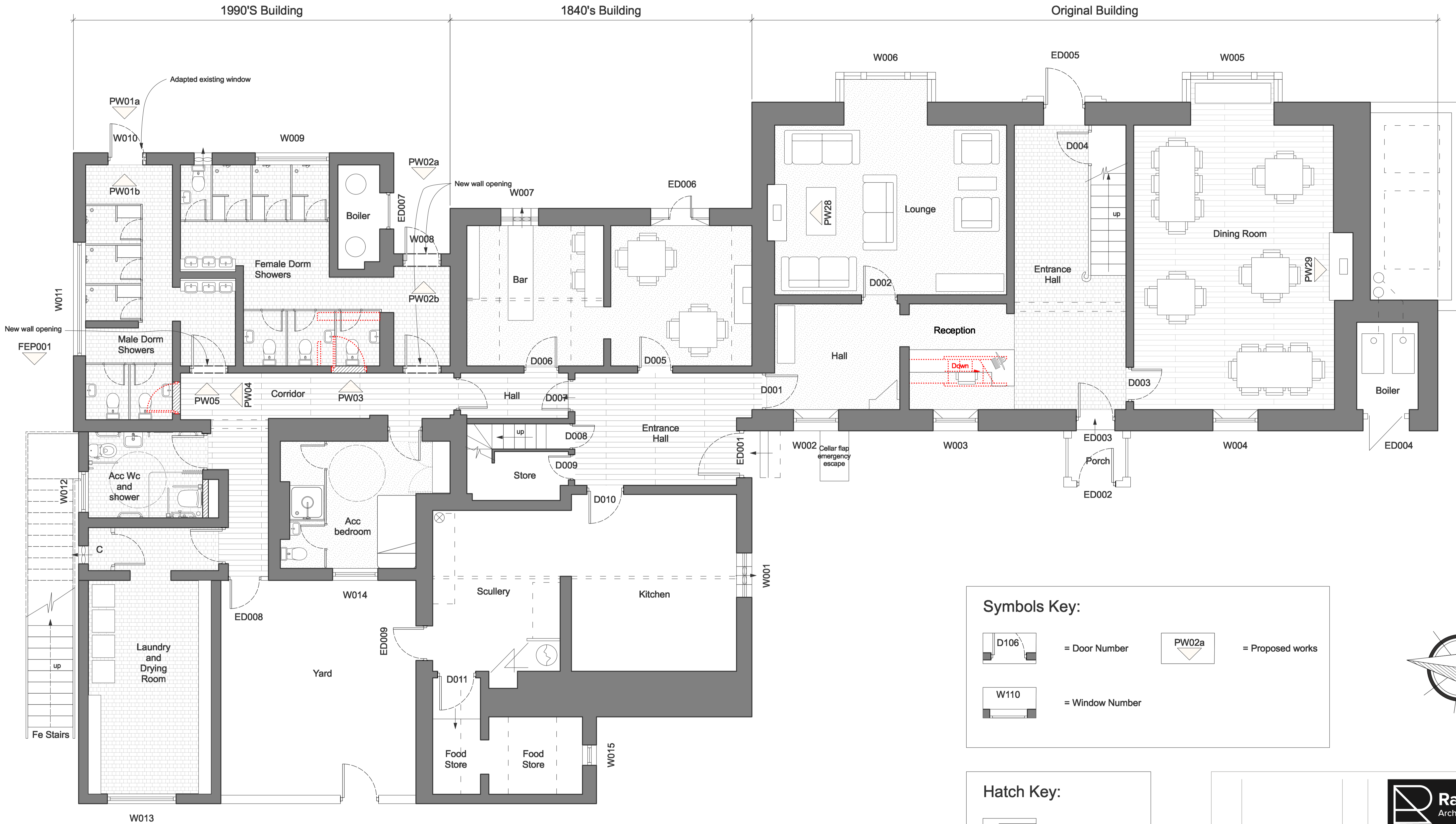
Proposed Ground Floor Plan Scale: 1:50

General Notes : Do not scale off drawings. These drawings are concept only and are not for construction. all financial, structural and building control items are to be considered by additional specific professional advice