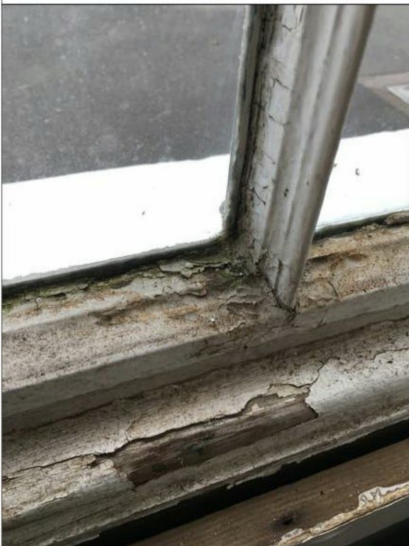
Photo Location - West_Window Number W003 - See floor plans for location

Located with 1750's section of the building