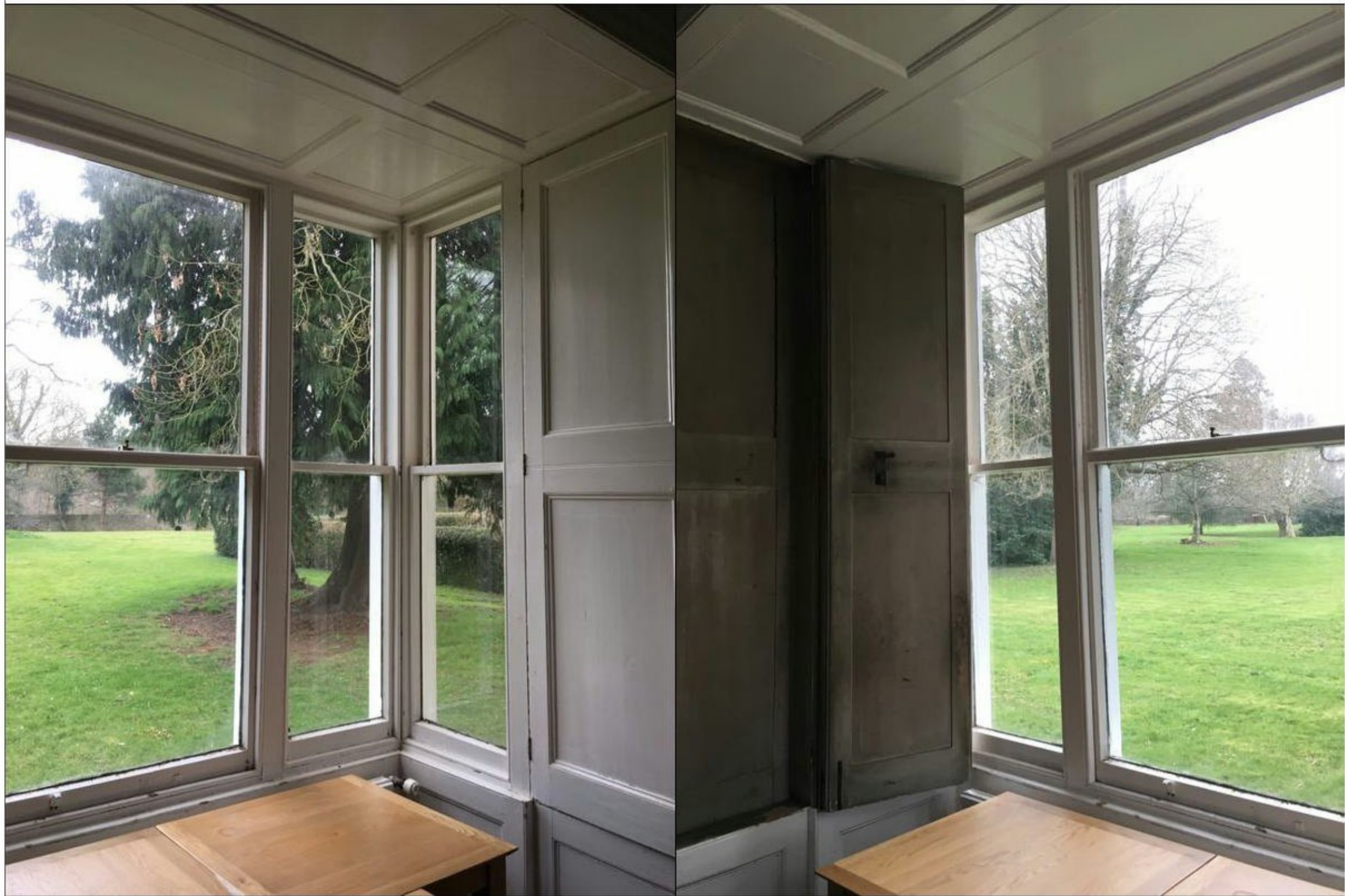
External Photo W005ia