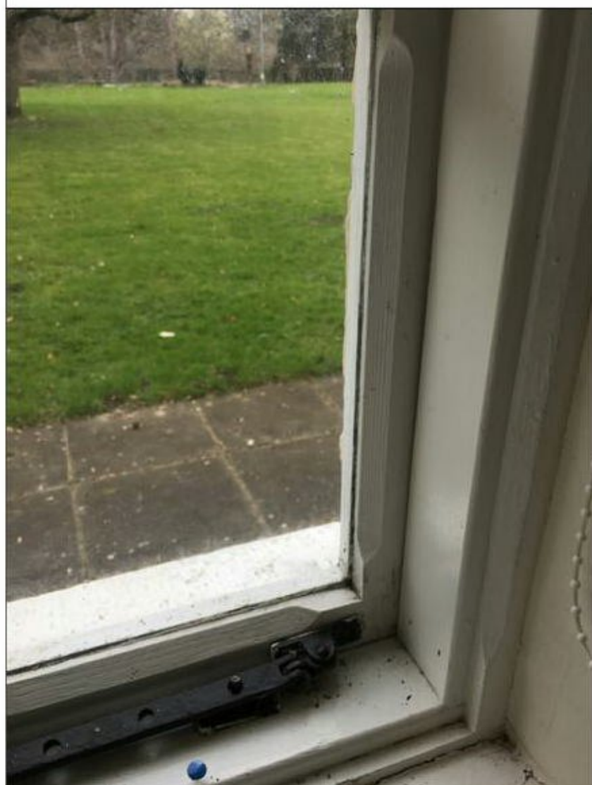
Photo Location - East_Window Number W007 - See floor plans for location

Located with 1840's section of the building