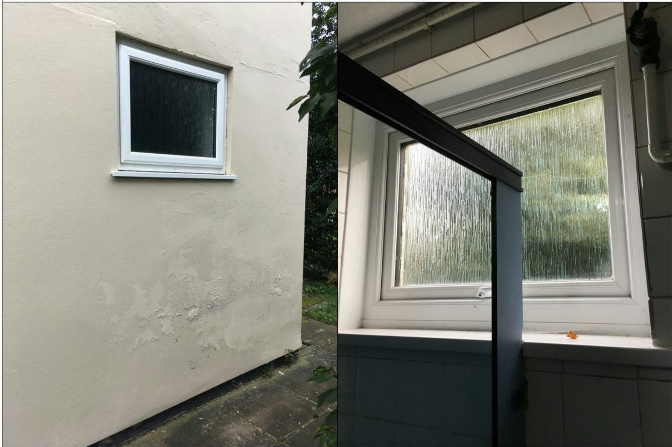
External Photo W010E