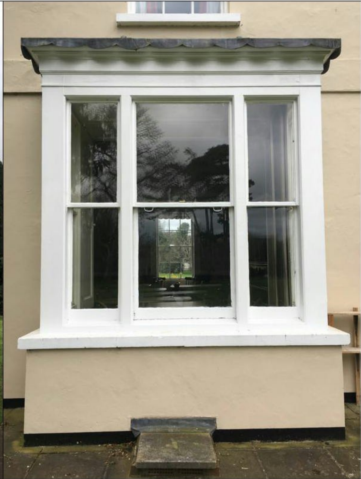
Internal Photo W005Eb

Photo Location - East_Window Number W005 - See floor plans for location