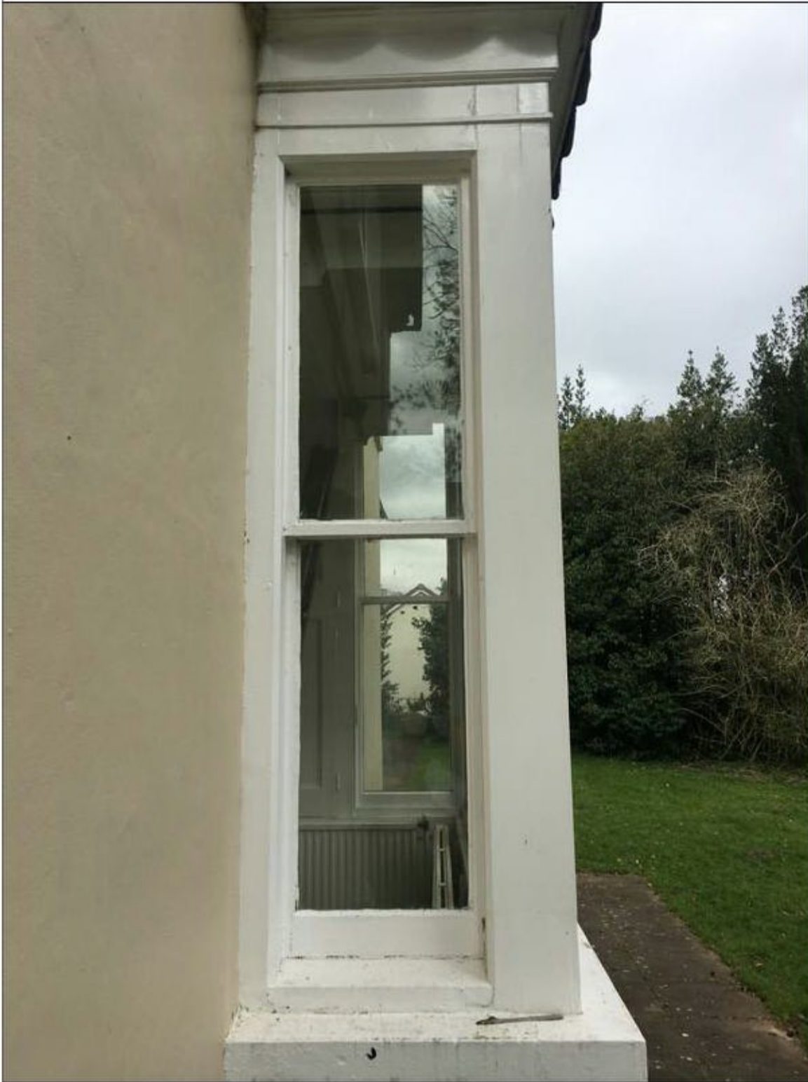
External Photo W006Ea