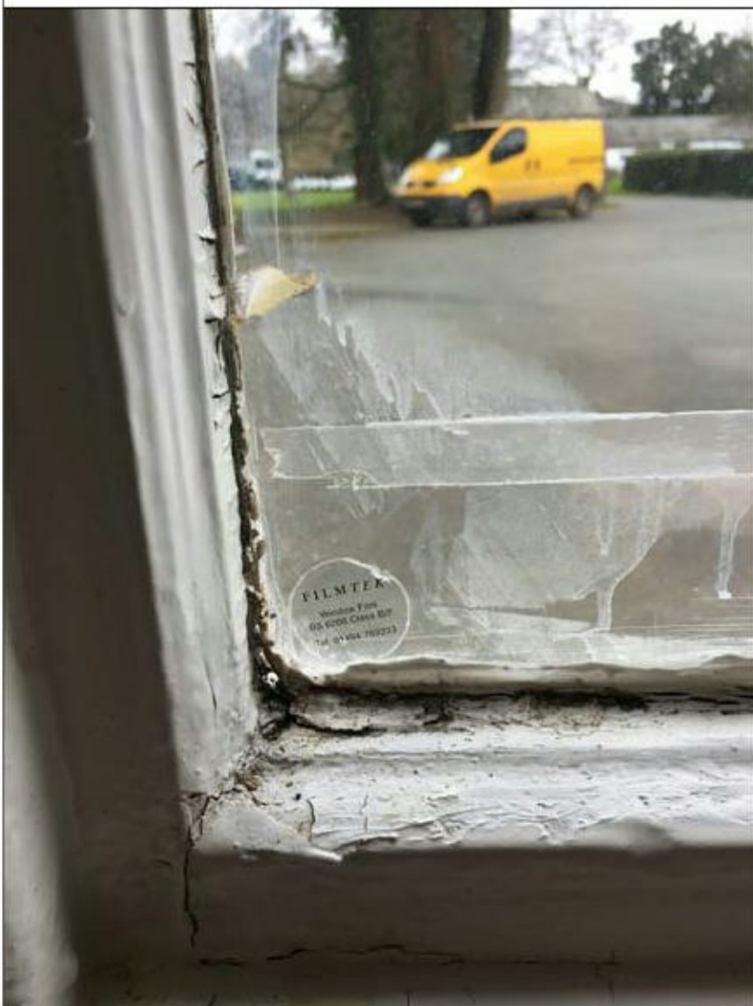
Frame Photo W001ib

Photo Location - South_Window Number W001 - See floor plans for location