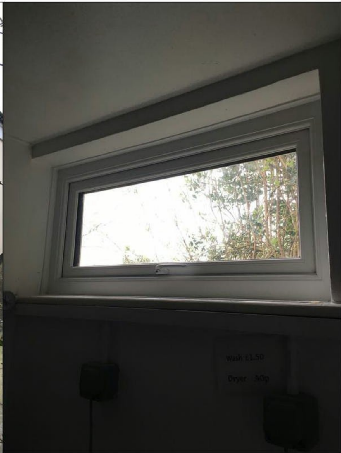
External Photo W012E