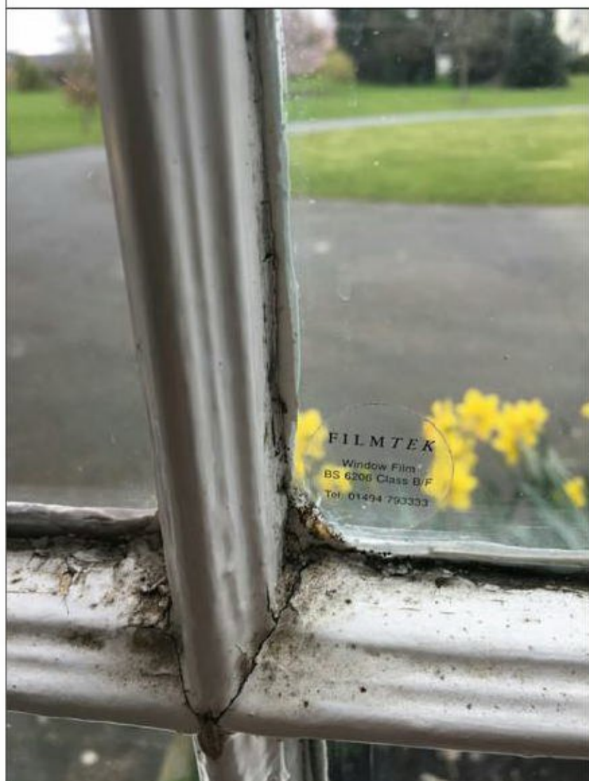
Frame Photo W004ib

Photo Location - West_Window Number W004 - See floor plans for location