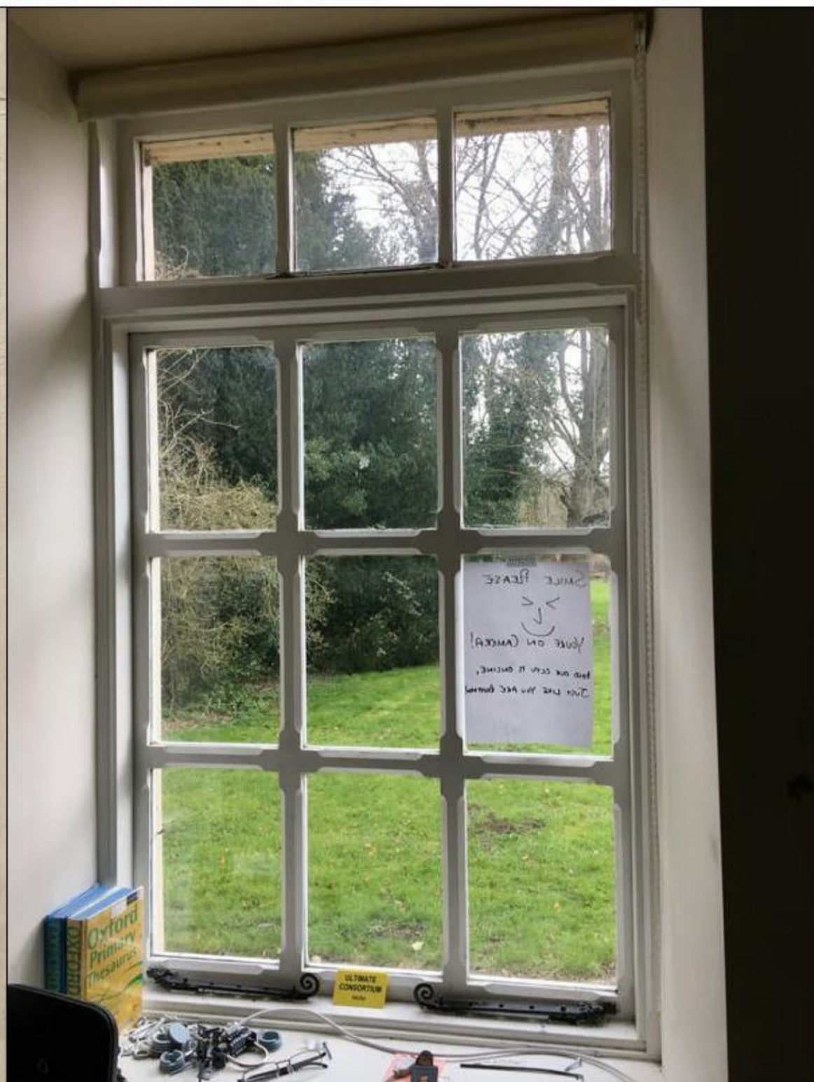
External Photo W007E