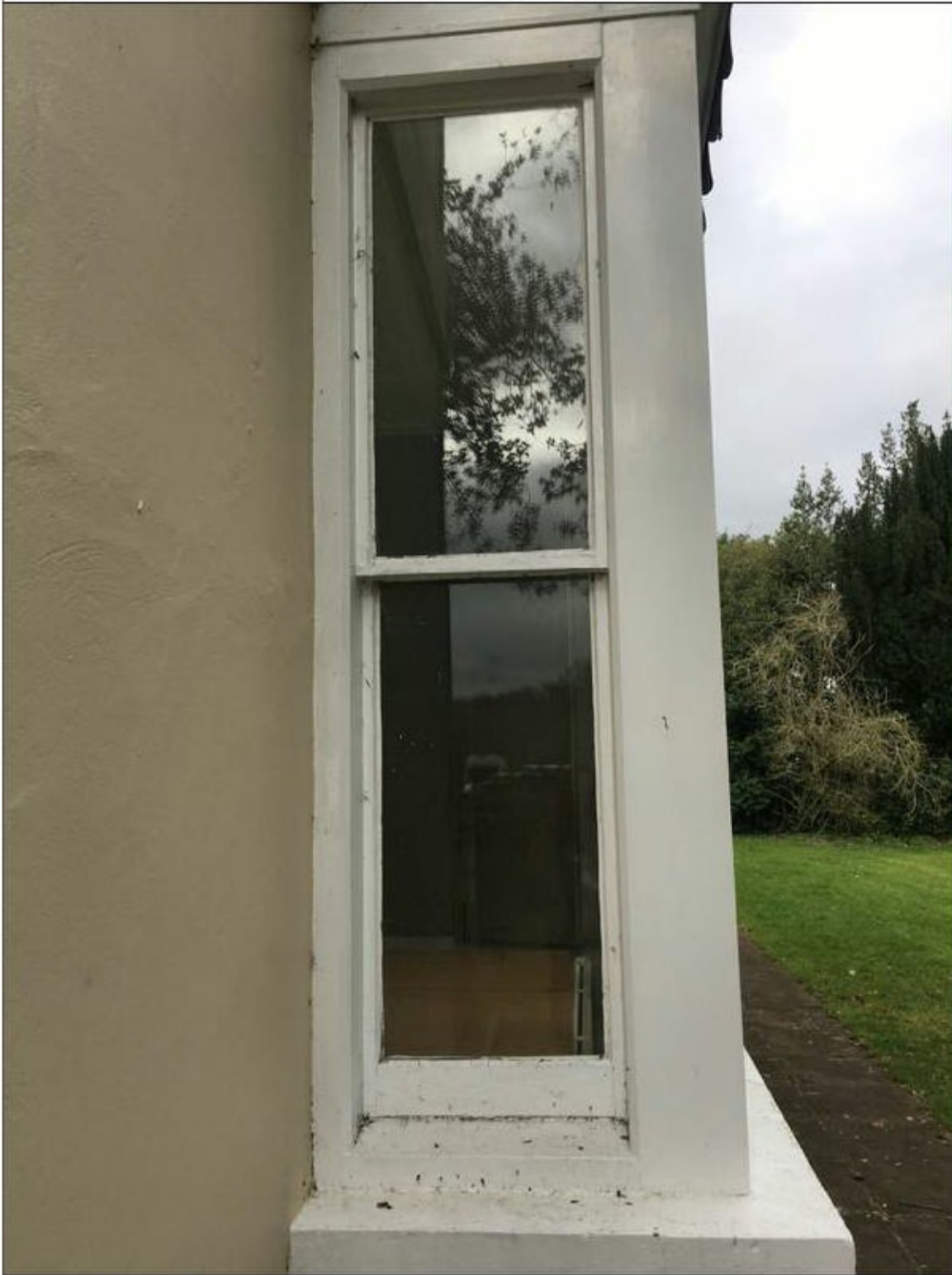
External Photo W005Ea