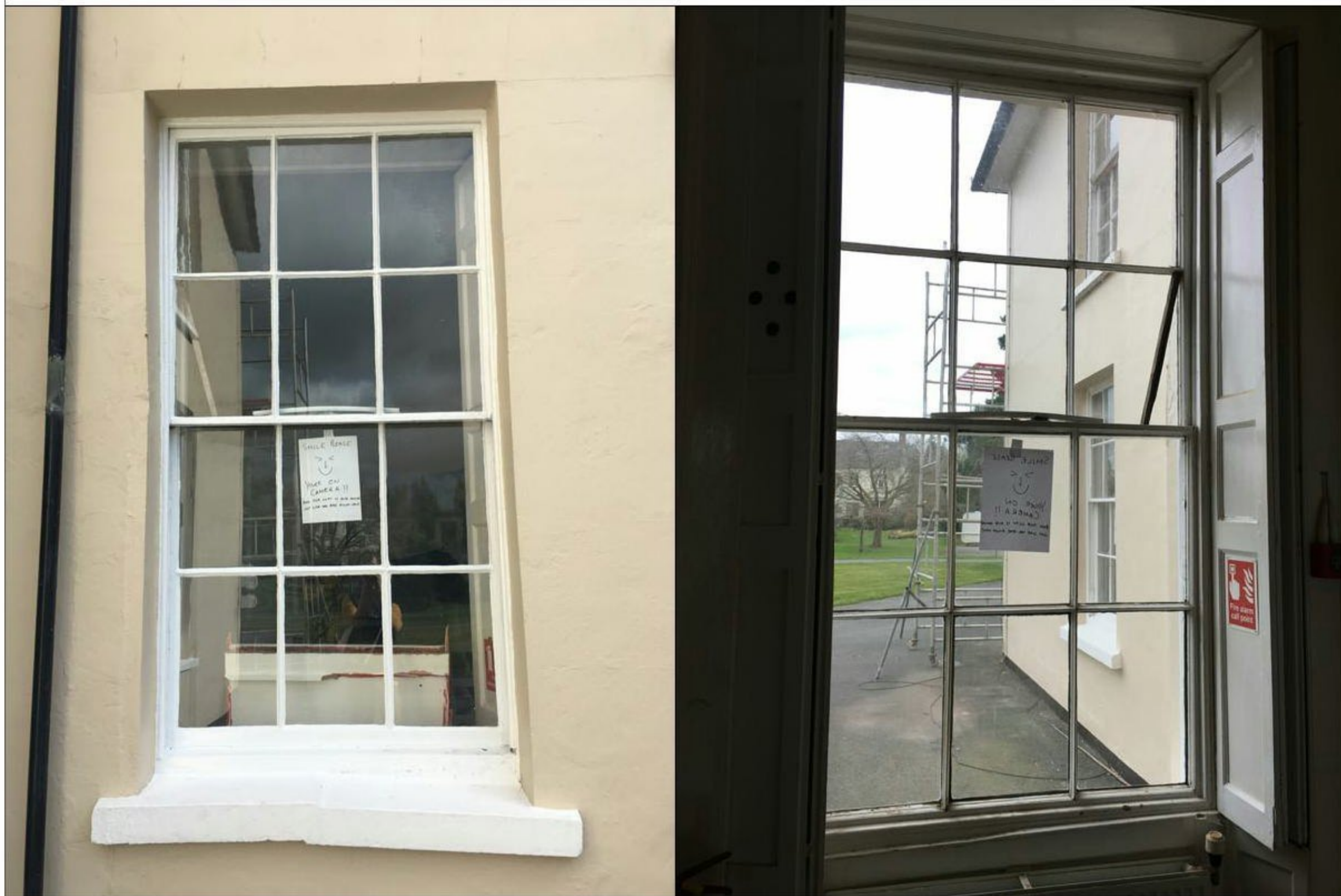
External Photo W002E