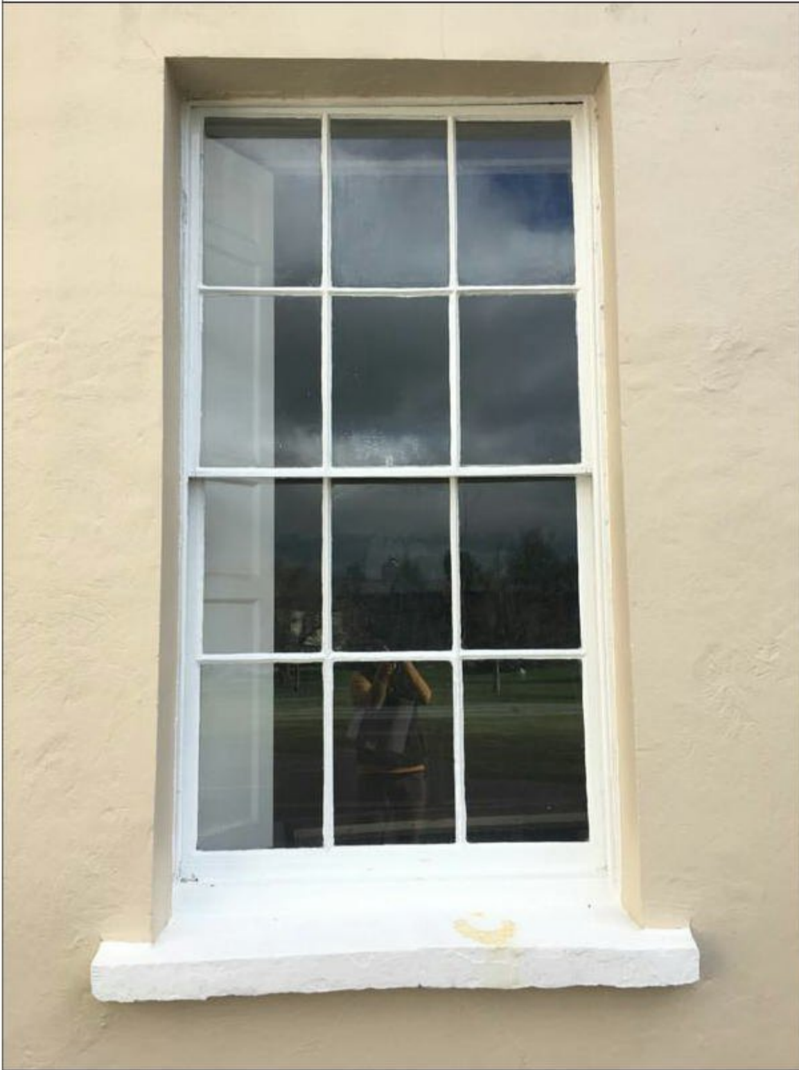
External Photo W003E