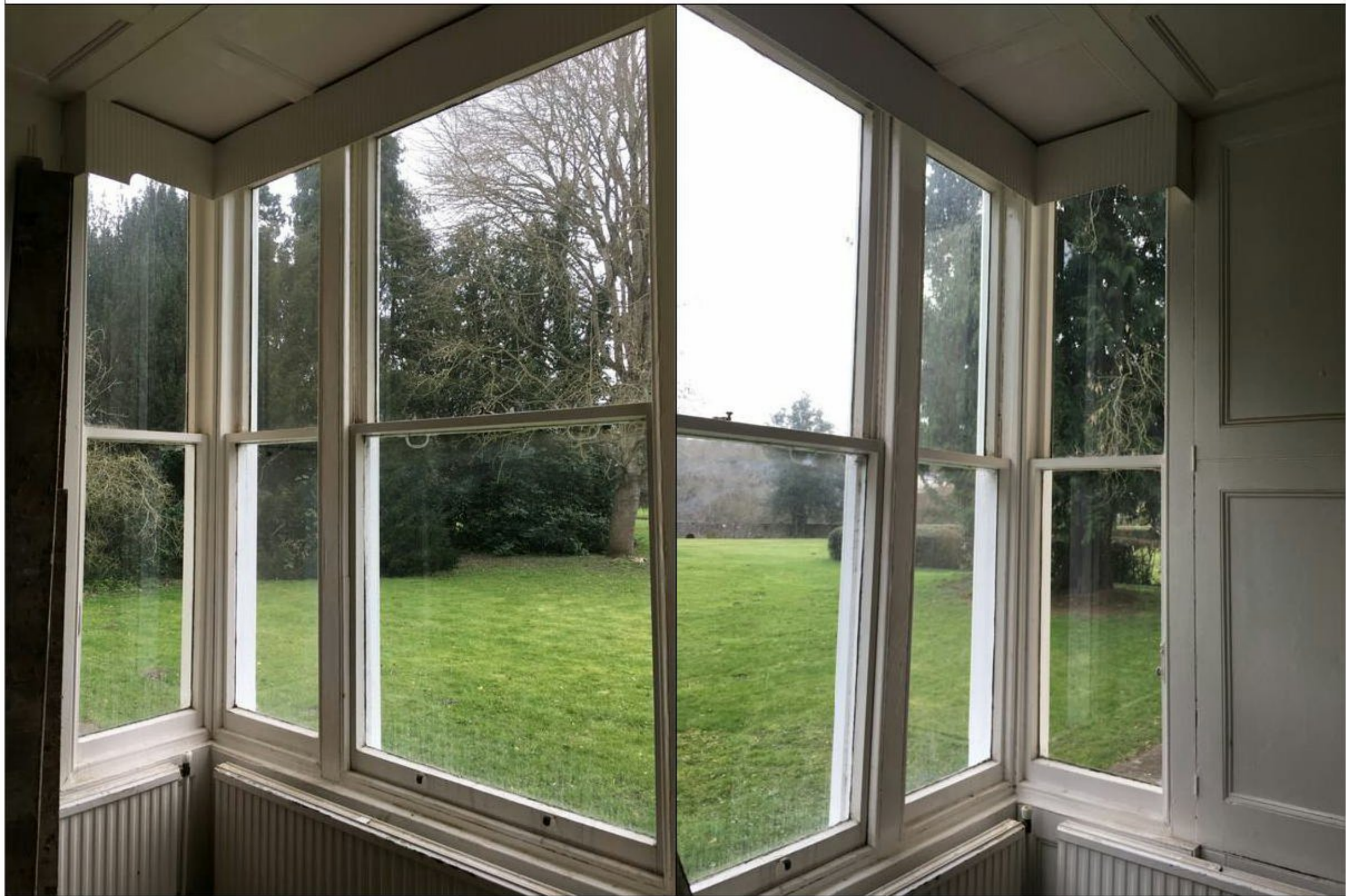
External Photo W006ia