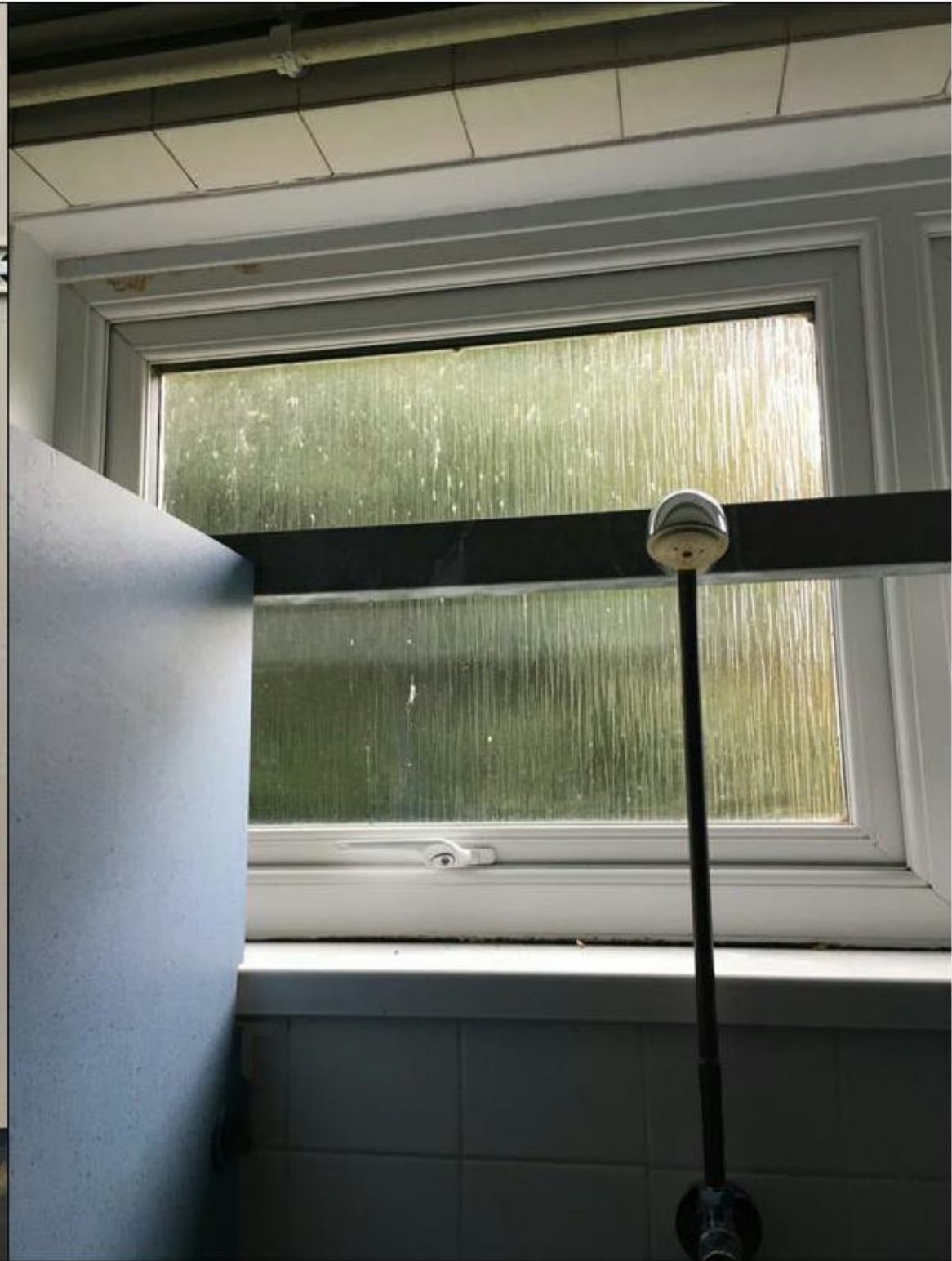
External Photo W009E