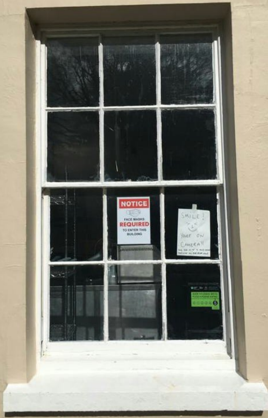
External Photo W001E