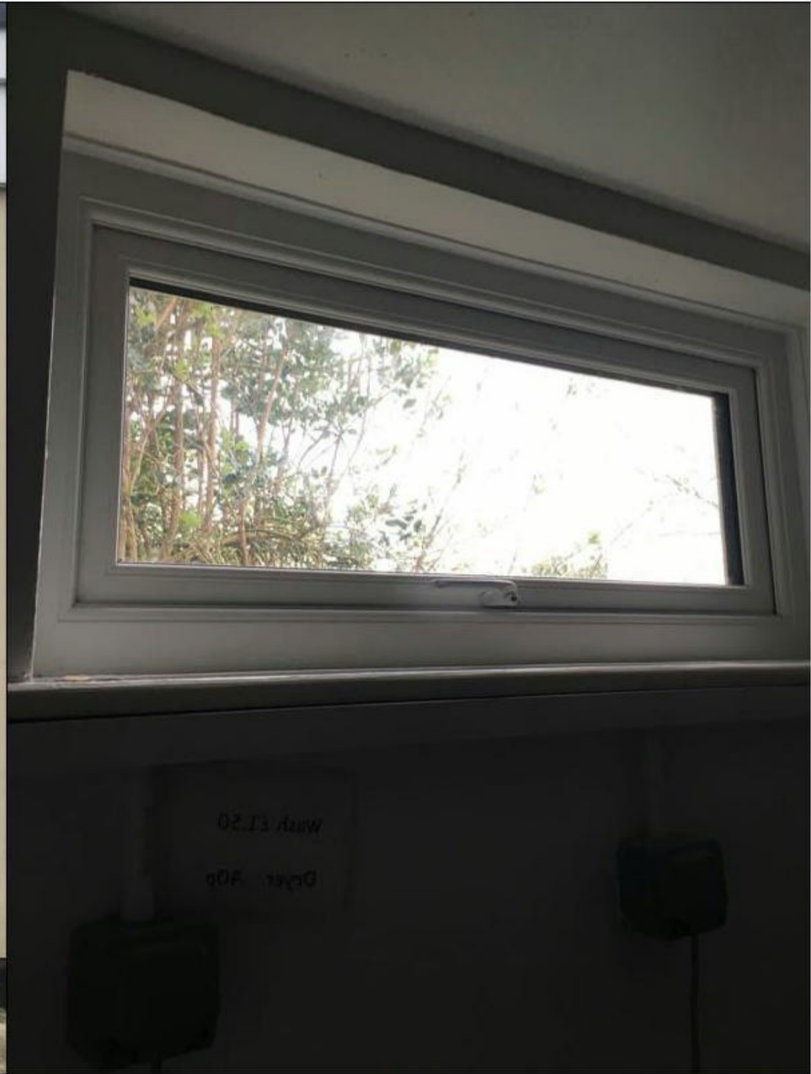
External Photo W013E