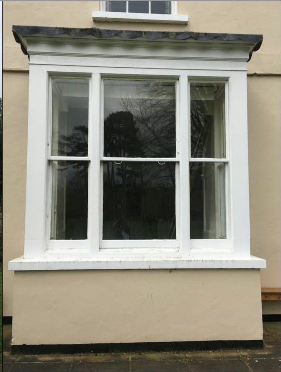
Internal Photo W006Eb

Photo Location - East_Window Number W006 - See floor plans for location