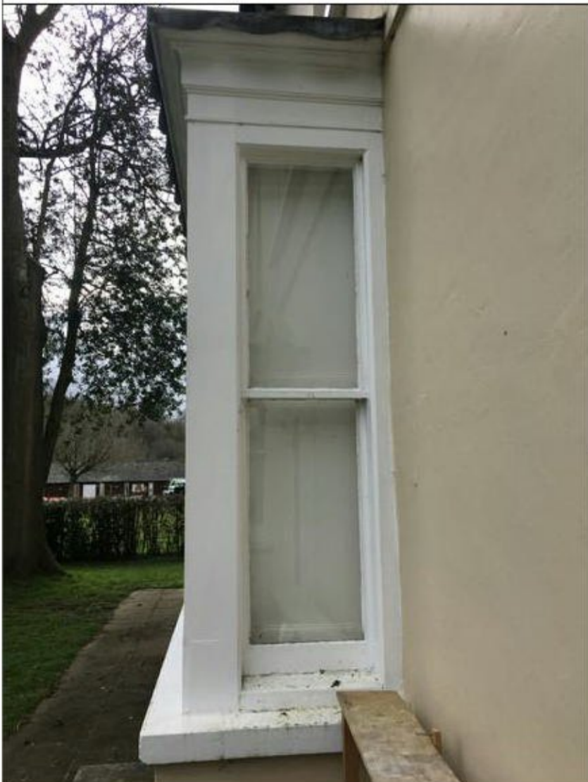
External Photo W005Ec

Photo Location - East_Window Number W005 - See floor plans for location