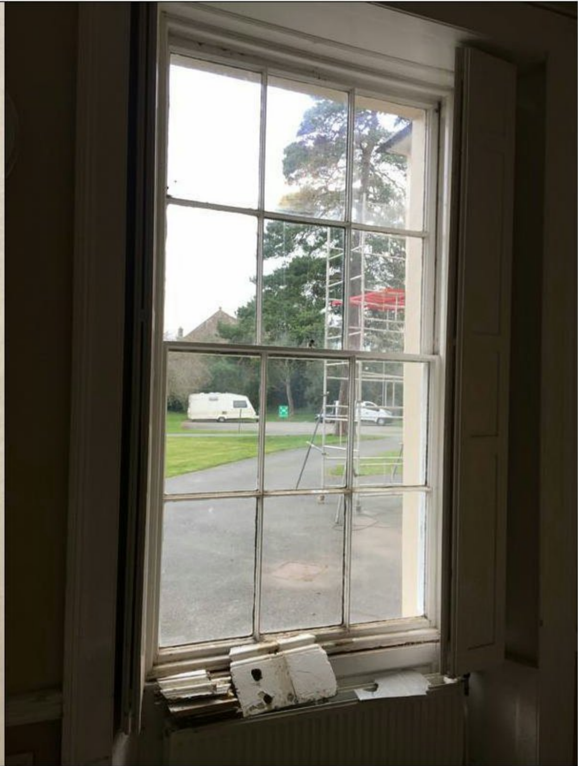
Internal Photo W003ia

Photo Location - West_Window Number W003 - See floor plans for location