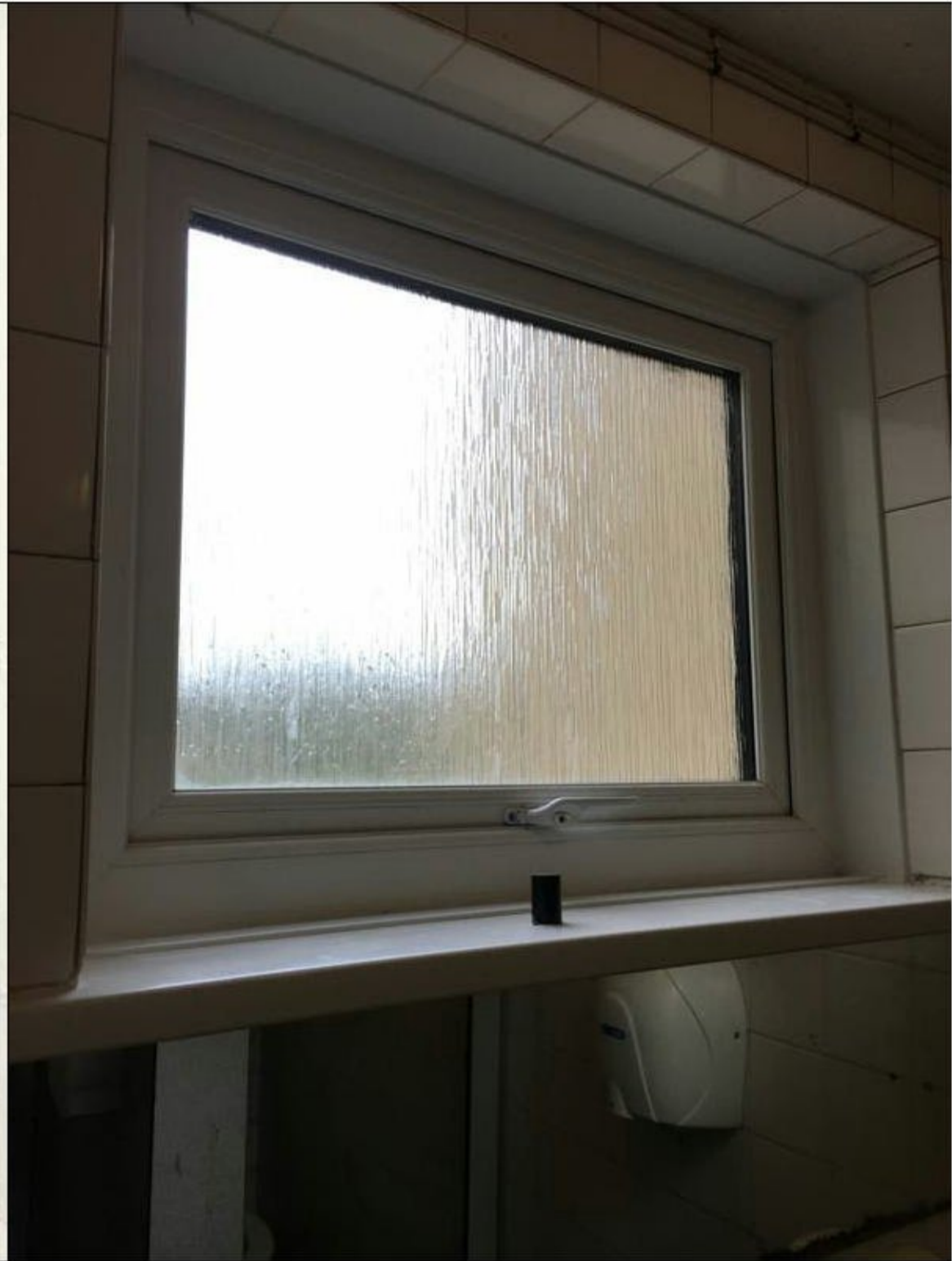
External Photo W008E