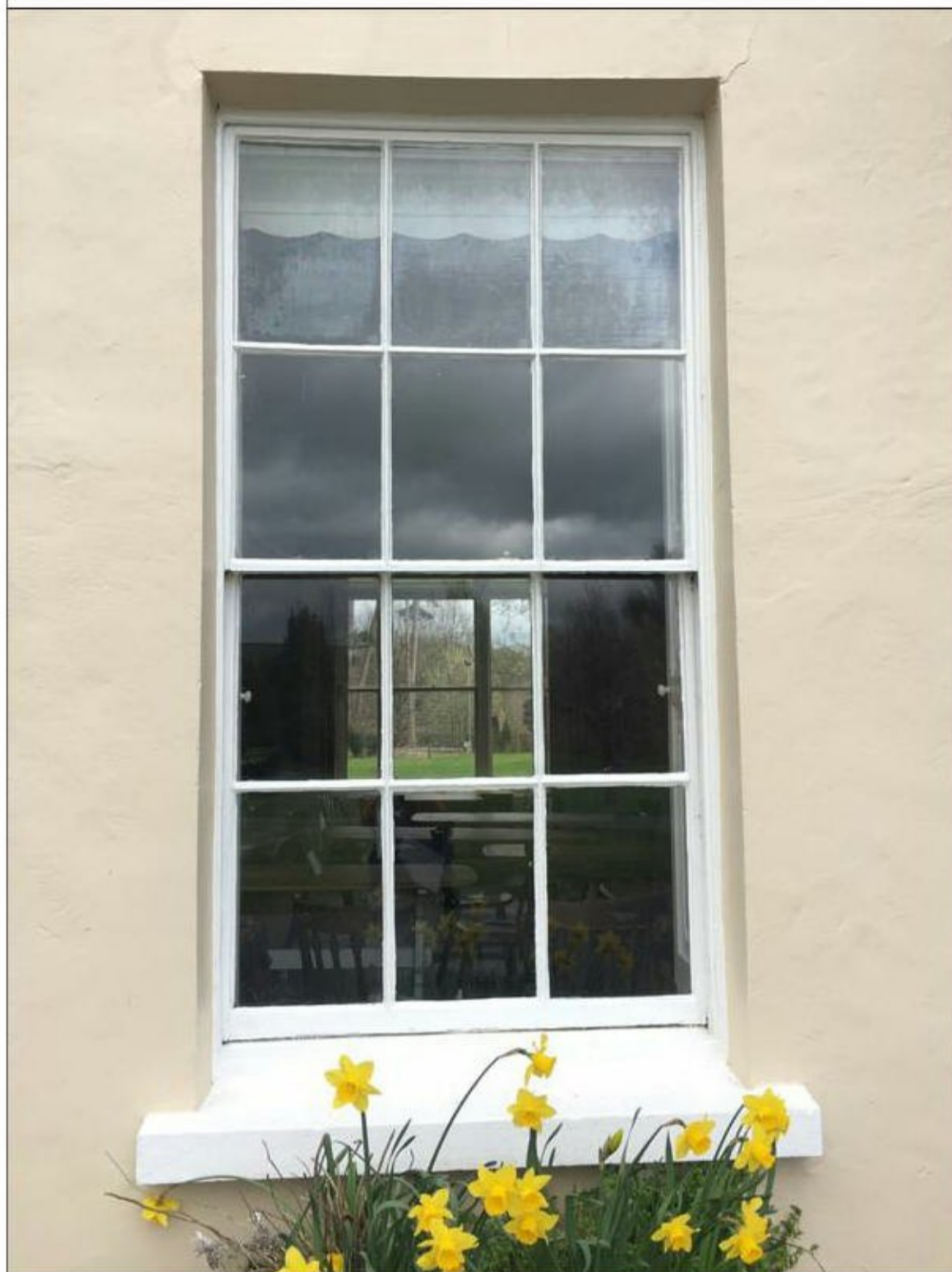
External Photo W004E