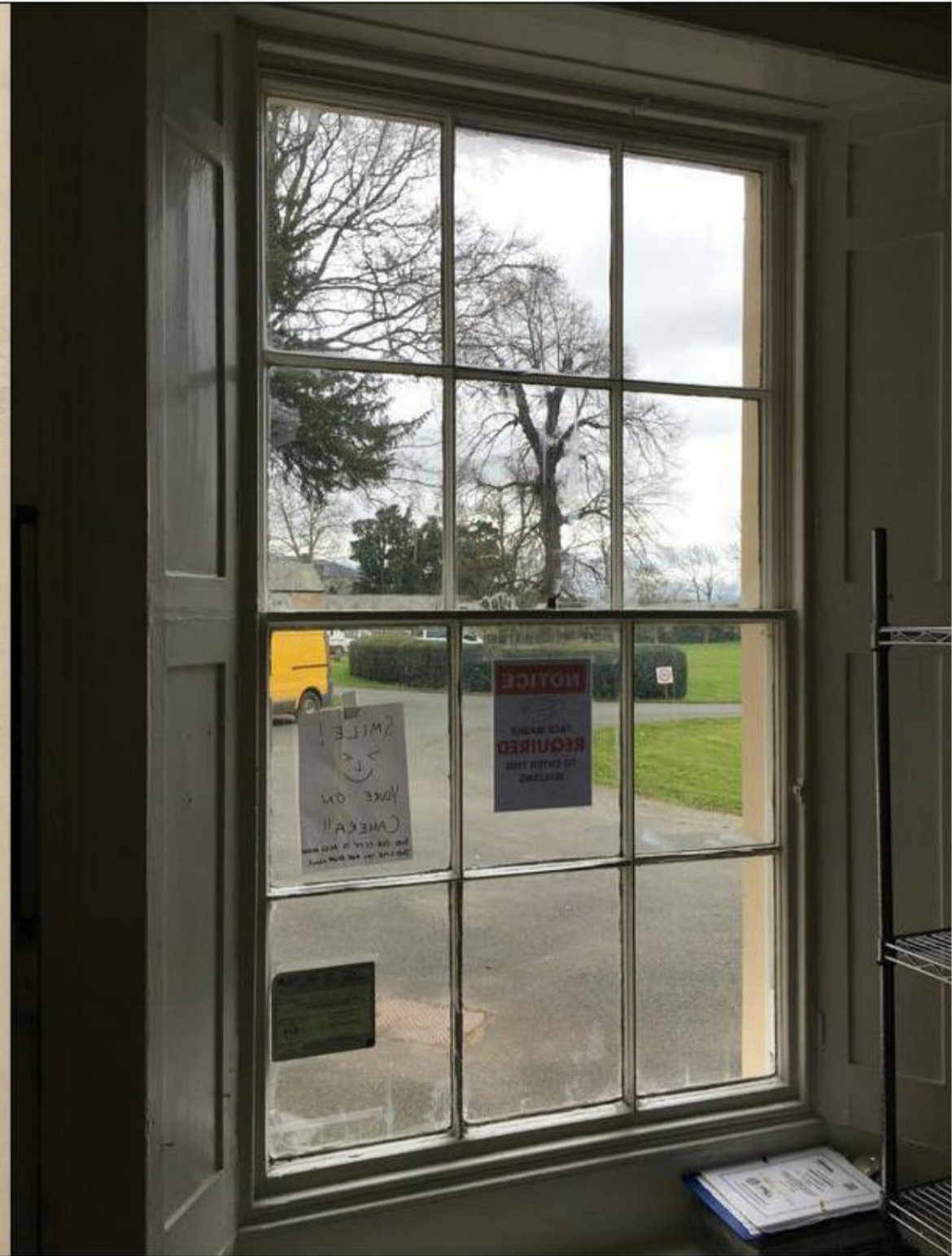
Internal Photo W001ia

Photo Location - South_Window Number W001 - See floor plans for location