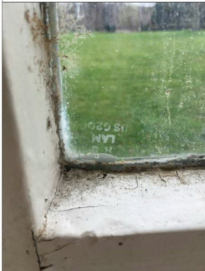
Photo Location - East_Window Number W006 - See floor plans for location

Located with 1750's section of the building