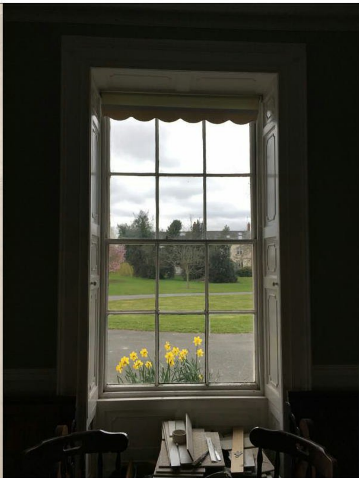
Internal Photo W004ia

Photo Location - West_Window Number W004 - See floor plans for location