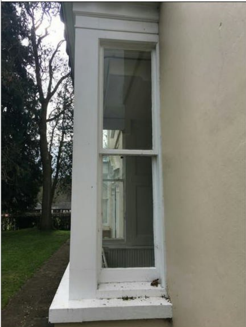
External Photo W006Ec

Photo Location - East_Window Number W006 - See floor plans for location