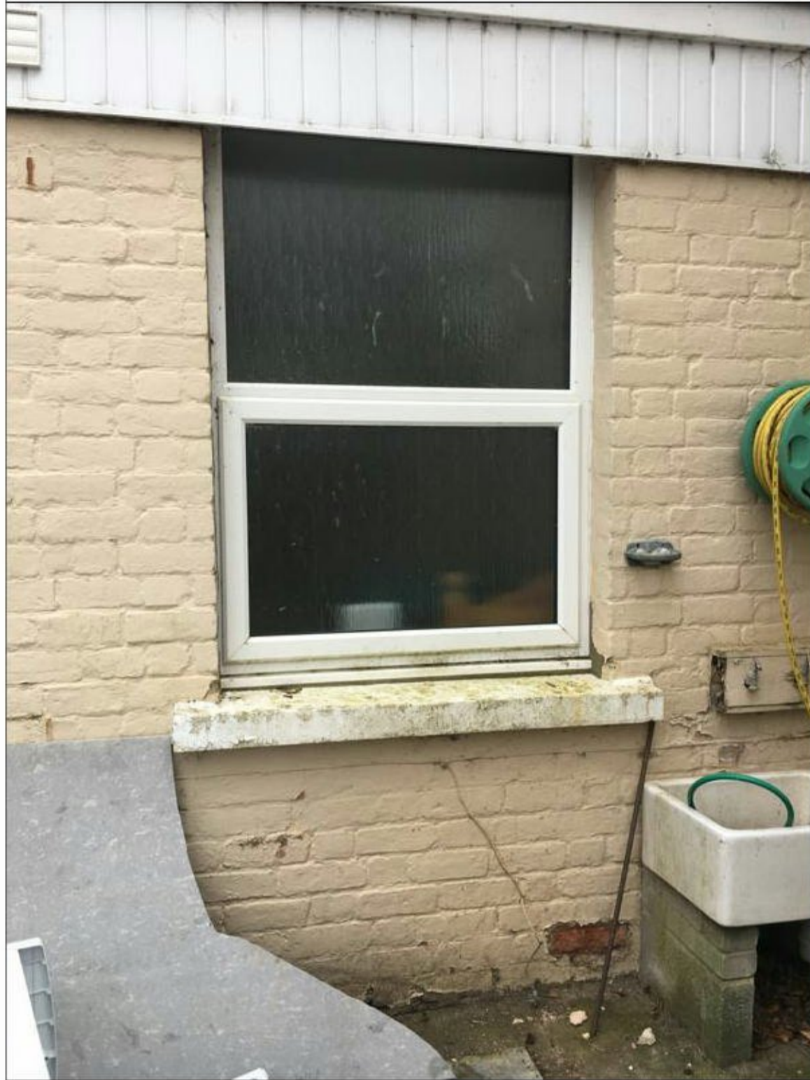
External Photo W014E