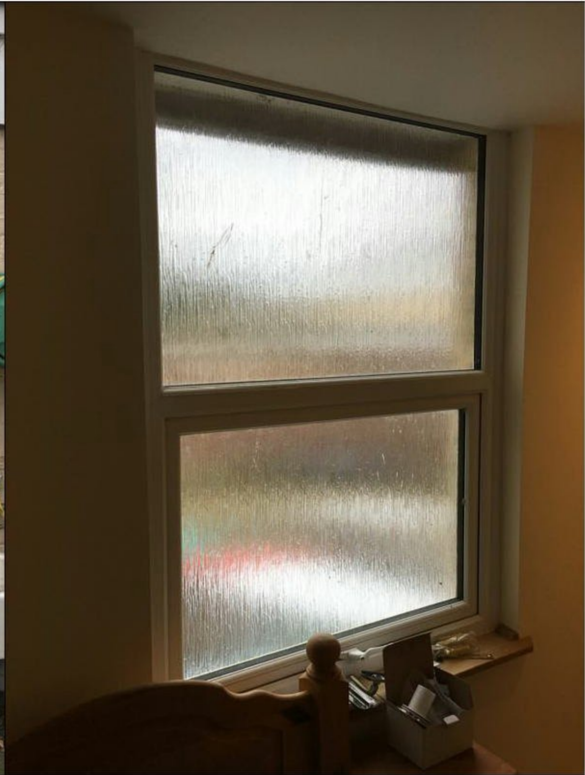
Internal Photo W014i

Photo Location - West_Window Number W014 - See floor plans for location