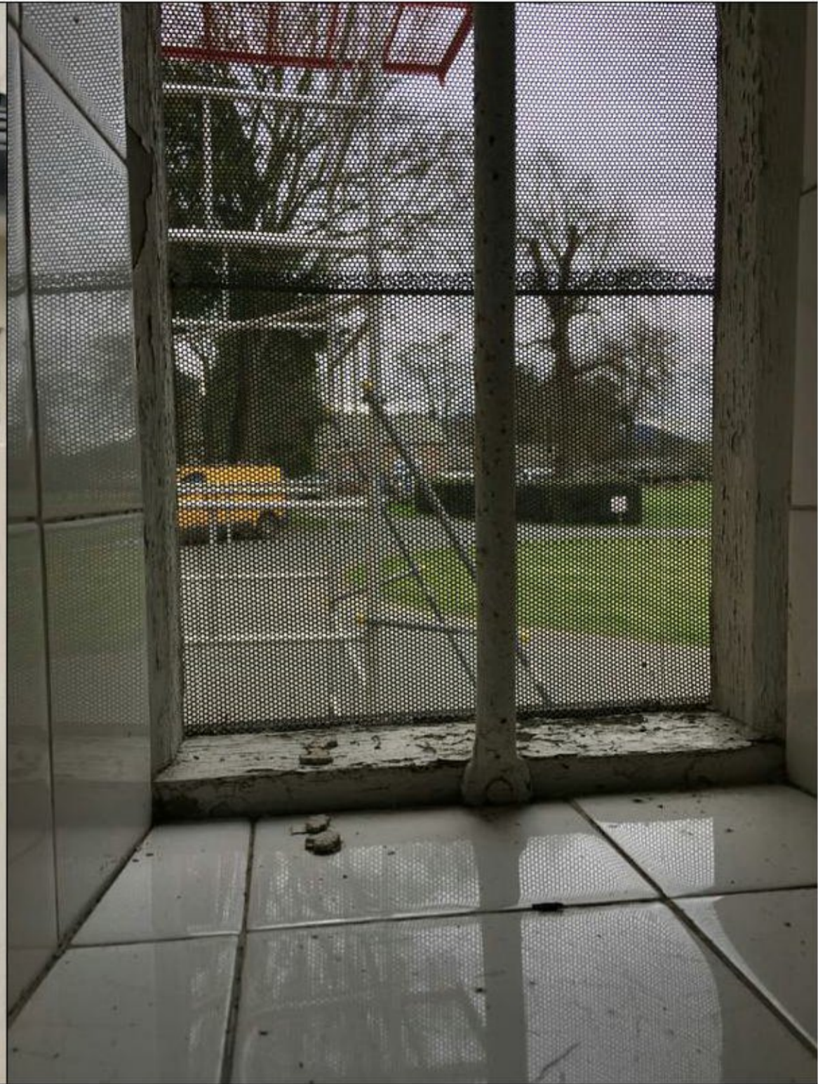
External Photo W015E