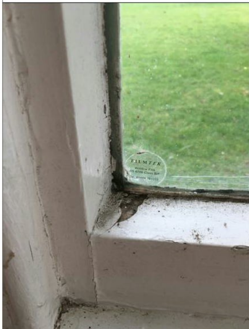
Photo Location - East_Window Number W005 - See floor plans for location

Located with 1750's section of the building