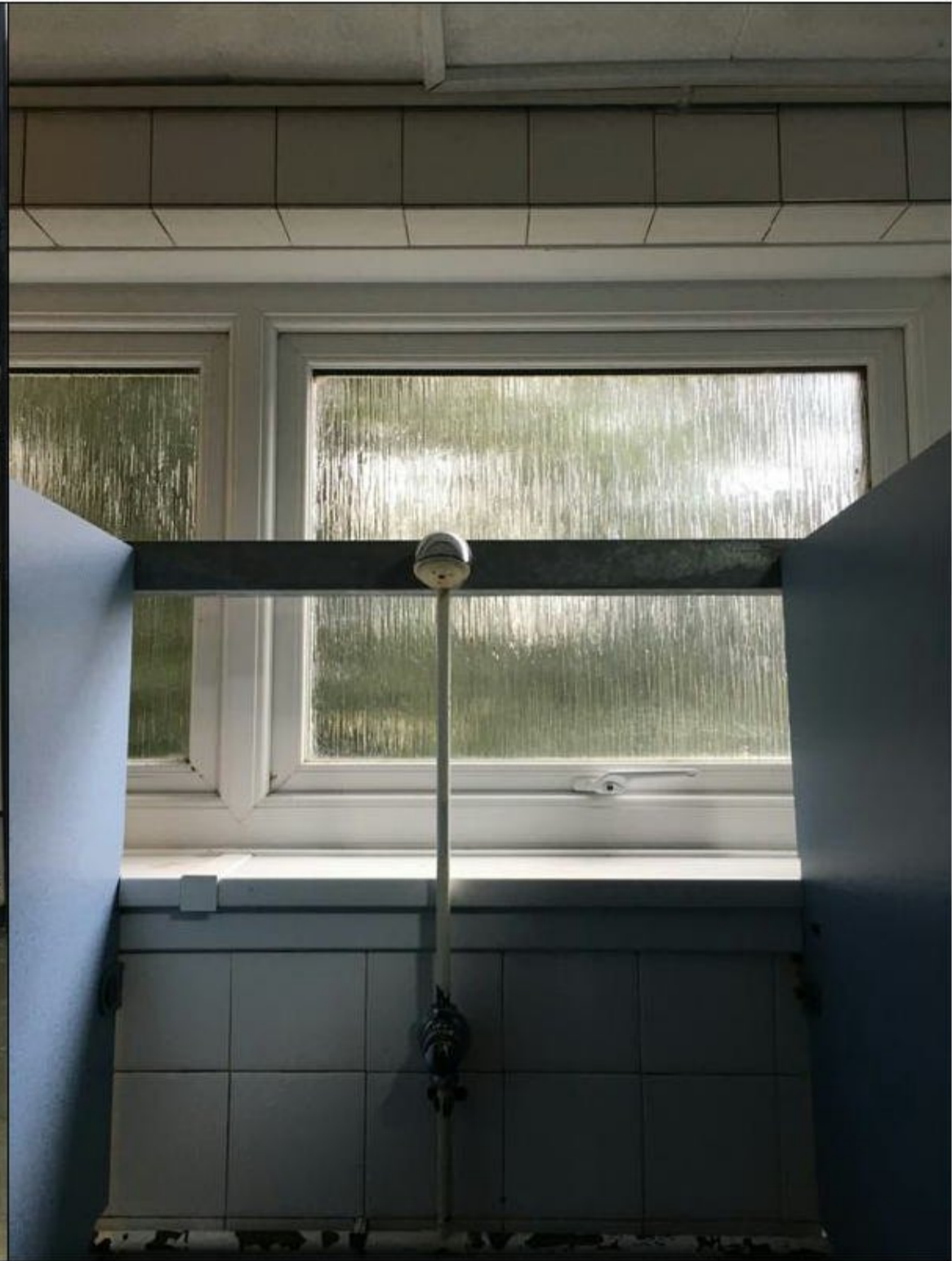
External Photo W011E