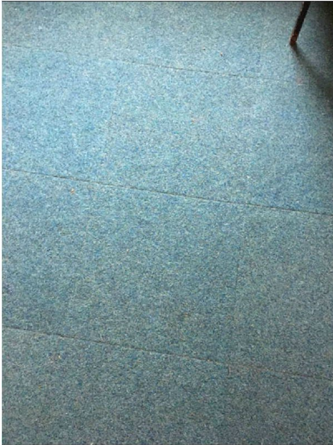
Internal Photo F026

Photo Location - Bedroom - Floor Number F026 - See floor plans for location