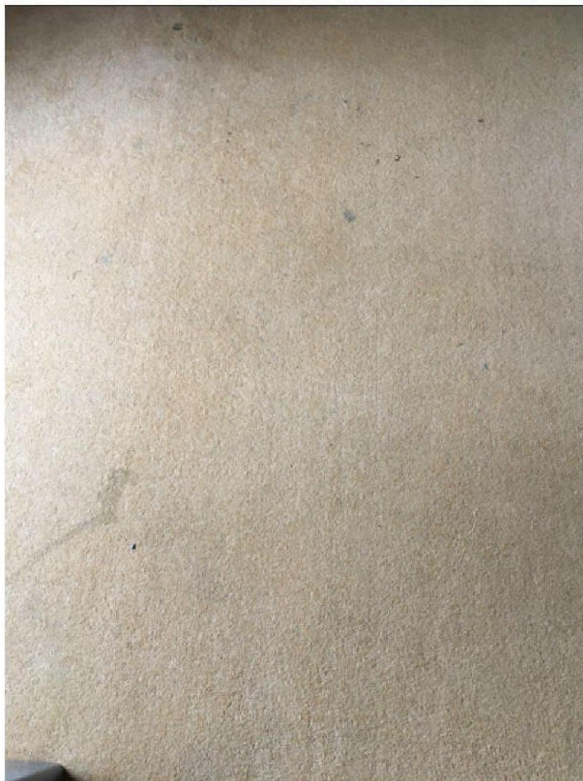
Internal Photo F021

Photo Location - Brecon Dorm - Floor Number F021 - See floor plans for location