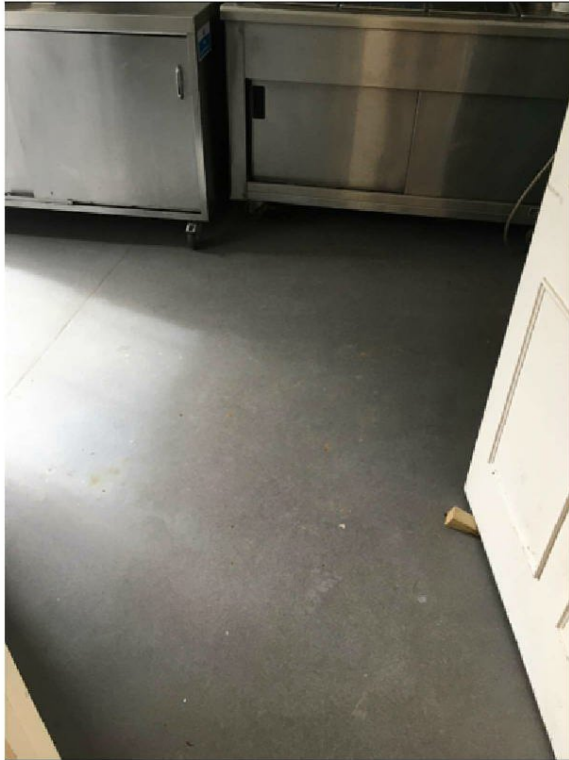
Internal Photo F002

Photo Location - Kitchen - Floor Number F002 - See floor plans for location