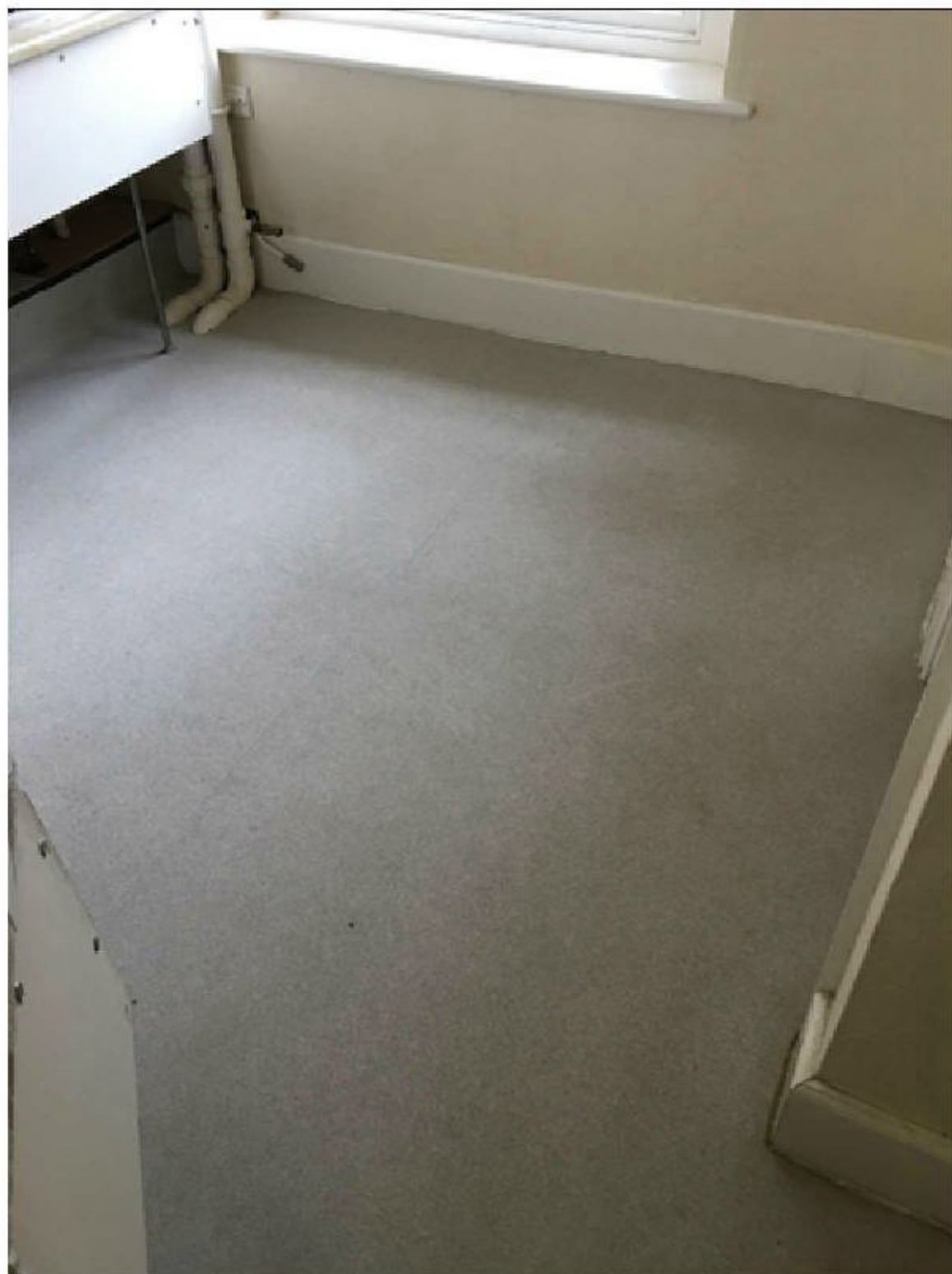
Internal Photo F015

Photo Location - Wc - Floor Number F015 - See floor plans for location