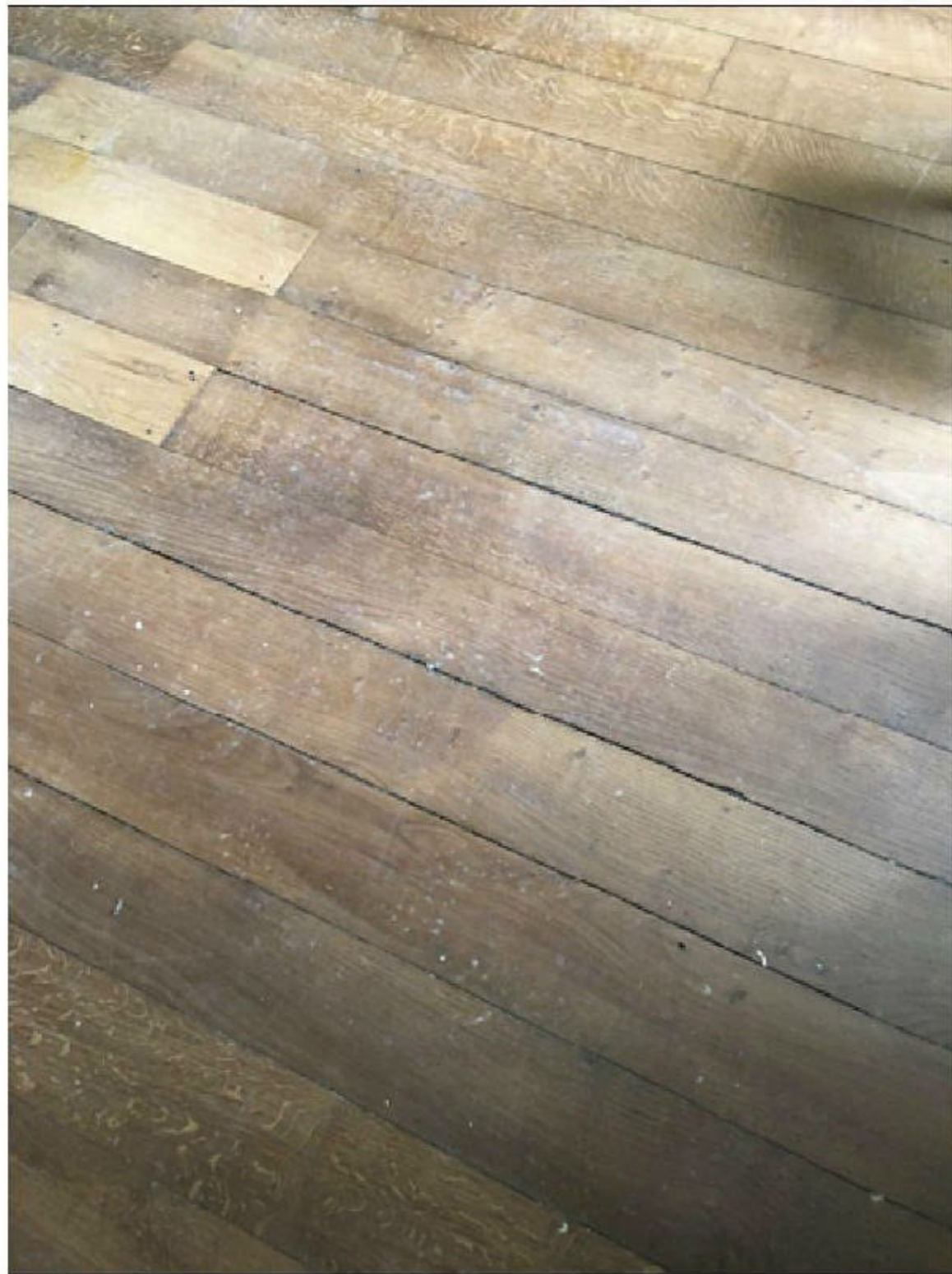
Internal Photo F012

Photo Location - Dining Room - Floor Number F012 - See floor plans for location