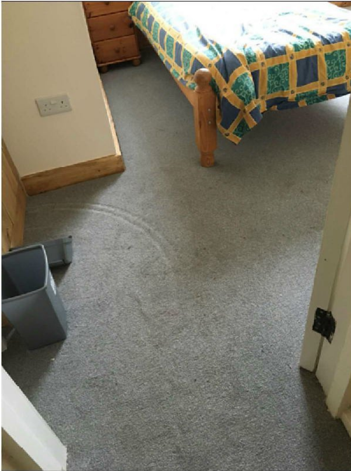
Internal Photo F005

Photo Location - Staff bedroom - Floor Number F005 - See floor plans for location