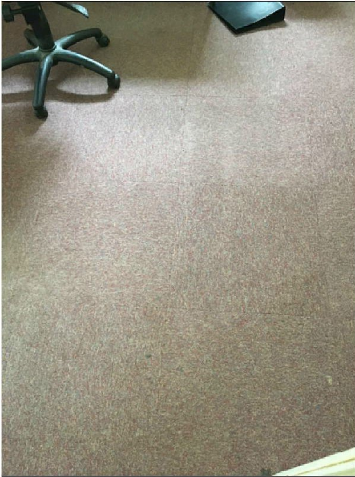
Internal Photo F007

Photo Location - Staff Room - Floor Number F007 - See floor plans for location