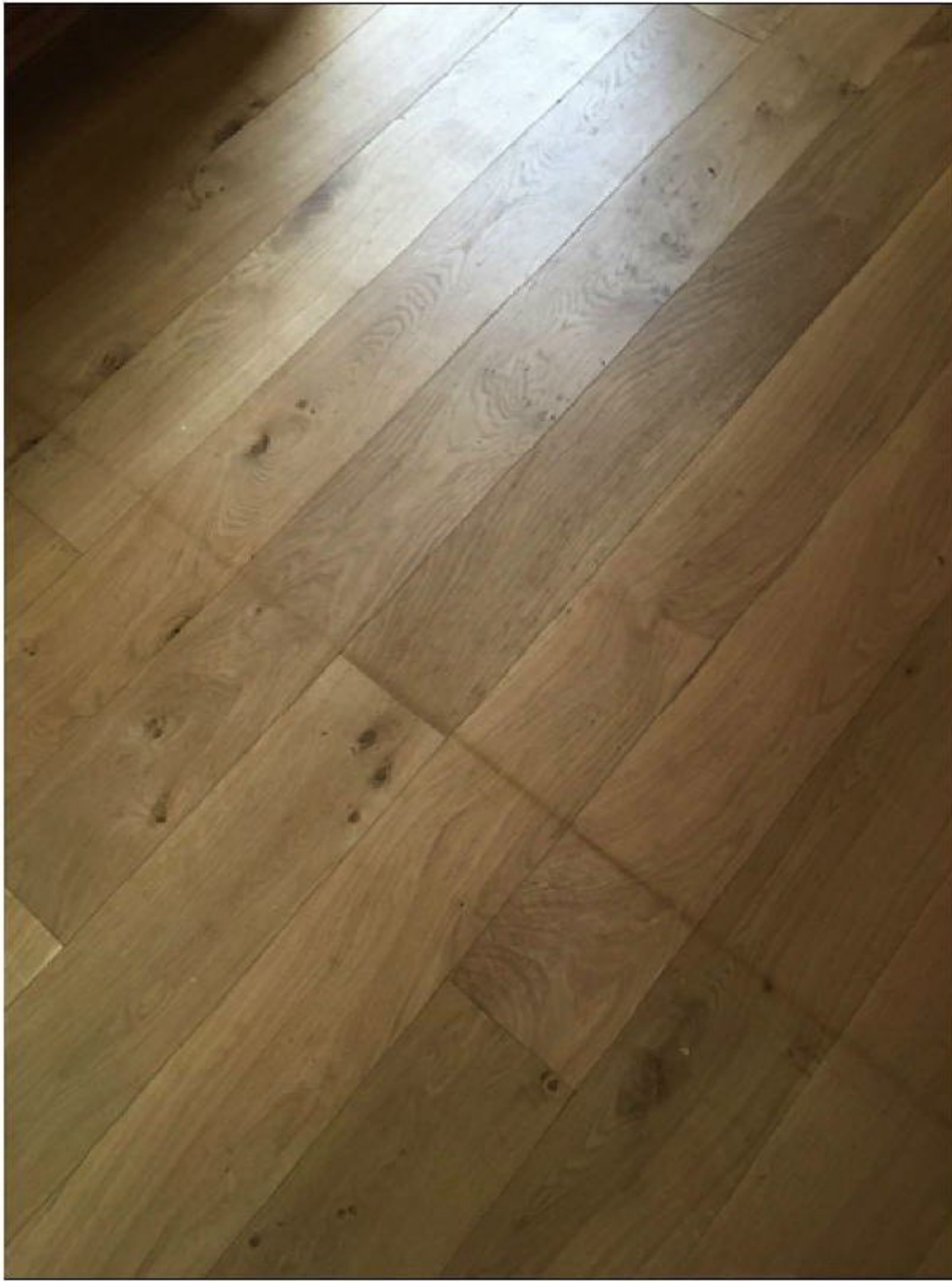
Internal Photo F016

Photo Location - Bedroom - Floor Number F016 - See floor plans for location