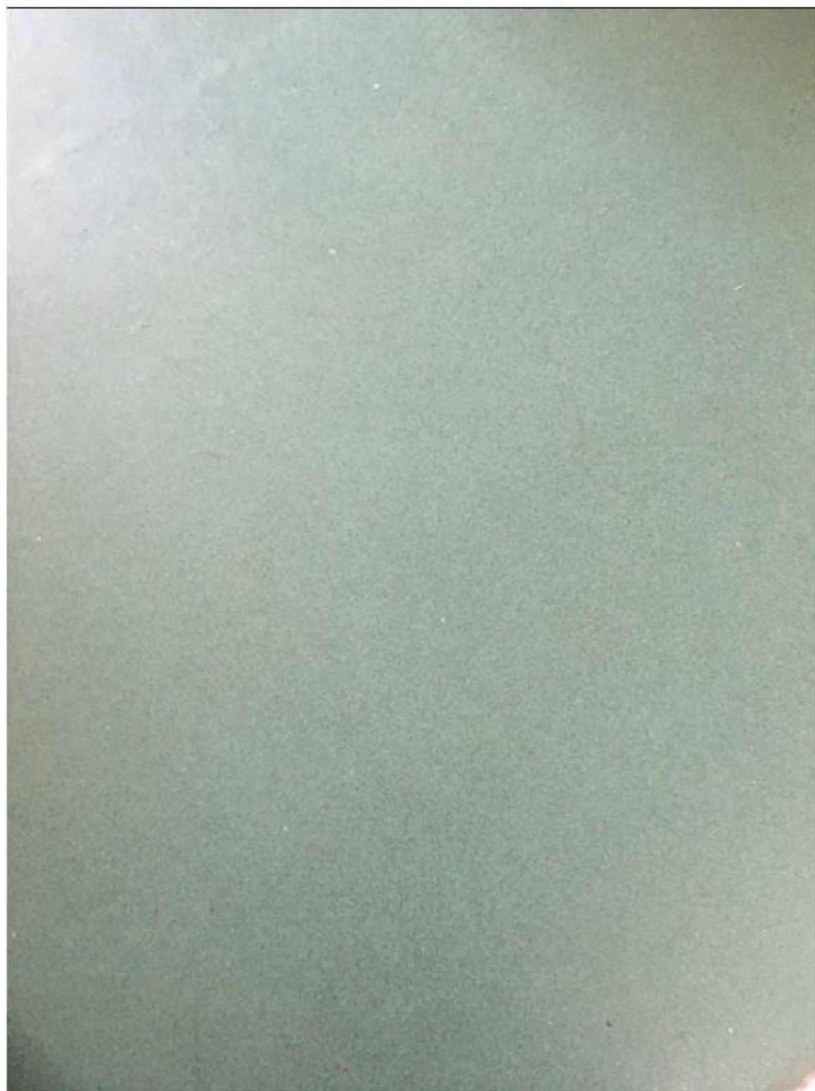
Internal Photo F022

Photo Location - Wc - Floor Number F022 - See floor plans for location