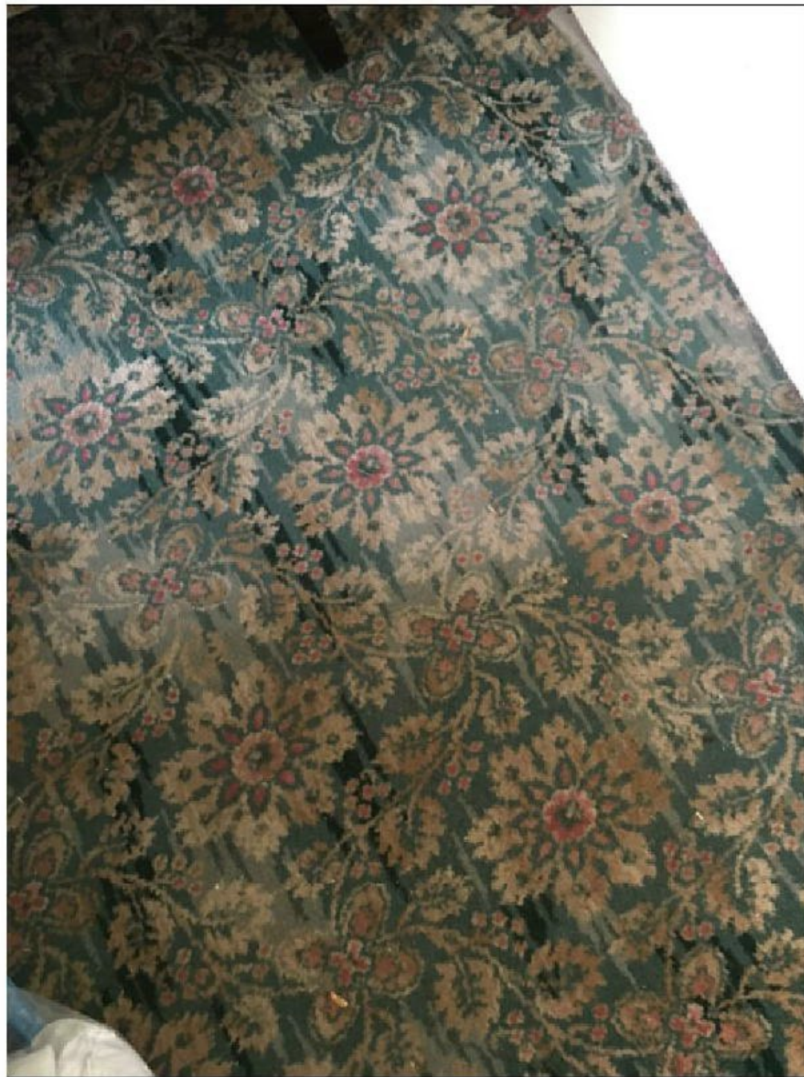
Internal Photo F008

Photo Location - Staff Room - Floor Number F008 - See floor plans for location