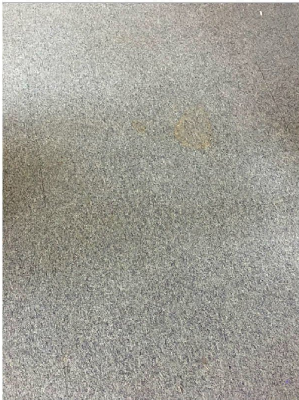
Internal Photo F025

Photo Location - Lecture Room - Floor Number F025 - See floor plans for location