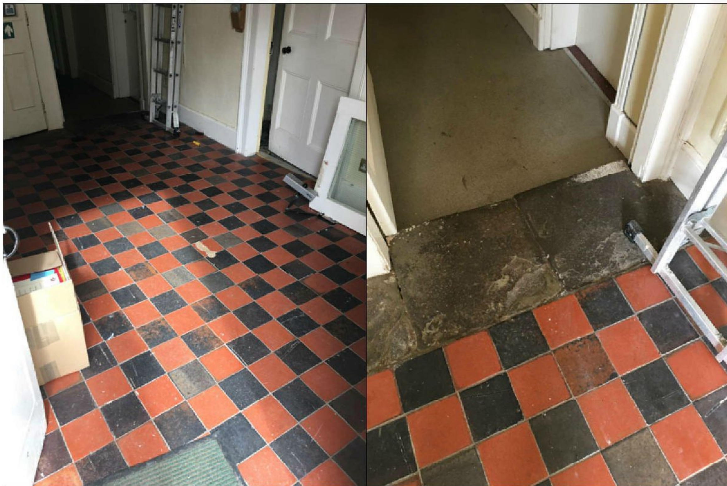
Internal Photo F001a

Photo Location - Entrance Hall - Floor Number F001 - See floor plans for location