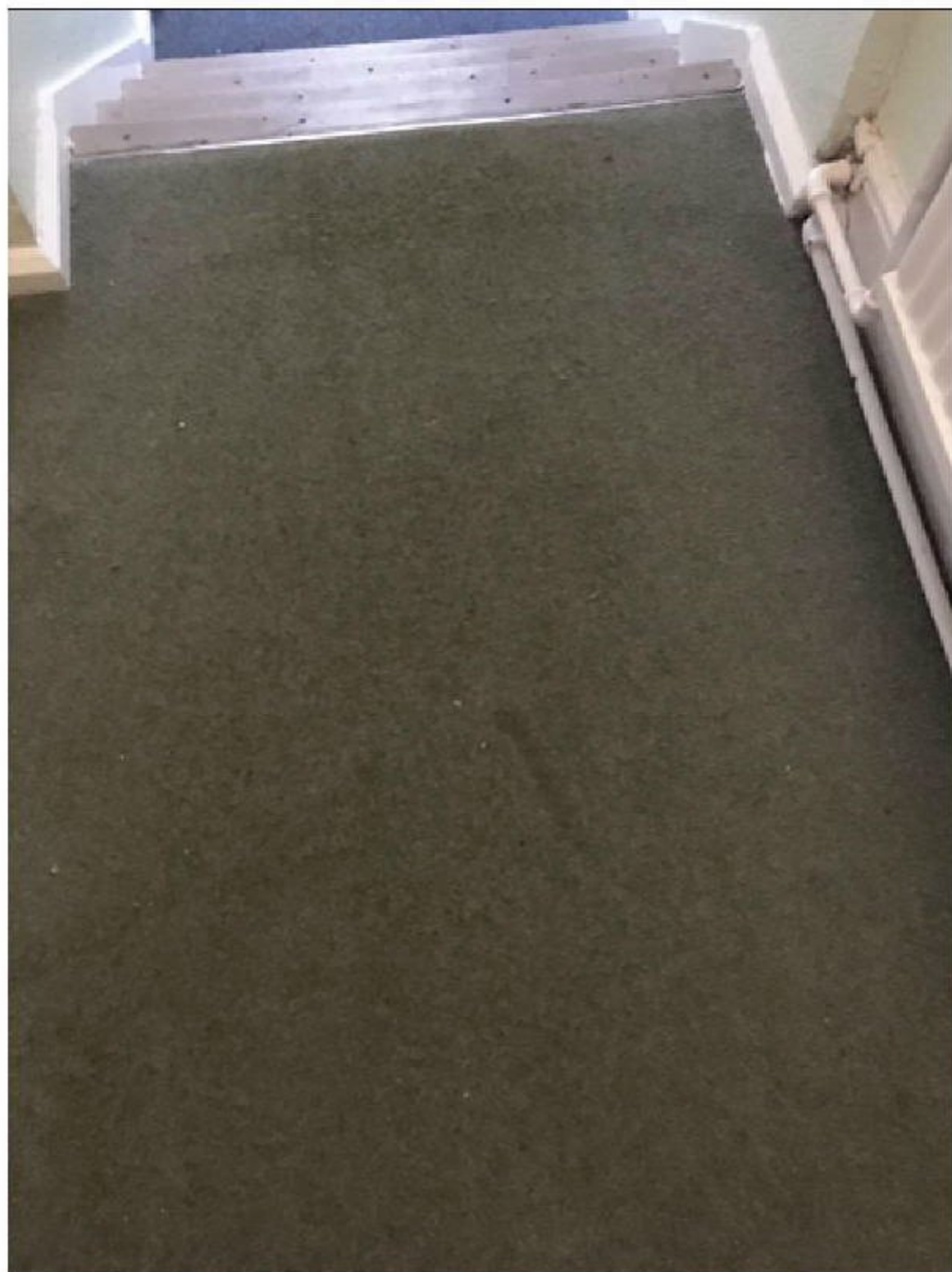
Internal Photo F024

Photo Location - Landing - Floor Number F024 - See floor plans for location