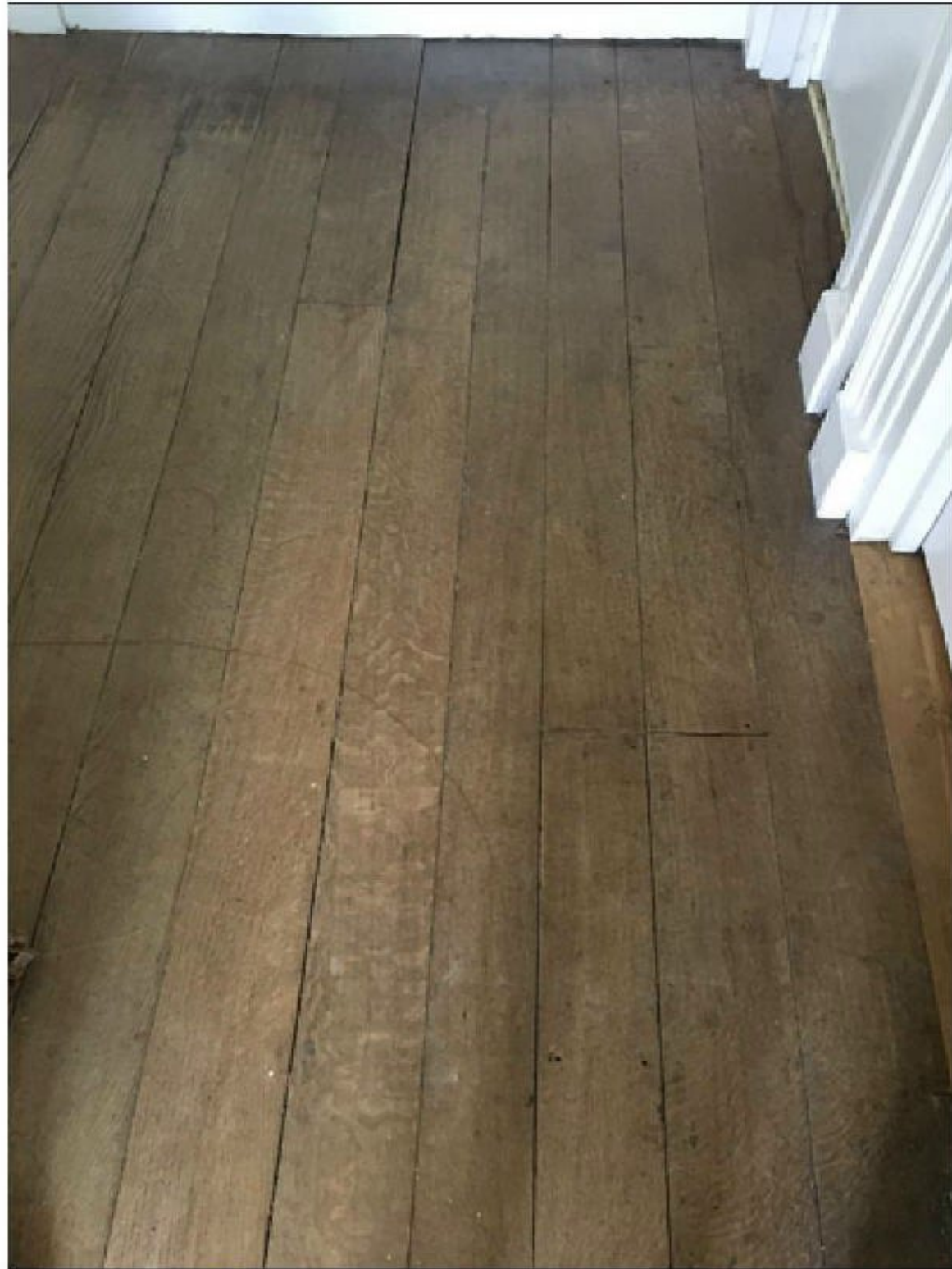
Internal Photo F013

Photo Location - Landing - Floor Number F013 - See floor plans for location