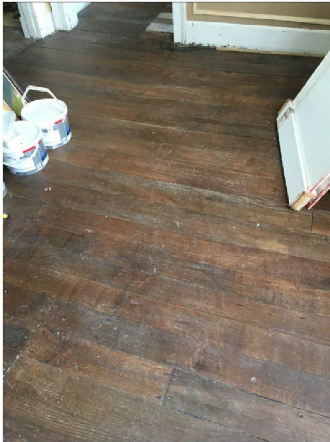
Internal Photo F009

Photo Location - Hall - Floor Number F009 - See floor plans for location