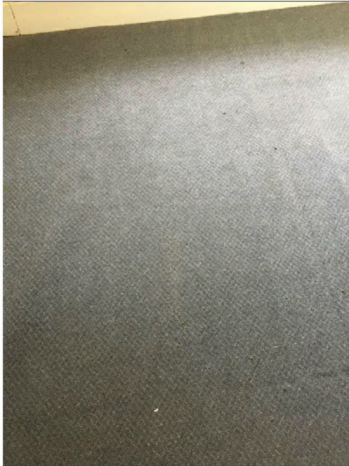
Internal Photo F018

Photo Location - Staircase - Floor Number F018 - See floor plans for location