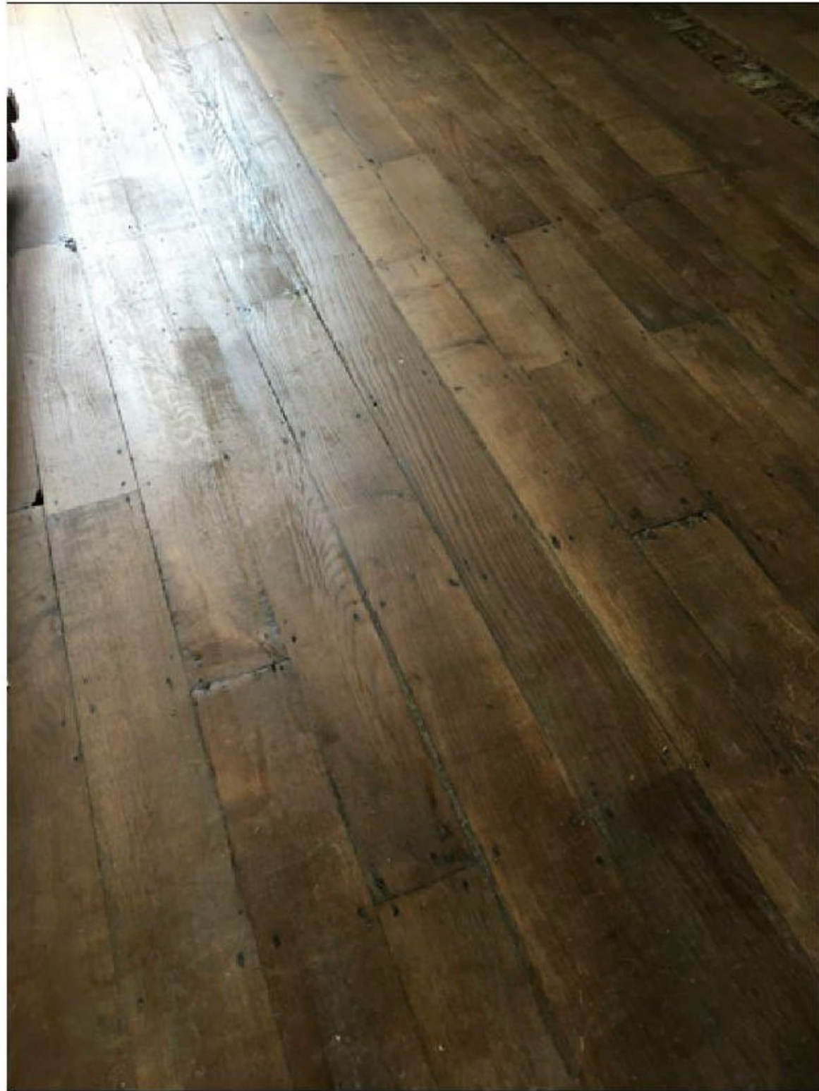
Internal Photo F010

Photo Location - Lounge - Floor Number F010 - See floor plans for location