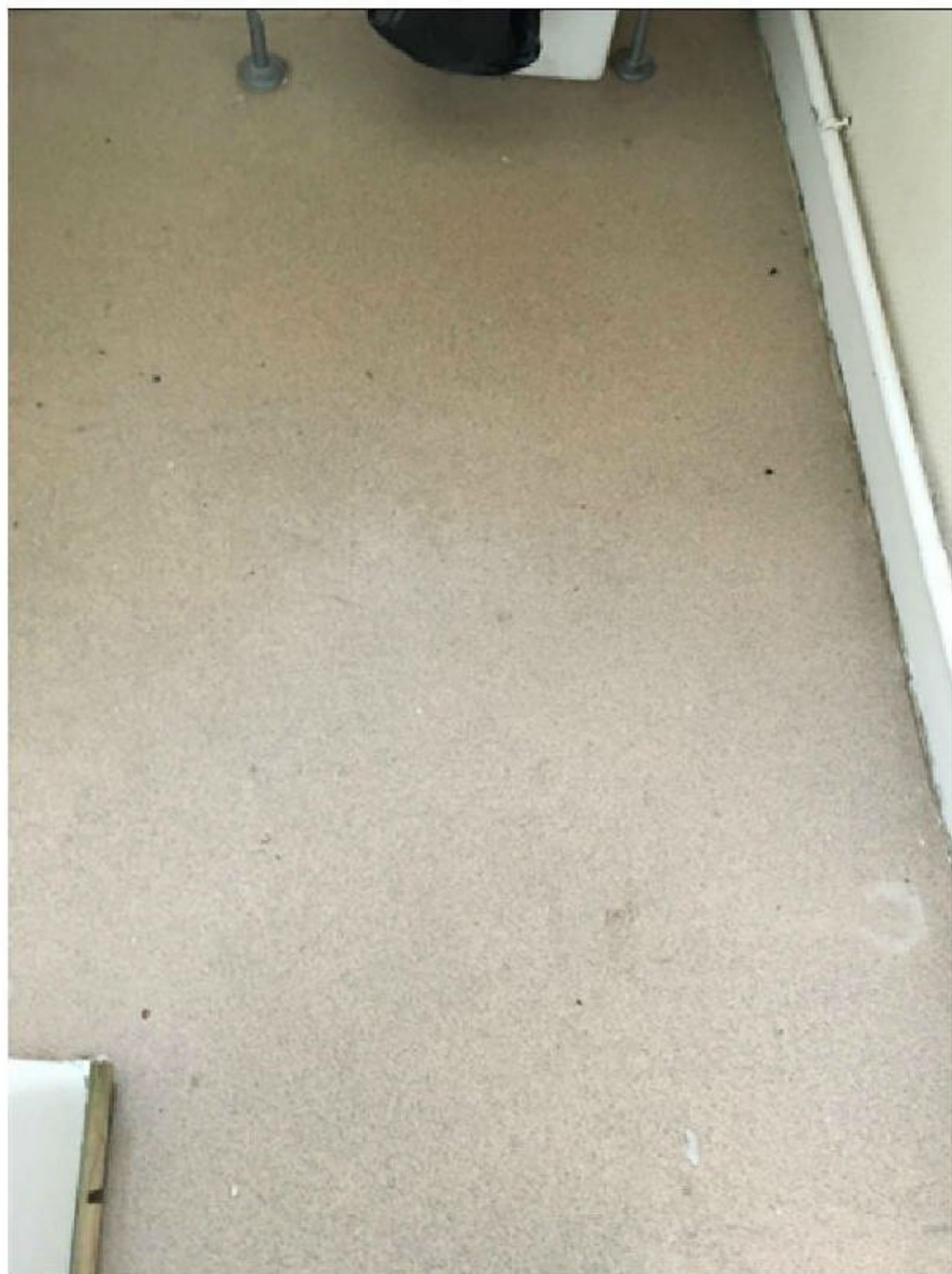
Internal Photo F023

Photo Location - Wc - Floor Number F023 - See floor plans for location