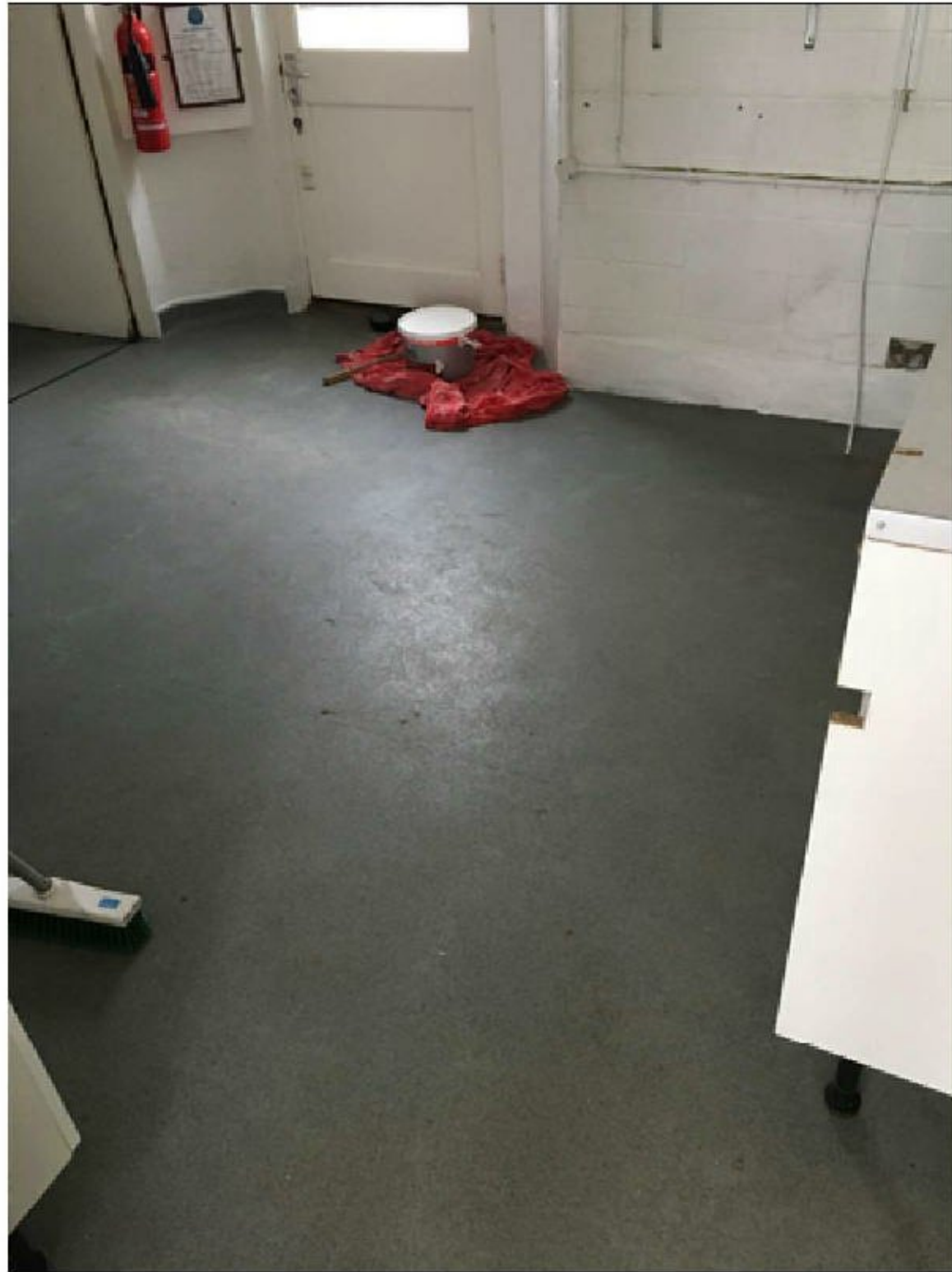
Internal Photo F003

Photo Location - Scullery - Floor Number F003 - See floor plans for location