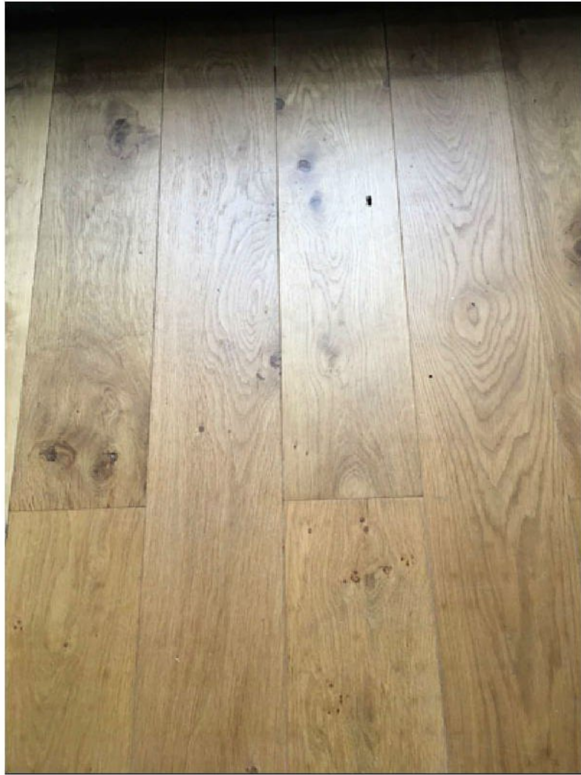
Internal Photo F020

Photo Location - Montgomery - Floor Number F020 - See floor plans for location