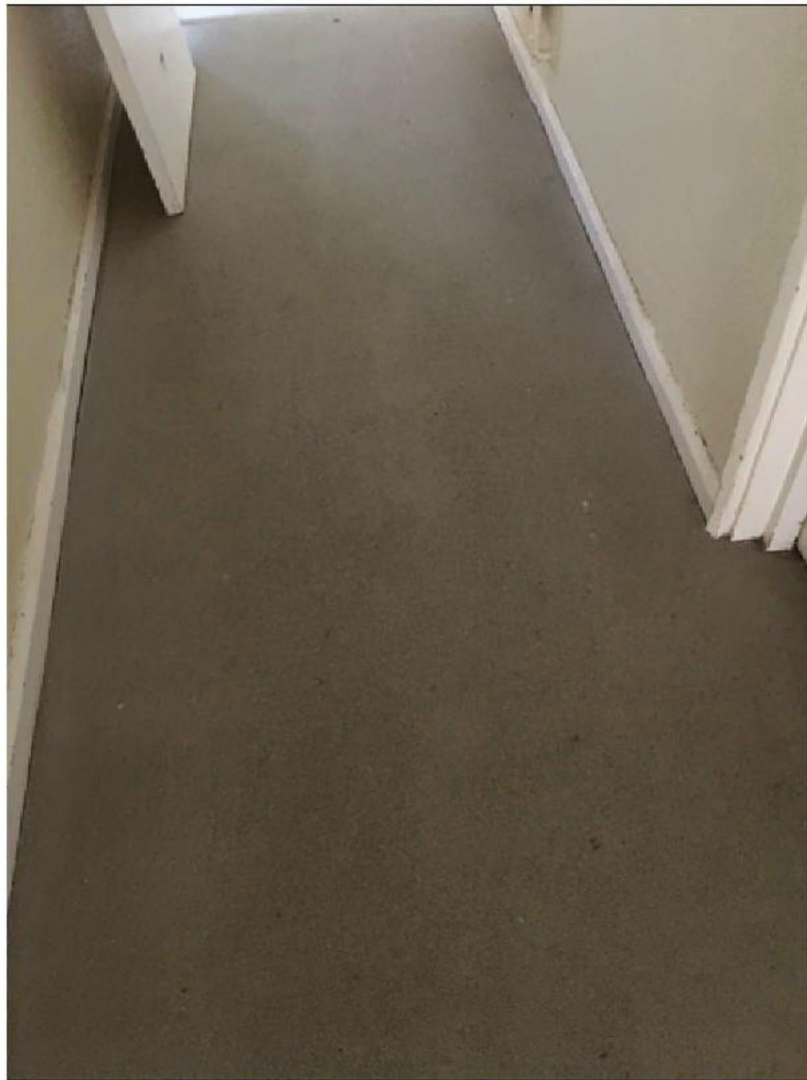
Internal Photo F006

Photo Location - Staff bedroom - Floor Number F006 - See floor plans for location