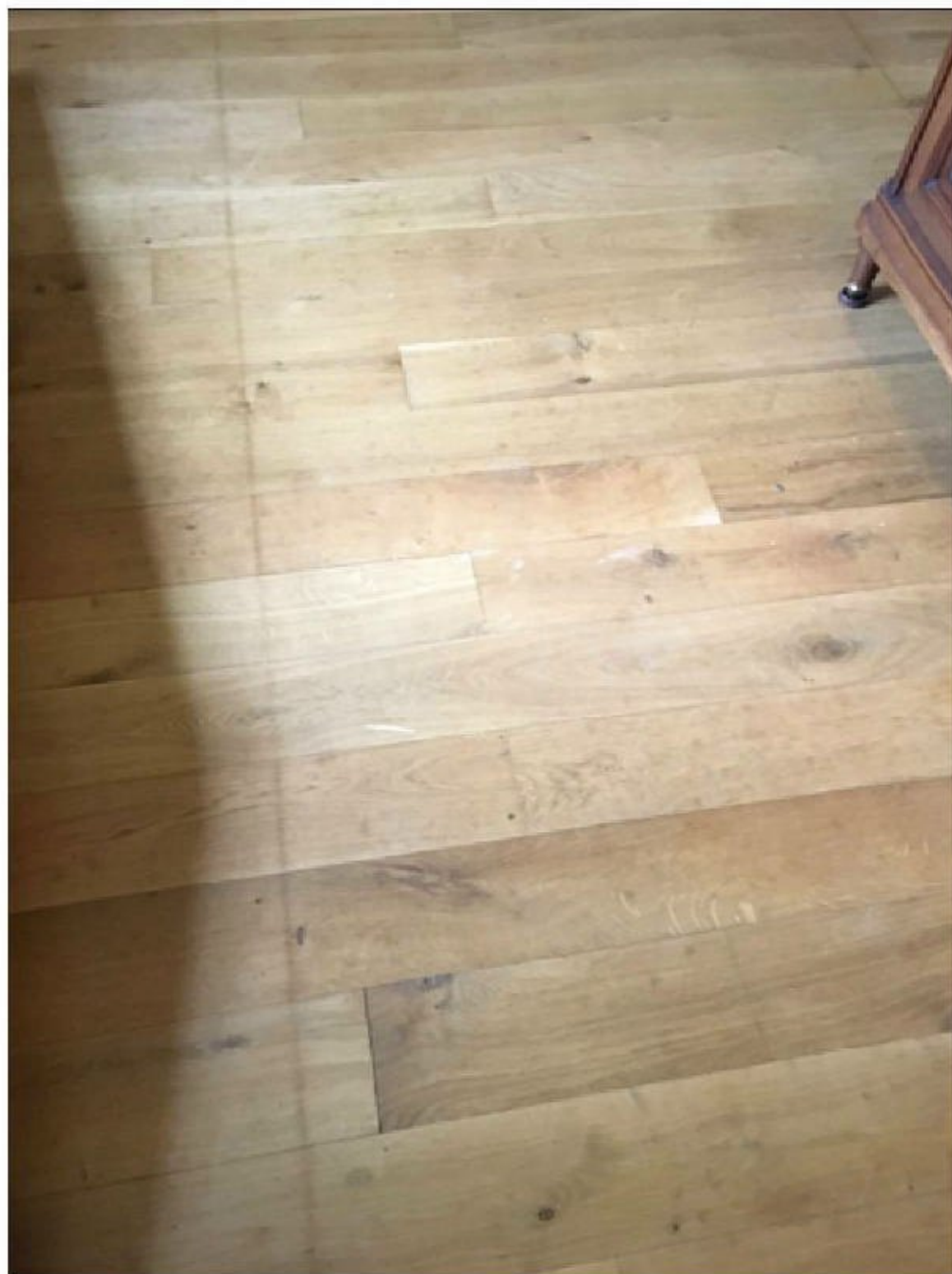
Internal Photo F014

Photo Location - Pembroke Dorm - Floor Number F014 - See floor plans for location