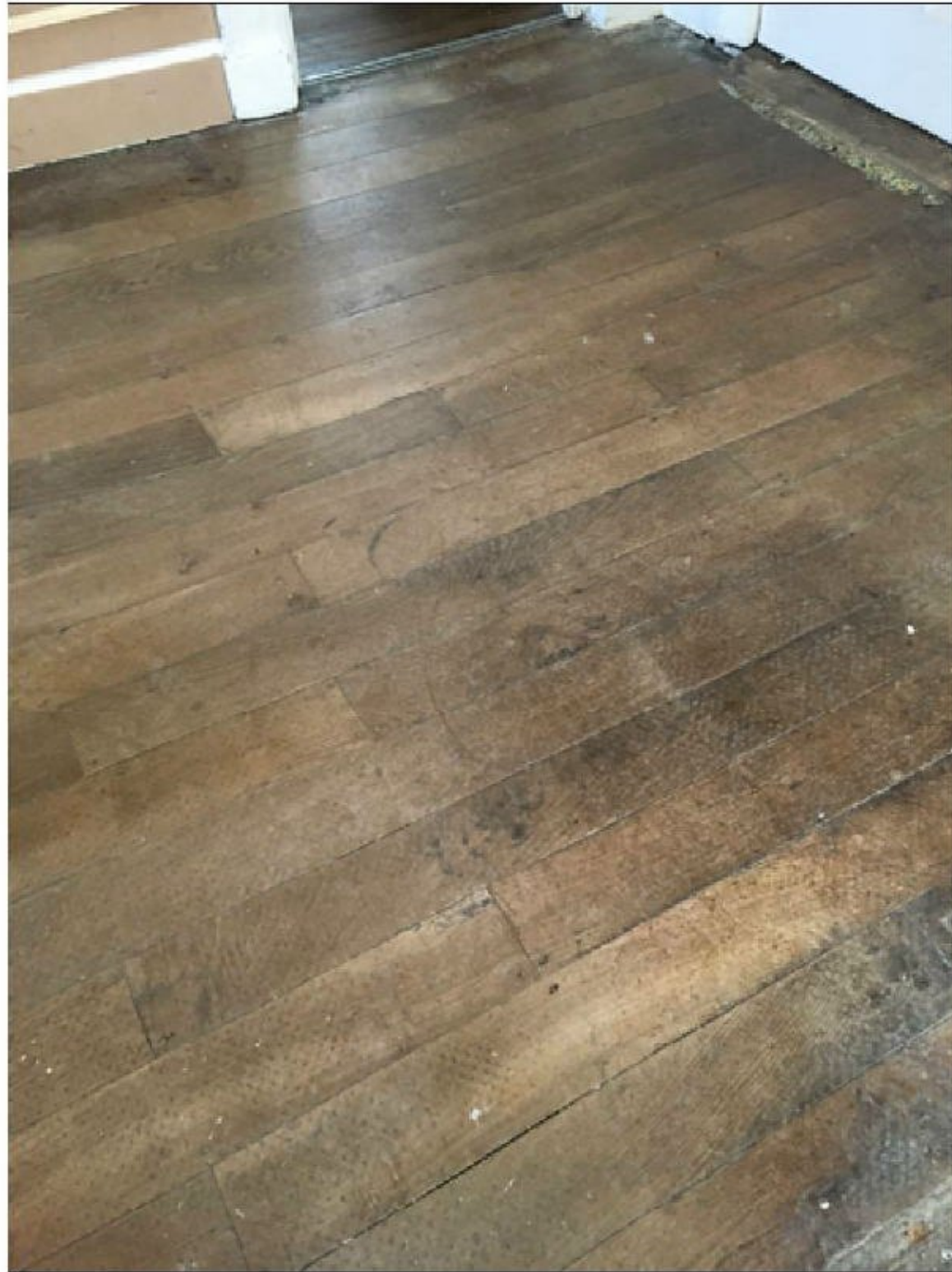
Internal Photo F011

Photo Location - Entrance Hall - Floor Number F011 - See floor plans for location