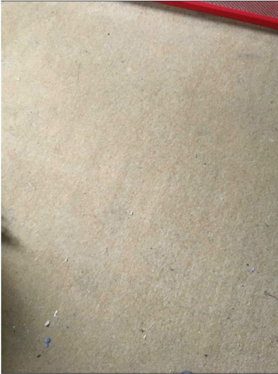
Internal Photo F027

Photo Location - Nador Dorm - Floor Number F027 - See floor plans for location