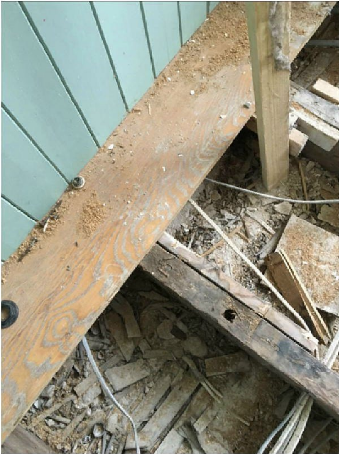
Internal Photo F017

Photo Location - Bathroom - Floor Number F017 - See floor plans for location