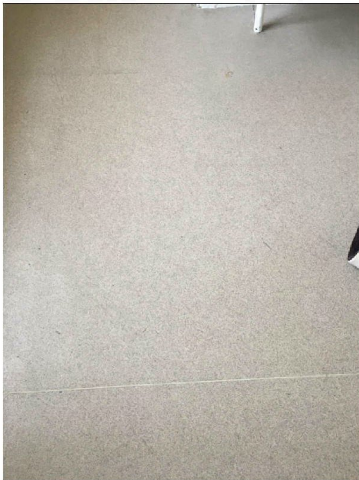
Internal Photo F019

Photo Location - Wc - Floor Number F019 - See floor plans for location