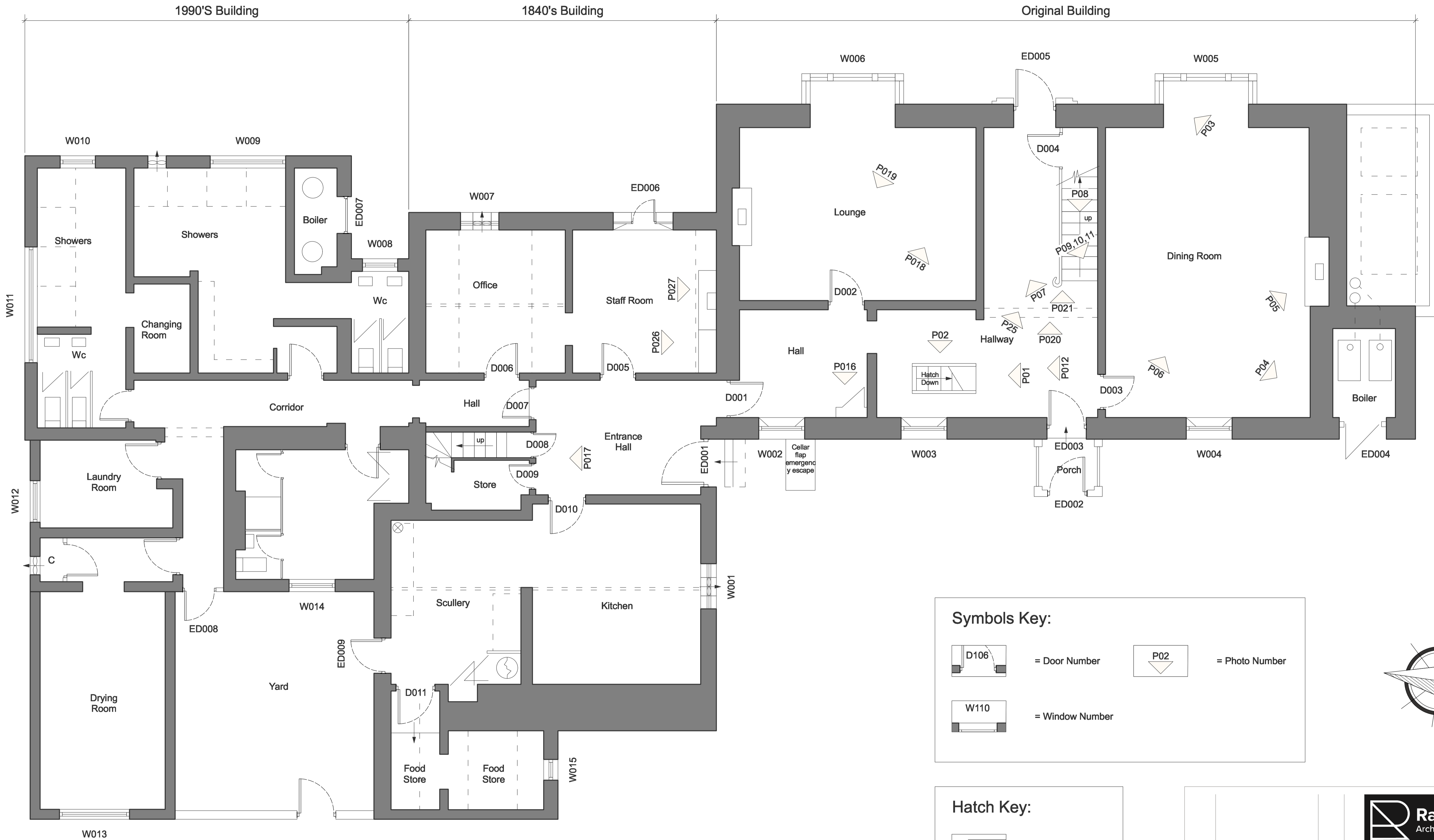
Existing Ground Floor Plan Scale: 1:50

General Notes : Do not scale off drawings. These drawings are concept only and are not for construction. all financial, structural and building control items are to be considered by additional specific professional advice