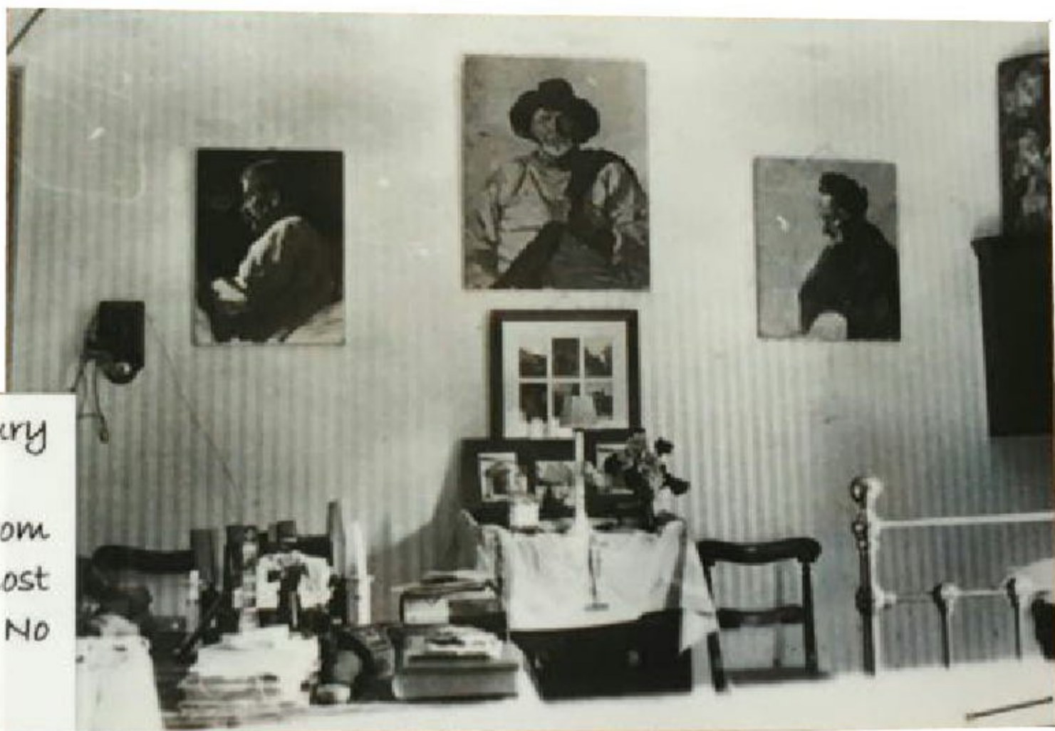
A bedroom at Glasbury House.

Note the telephone from which you could call most of the other rooms. No outside lines!