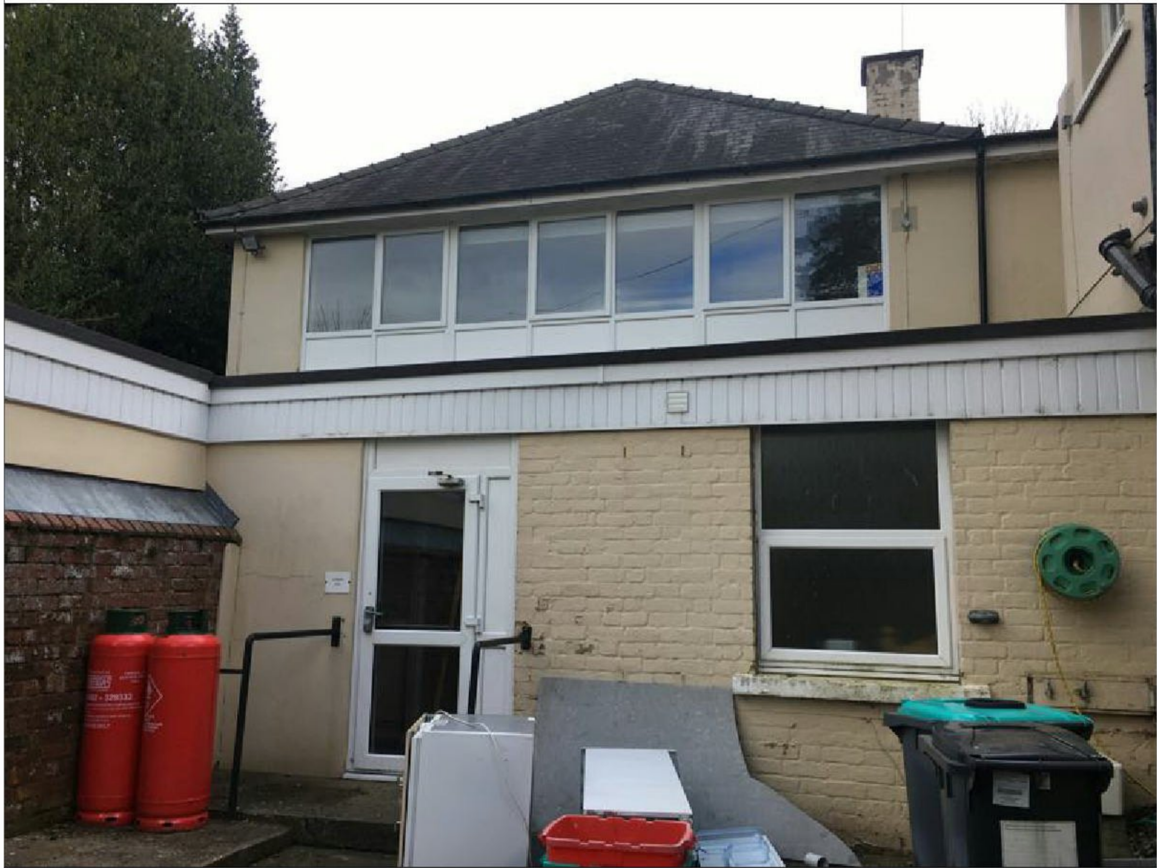
Photo Location - West Courtyard a