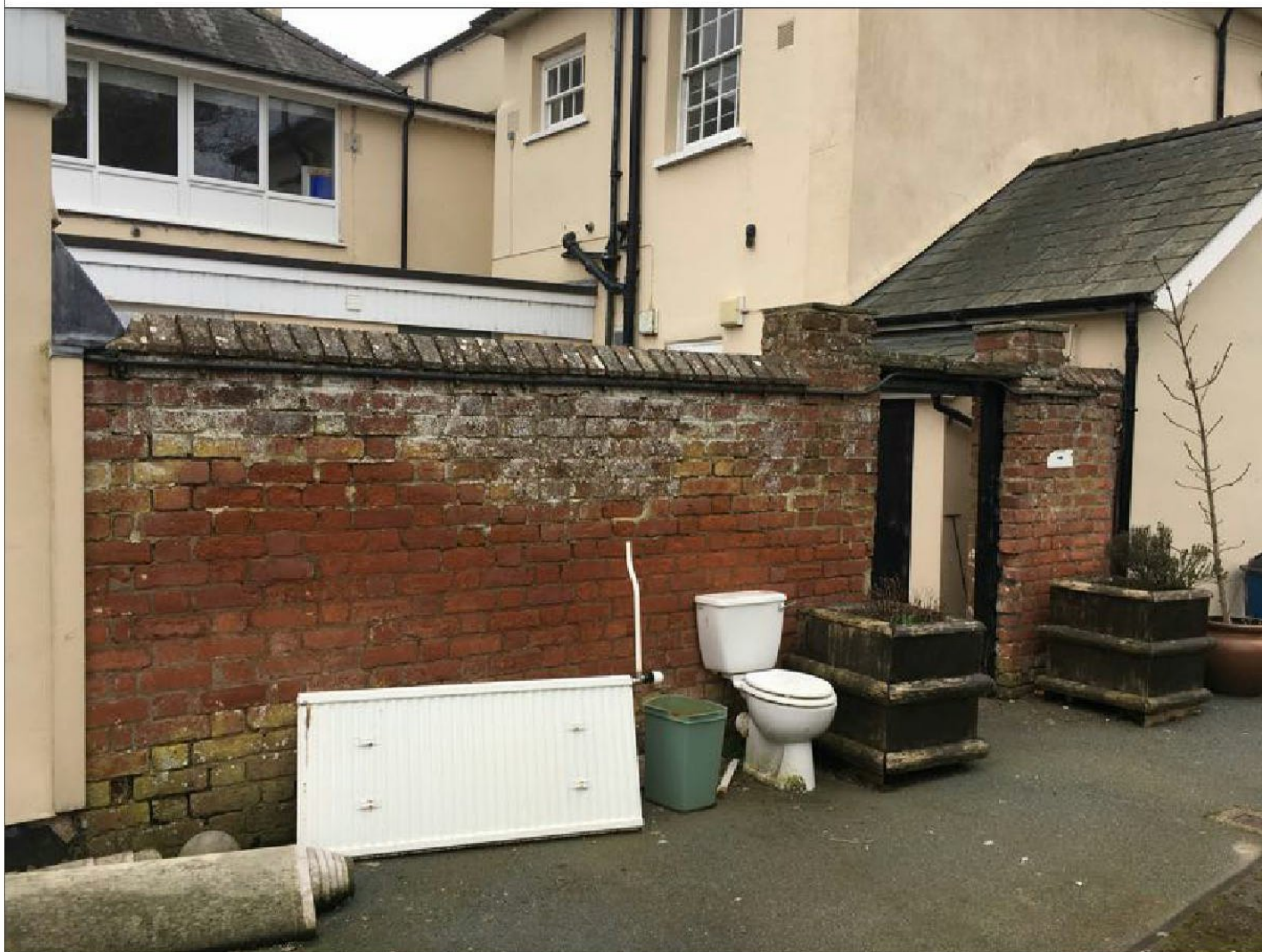
Photo Location - West Courtyard e