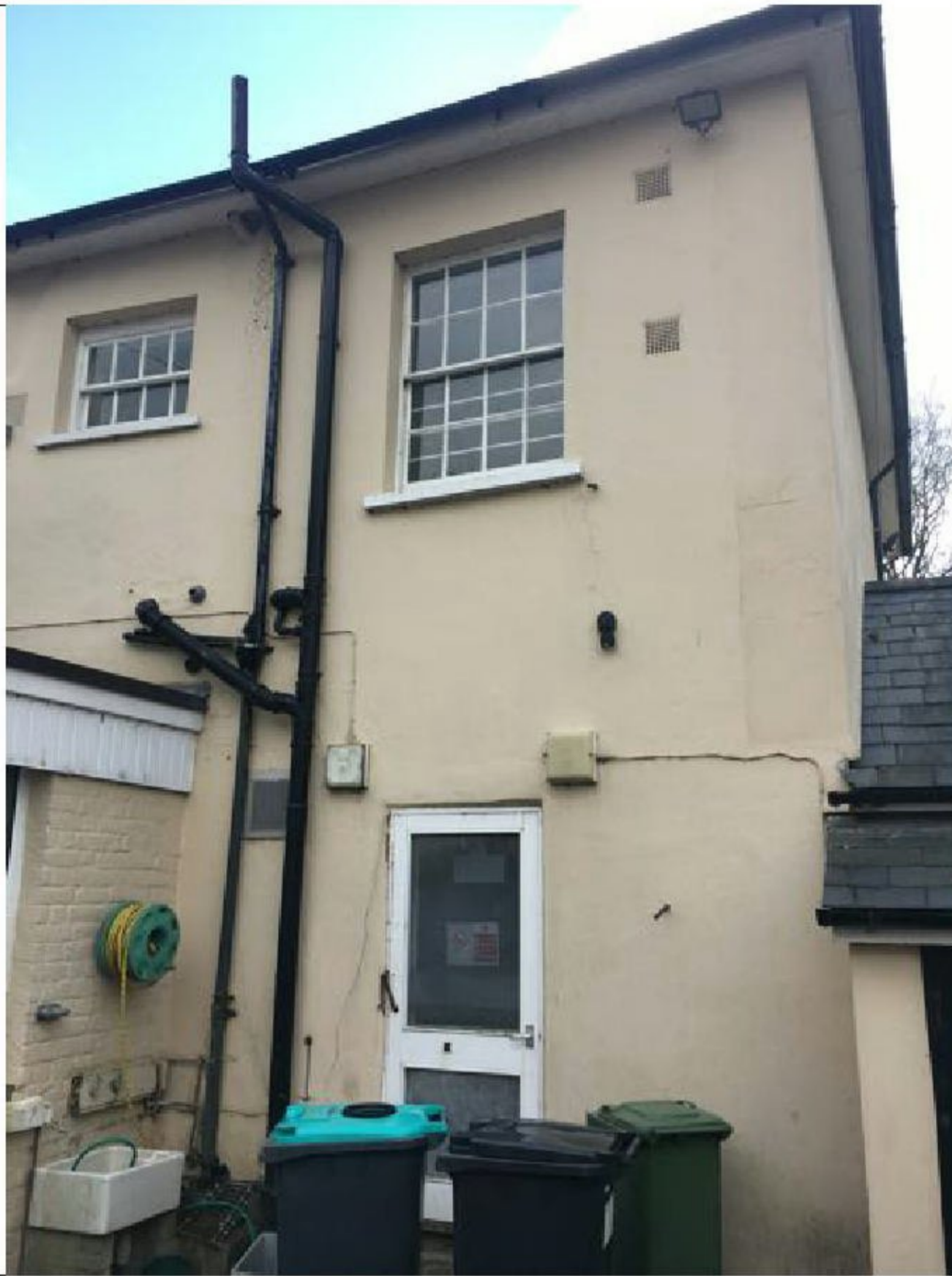
Photo Location - West Courtyard c