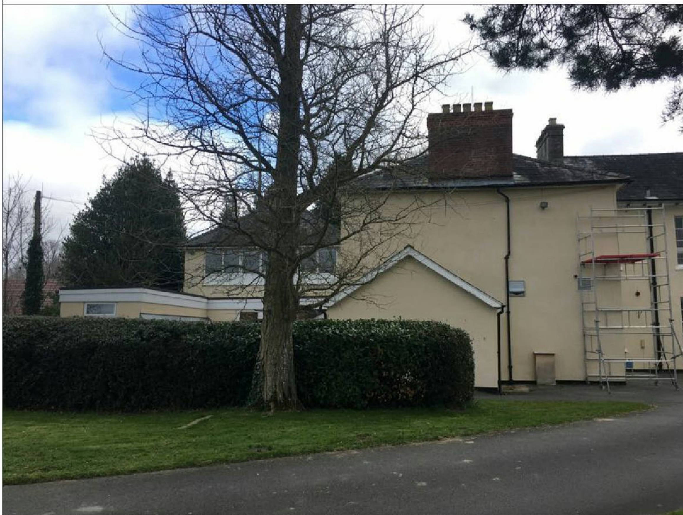
Photo Location - West Elevation image b