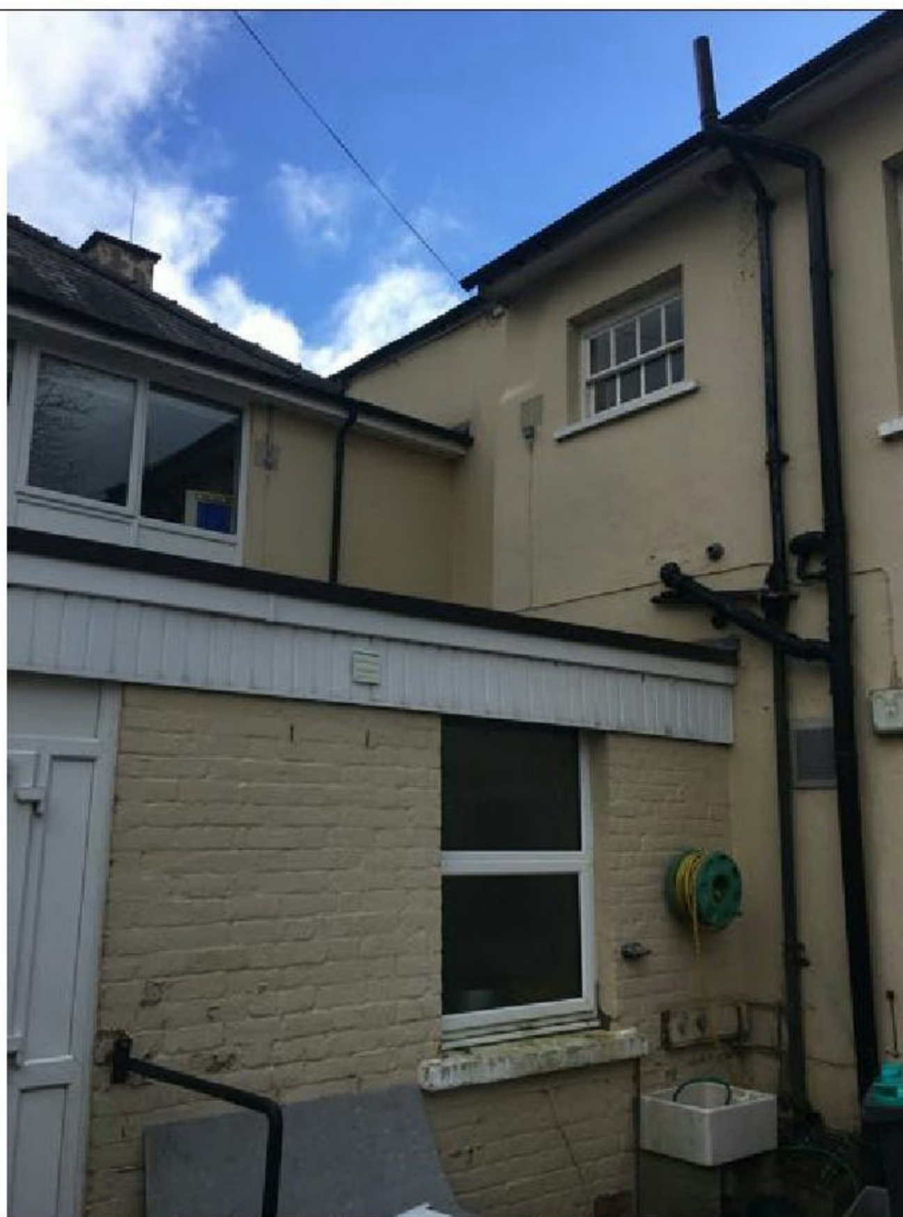
Photo Location - West Courtyard b