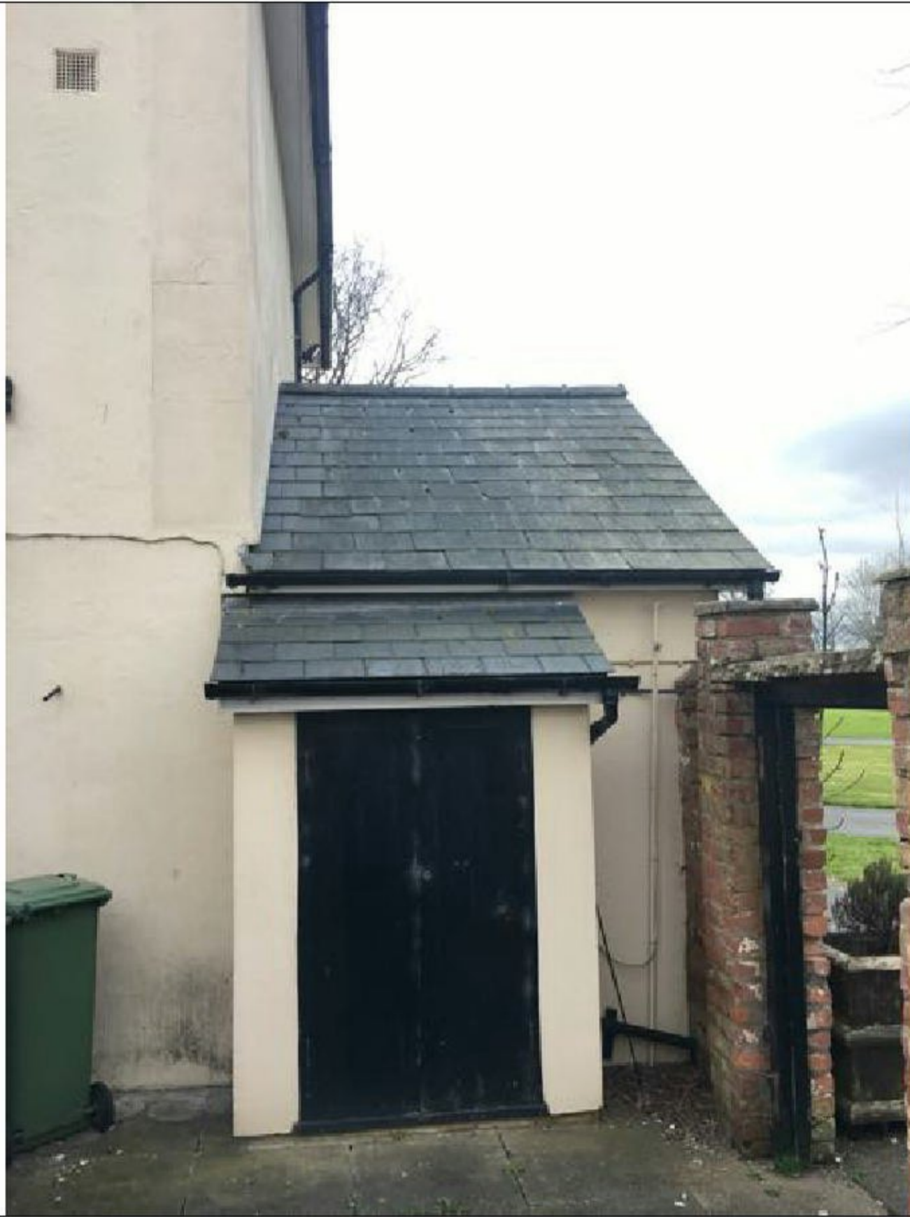
Photo Location - West Courtyard d