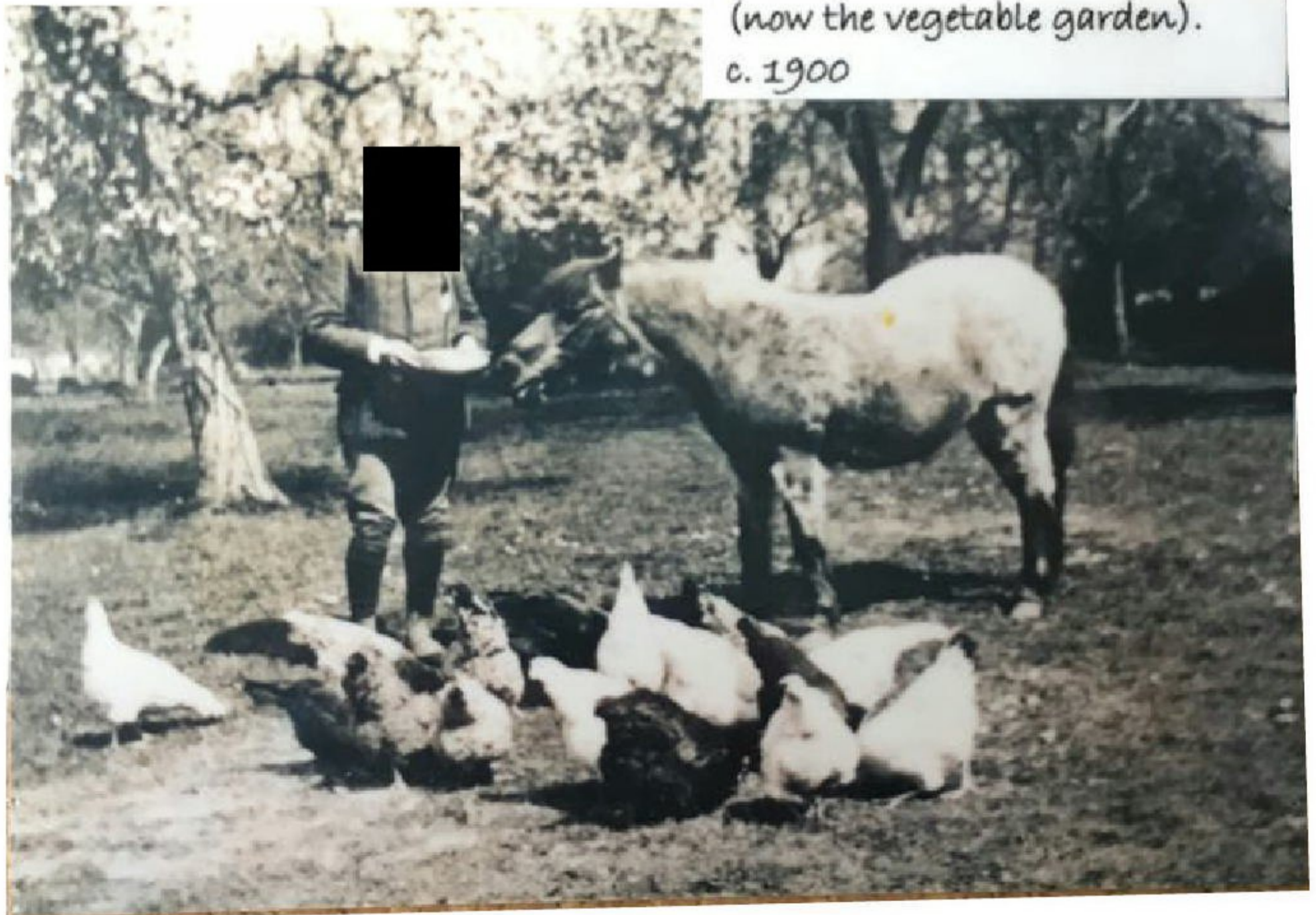
Feeding time in the orchard (now the vegetable garden). c. 1900