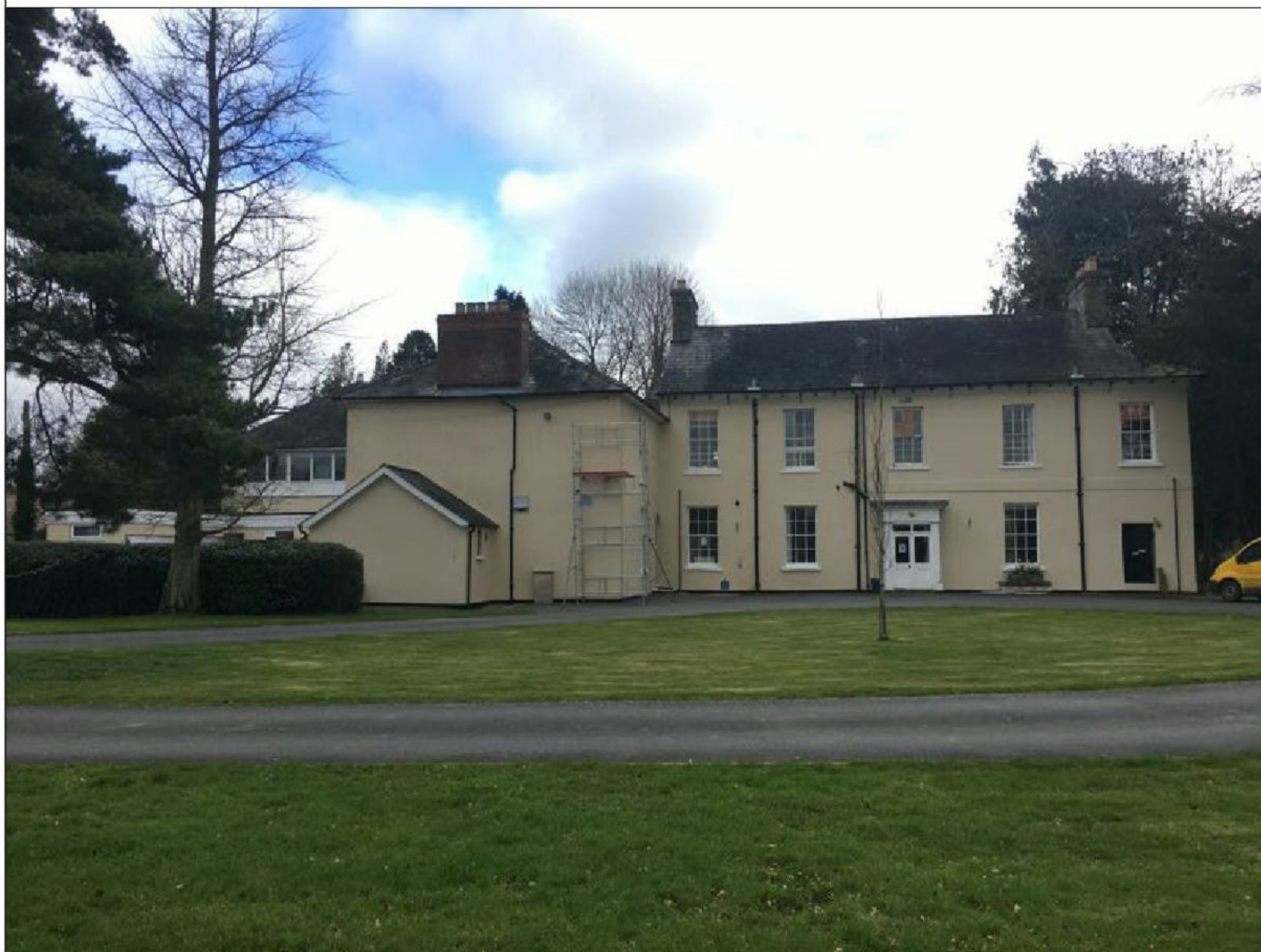
Photo Location - West Elevation image a