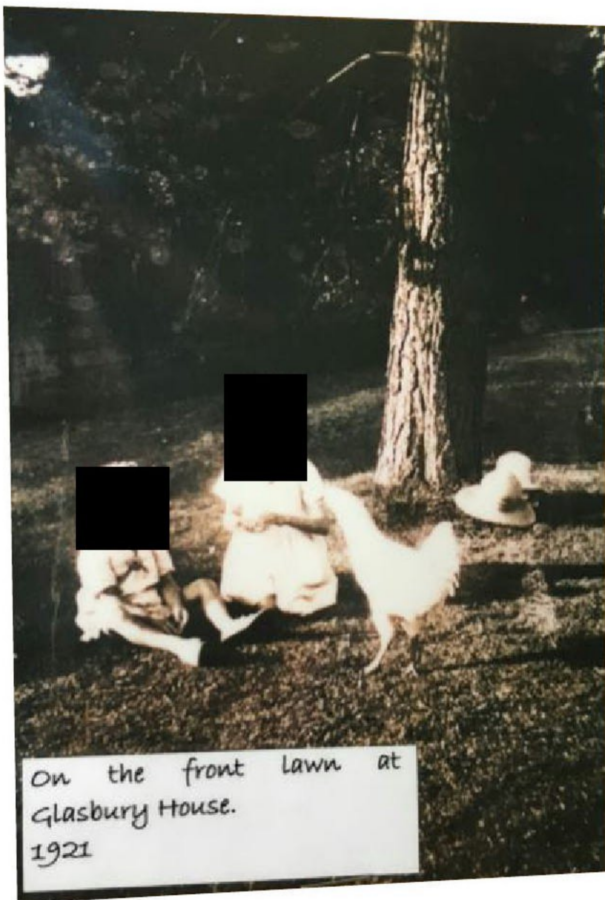
On the front lawn at Glasbury House. 1921