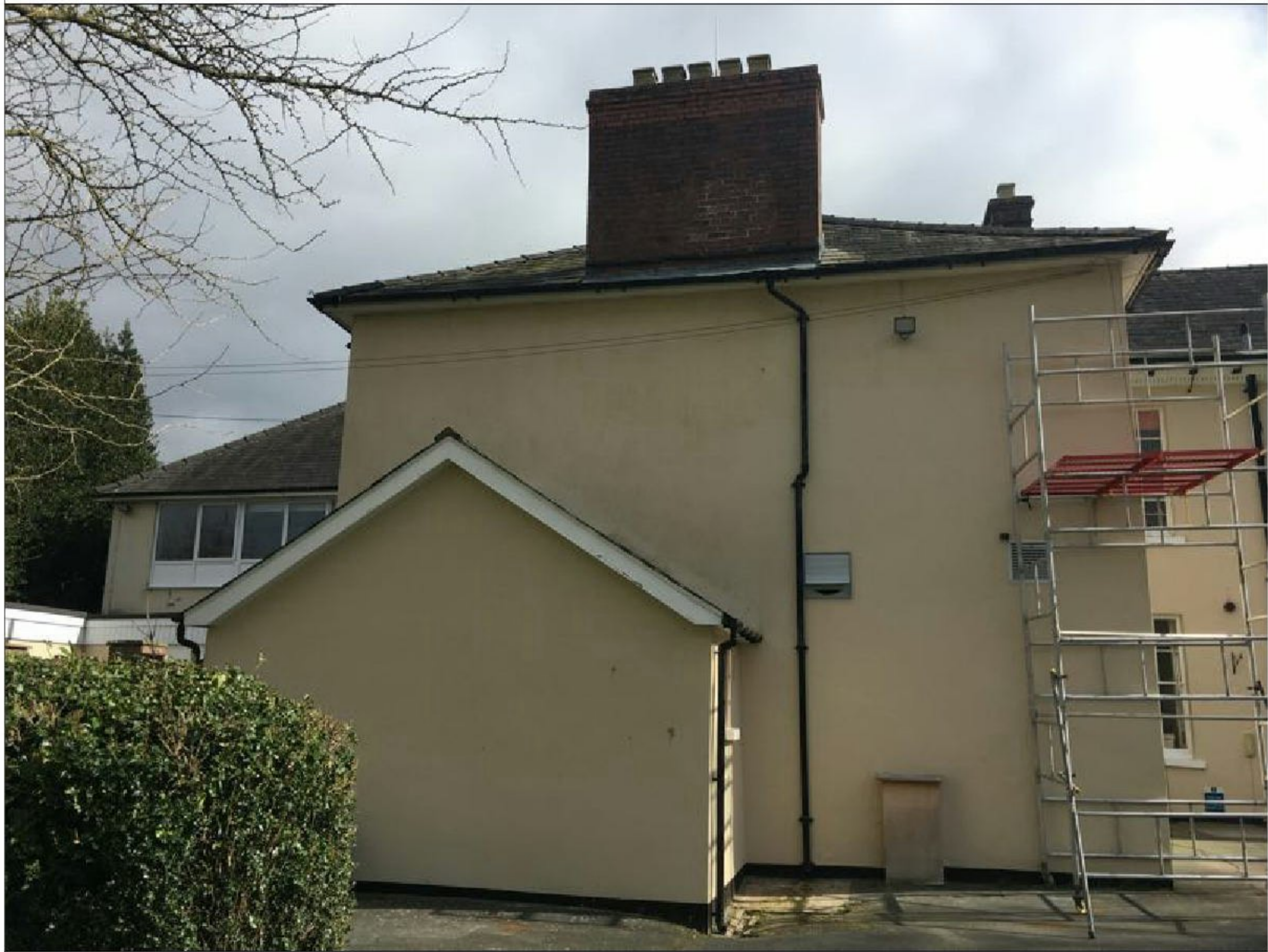
Photo Location - West Elevation image c