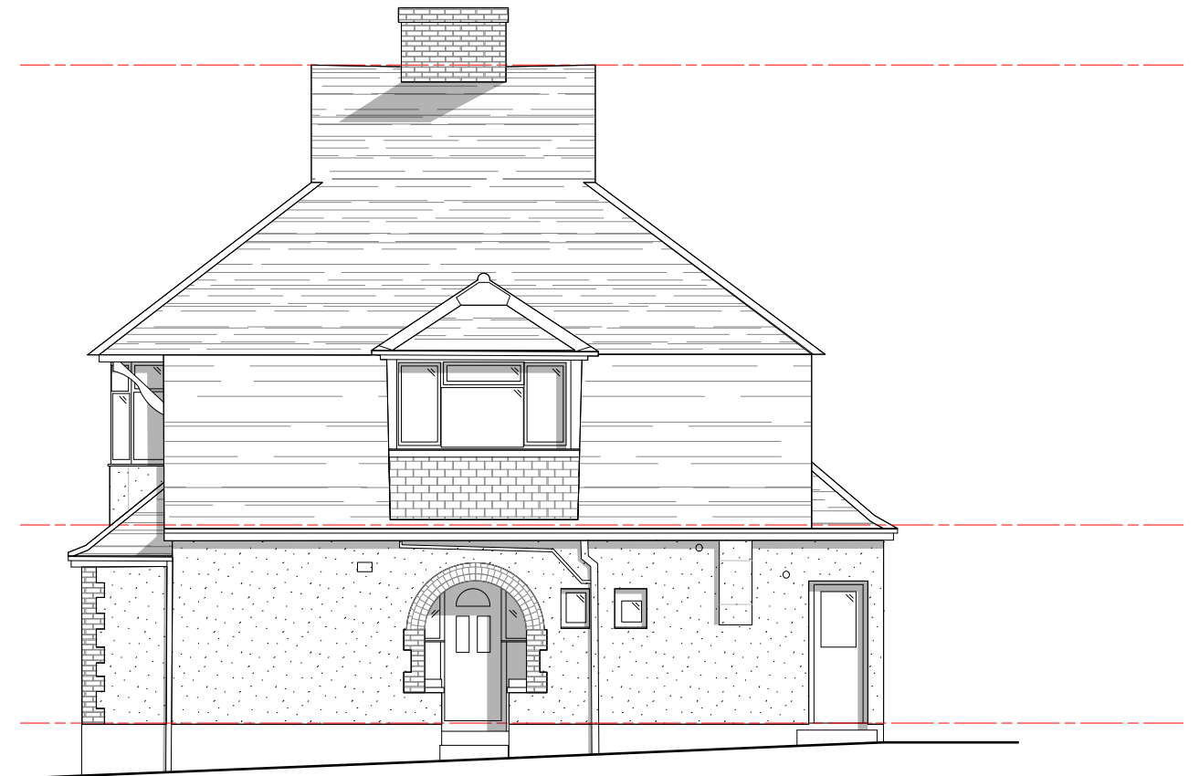
3 - Existing - North Elevation

© All rights reserved. All dimensions to be checked on site. Drawings are not for construction purposes.