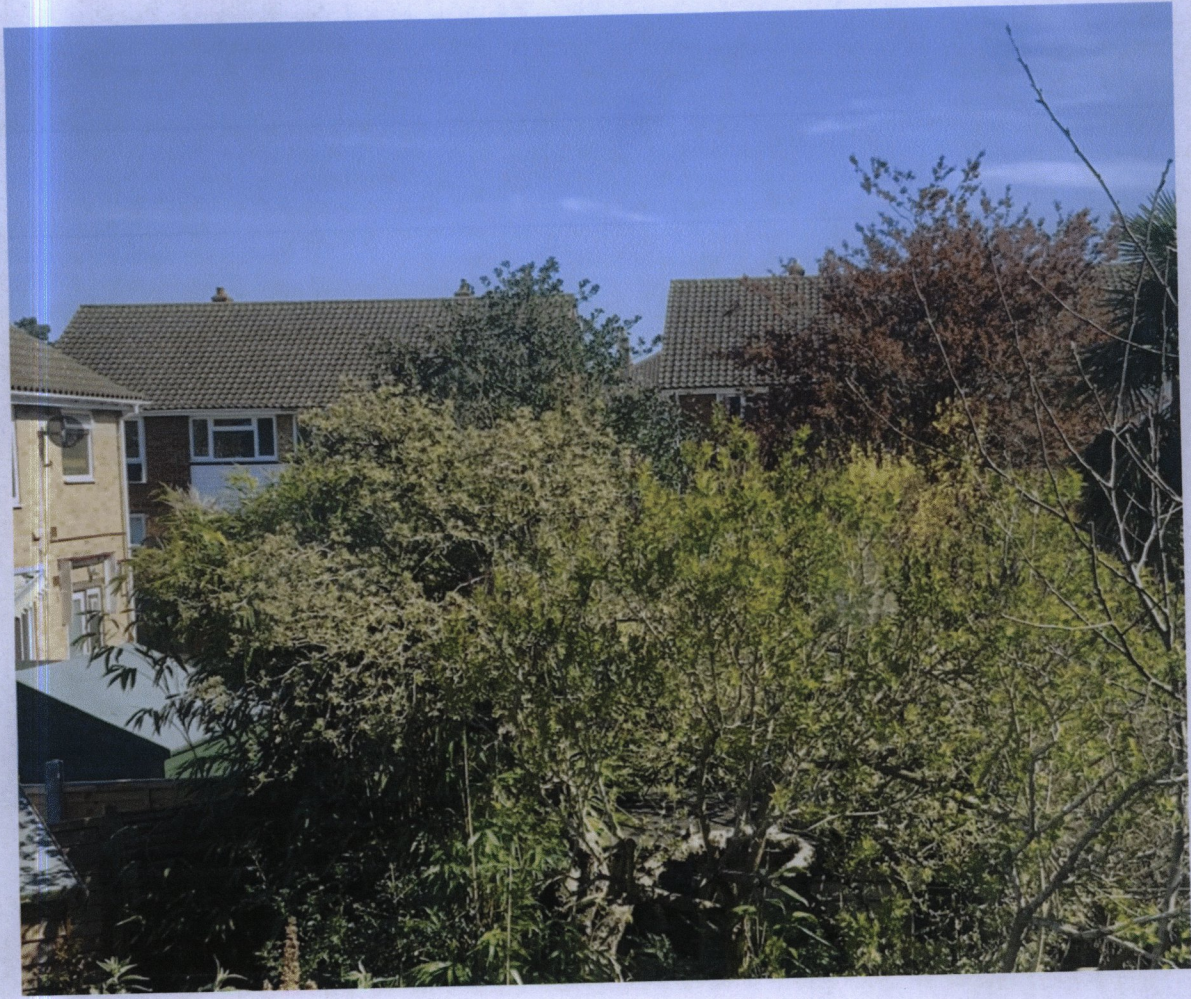
REAR VIEW FACING RIGHT (SE)