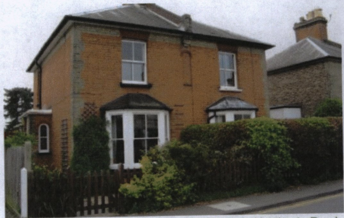
Well preserved unlisted but 'positive' cottages in Heathcote Road

English Heritage guidance advises that a general presumption exists in favour of retaining those buildings which make a positive contribution to the character or appearance of a conservation area. The guidance note states that proposals to demolish such buildings should be assessed against the same broad criteria as proposals to demolish listed buildings. The demolition of non-positive buildings may be allowed, but any redevelopment of the site will have to closely conform to existing Council policies, particularly in terms of site density, scale, materials and details.