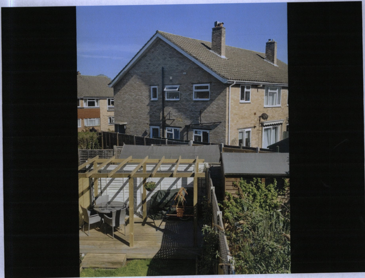
REAR VIEW (MIDDLE)