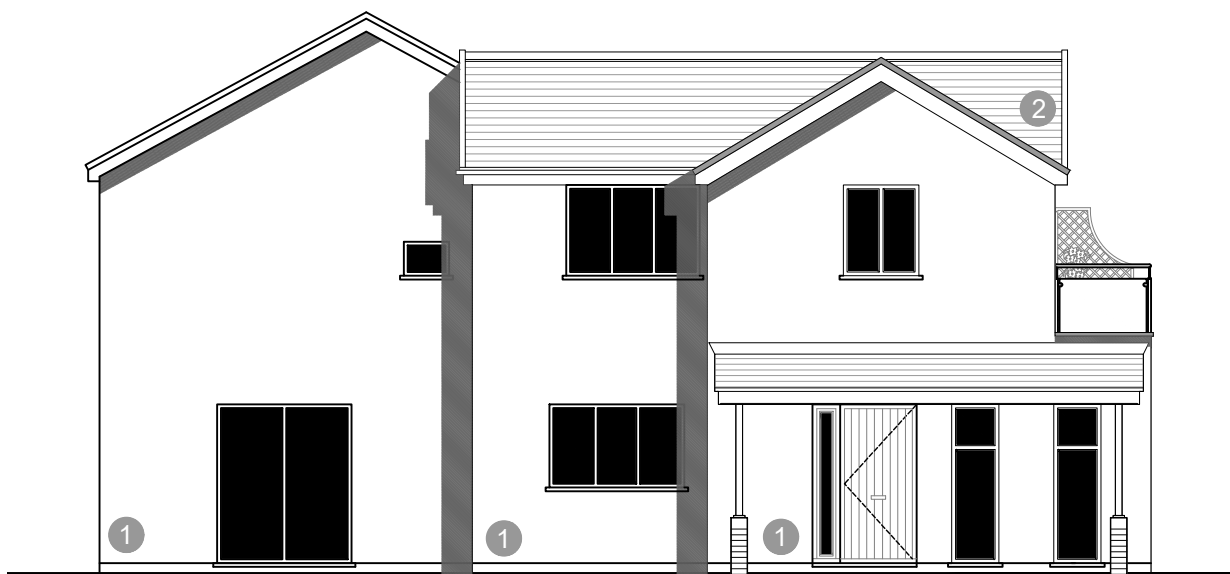
PROPOSED FRONT ELEVATION 1:100 @ A3