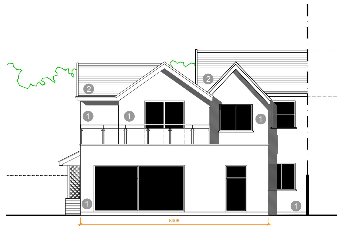
PROPOSED REAR ELEVATION 1:100 @ A3