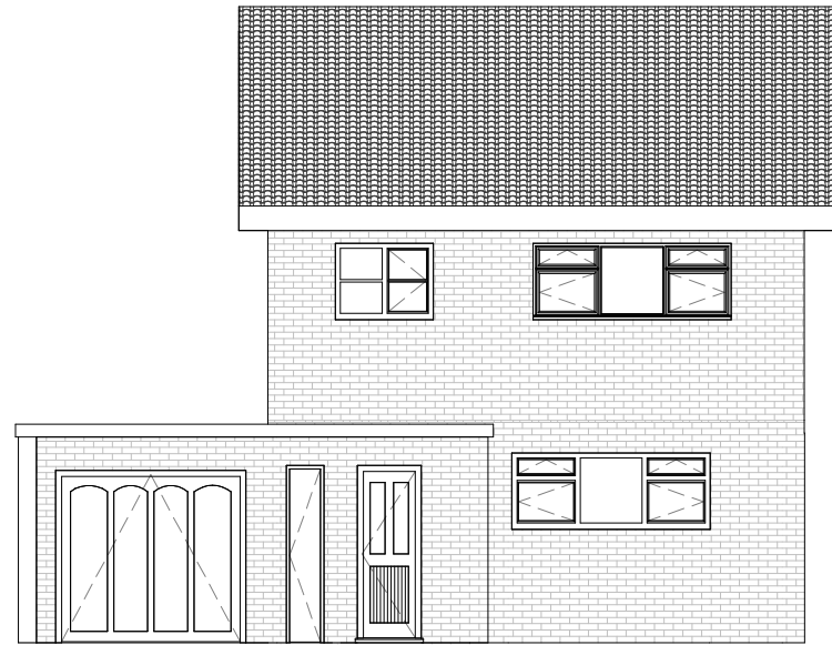
2 Existing Front Elevation 1 : 100