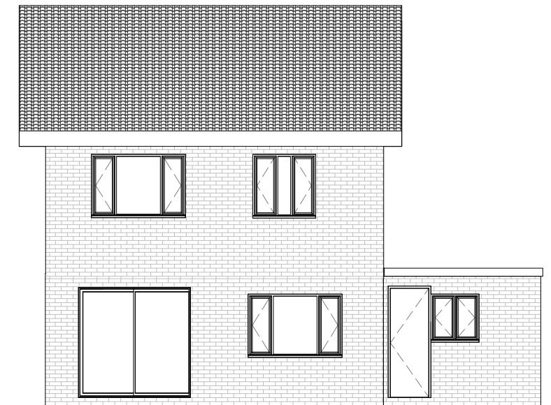
5 Existing Rear Elevation 1 : 100