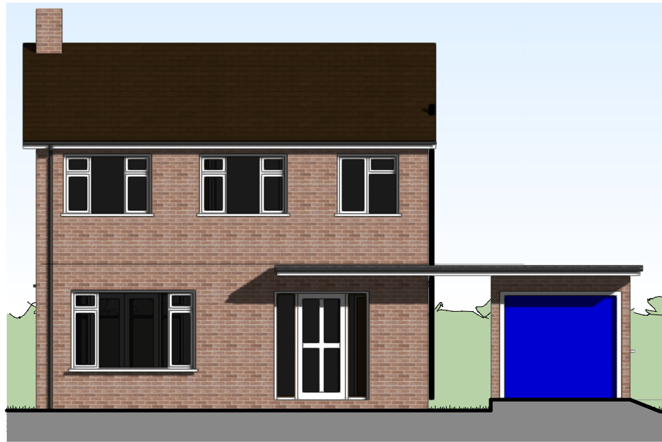
FRONT ELEVATION - NORTH WEST