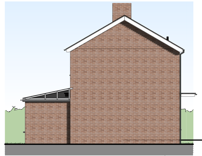
SIDE ELEVATION - NORTH EAST