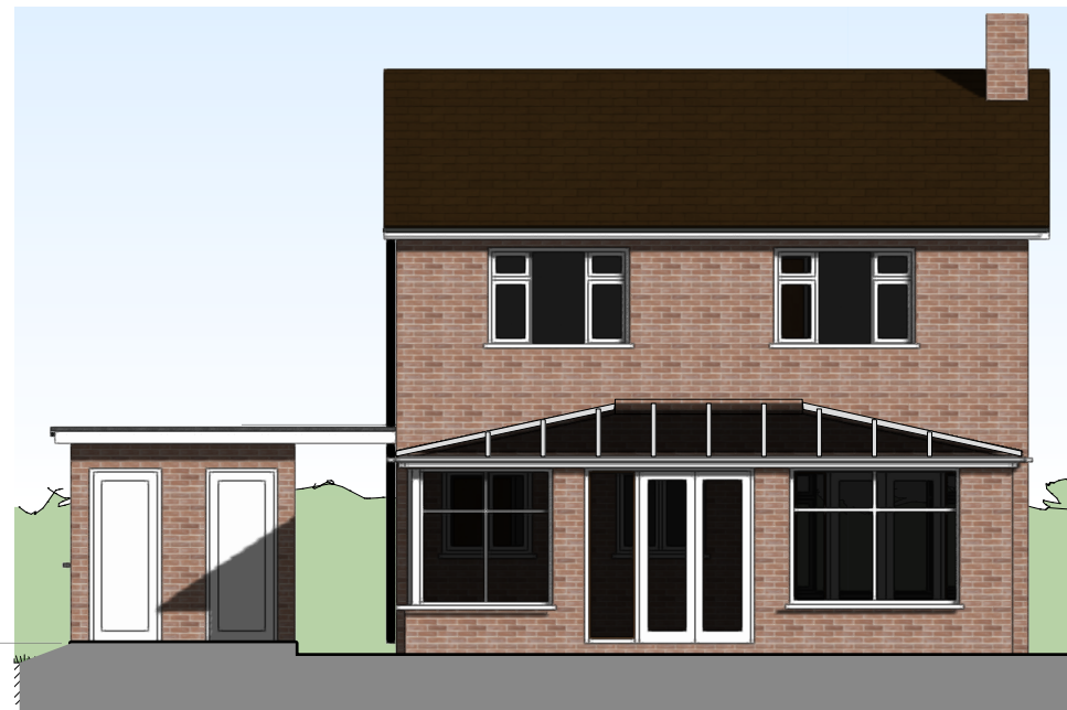
REAR ELEVATION - SOUTH EAST