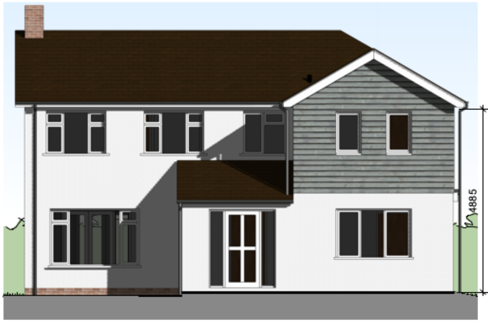
FRONT ELEVATION - NORTH WEST