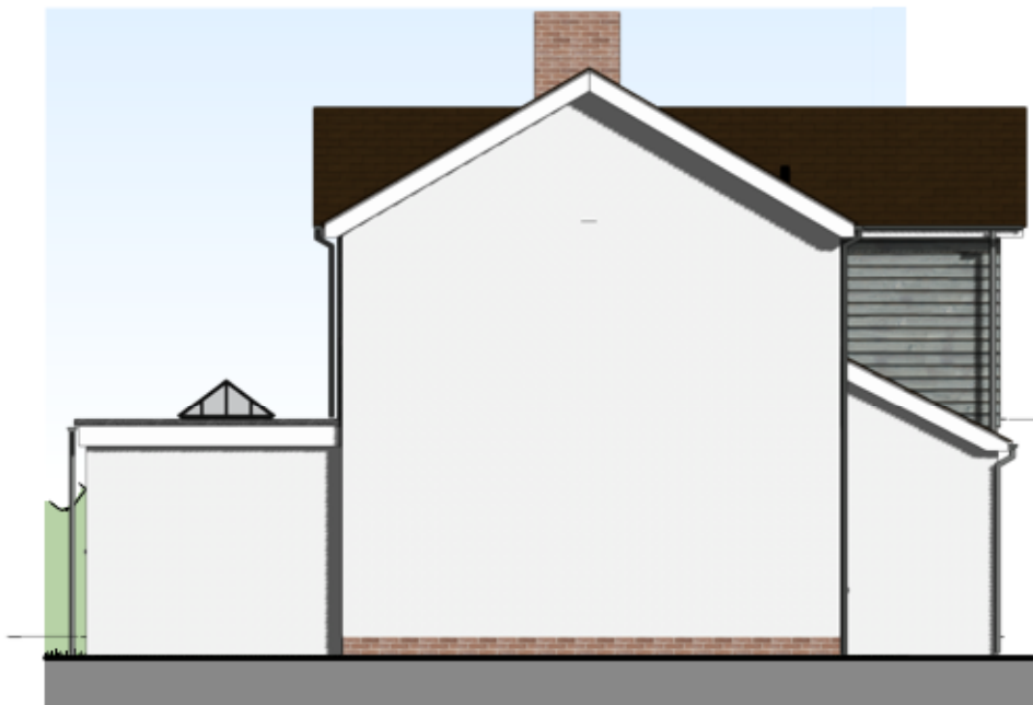
SIDE ELEVATION - NORTH EAST