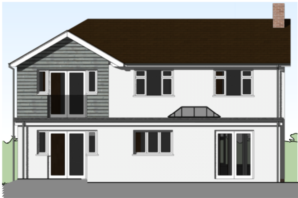
REAR ELEVATION - SOUTH EAST