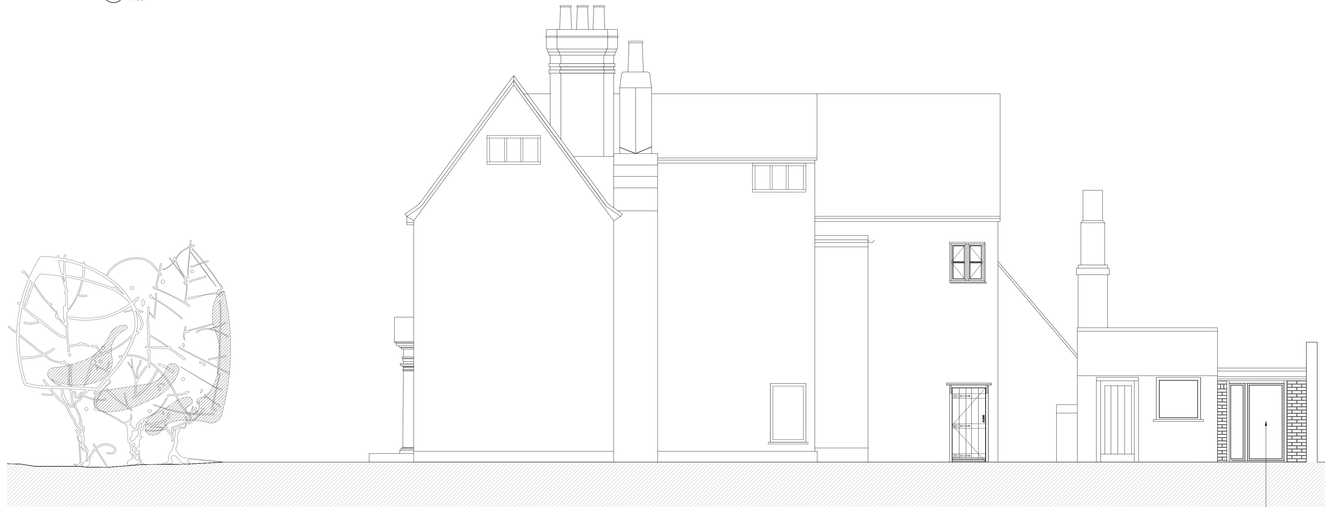
2 Existing South Elevation 1:50

New low profile aluminium glazed door with side glazed pane