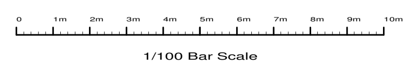
1/100 Bar Scale

These plans have been produced to a recognized scale and a standard paper size, both shown in the title block. If you have received this drawing as a pdf or similar file type, please check when printing that you have an accurately sized drawing using the scale bar provided.