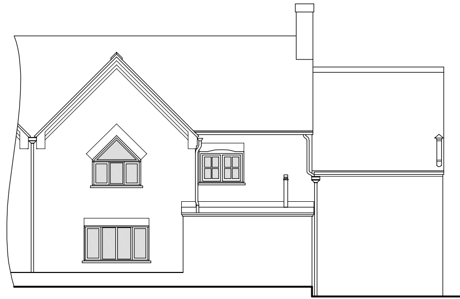
Rear Elevation (1:100)