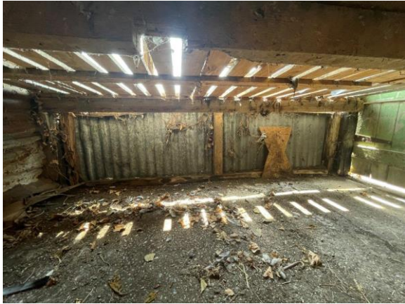
Internal elevation at low level facing south