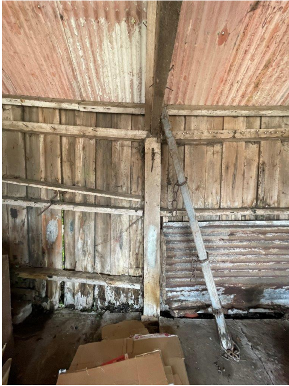
Open store internal elevation facing north in centre of room