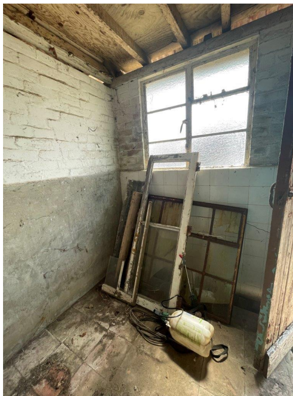
Wall trough urinal, accessed from south elevation