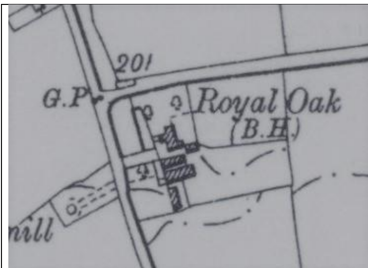
1947-51 OS Map