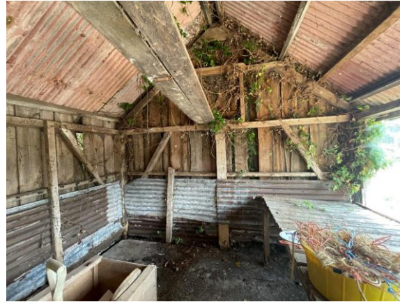
Open store internal elevation facing east