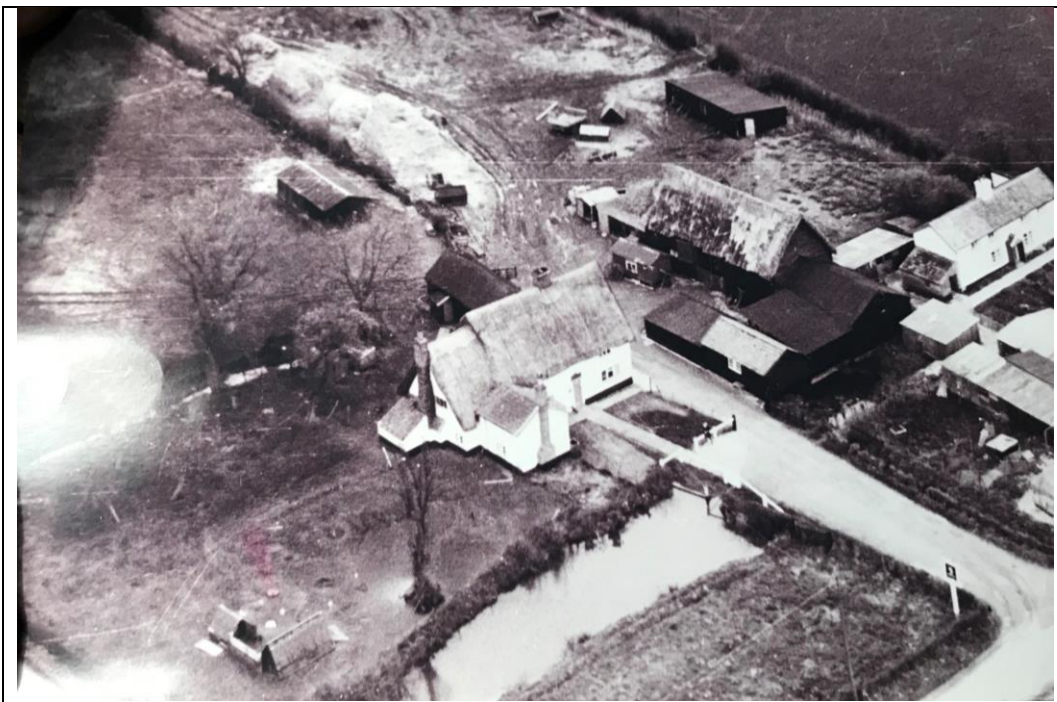
Historic photo presumably from the mid C20