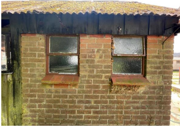
North elevation windows