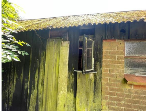
North elevation window in over and under boarding