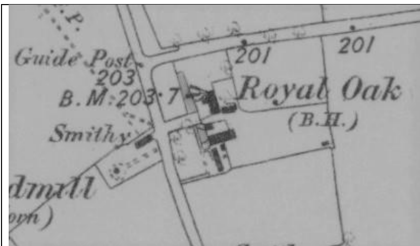
1883-84 OS Map