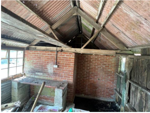
Open store to east, looking towards mens WC to west