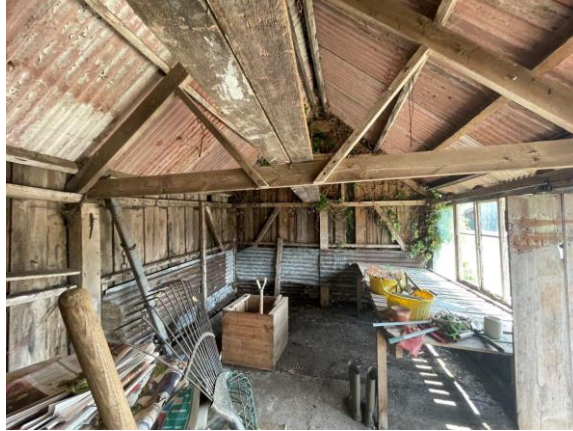
Open store to east looking east