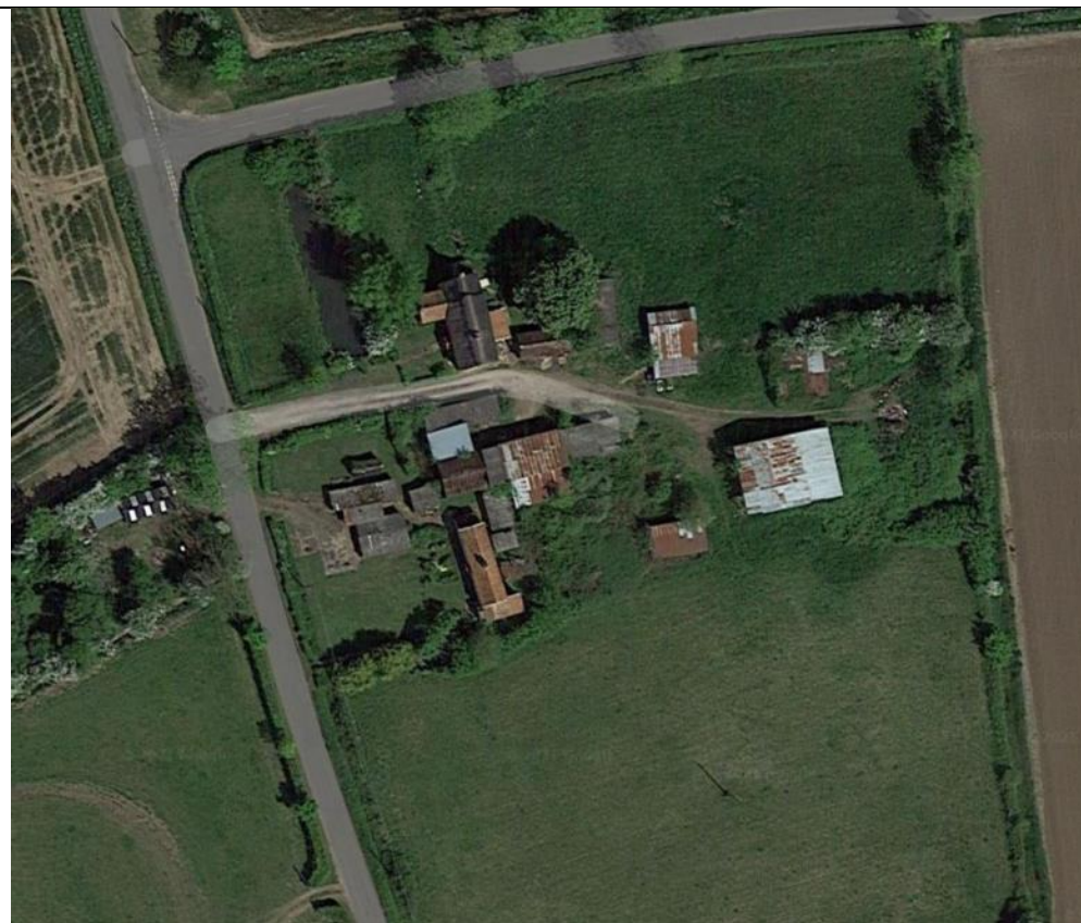
Aerial view of site and neighbouring property.

The outbuilding sits to the south east of The Oak.