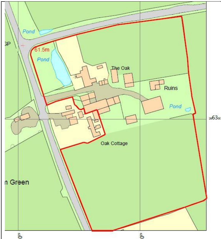
Extract from Location plan