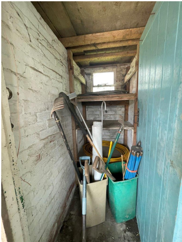
Store opposite the urinal