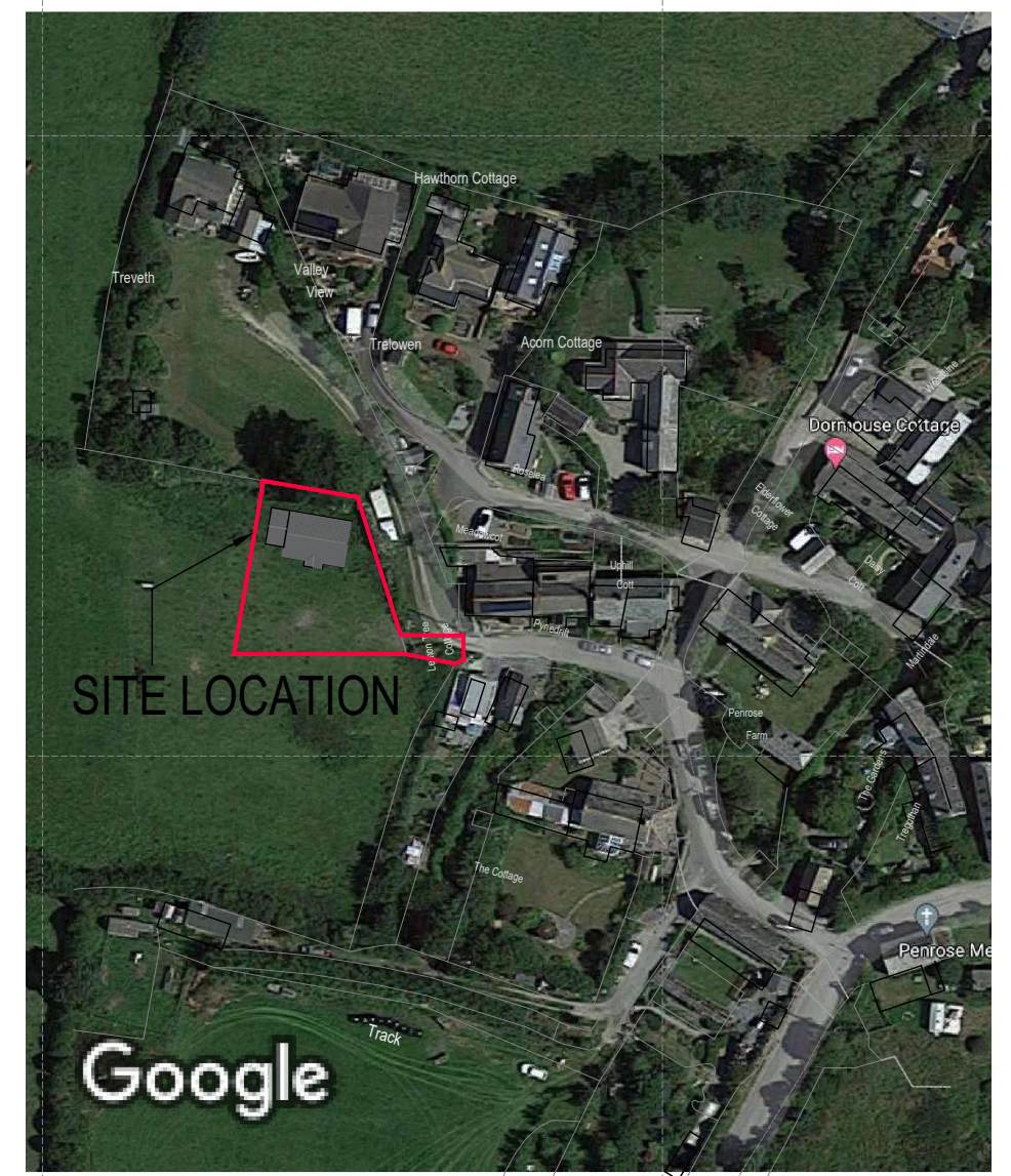
Getmapping plc, Infoterra Ltd & Bluesky, 20 m