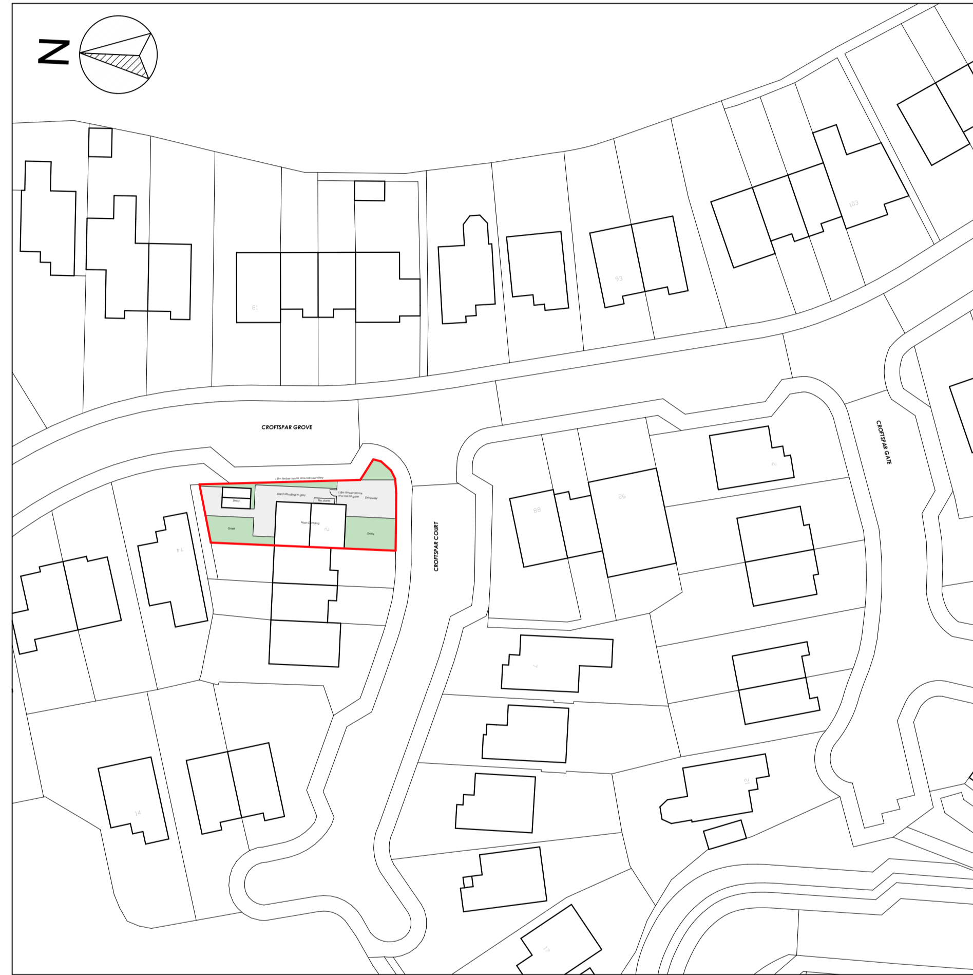
SITE PLAN AS EXISTING