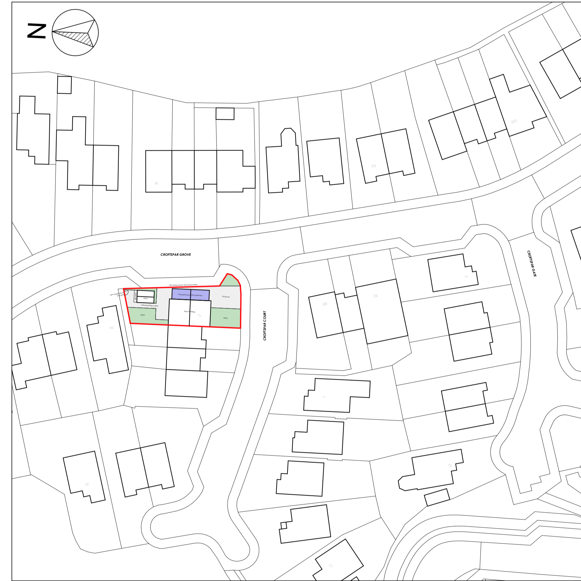
SITE PLAN AS PROPOSED