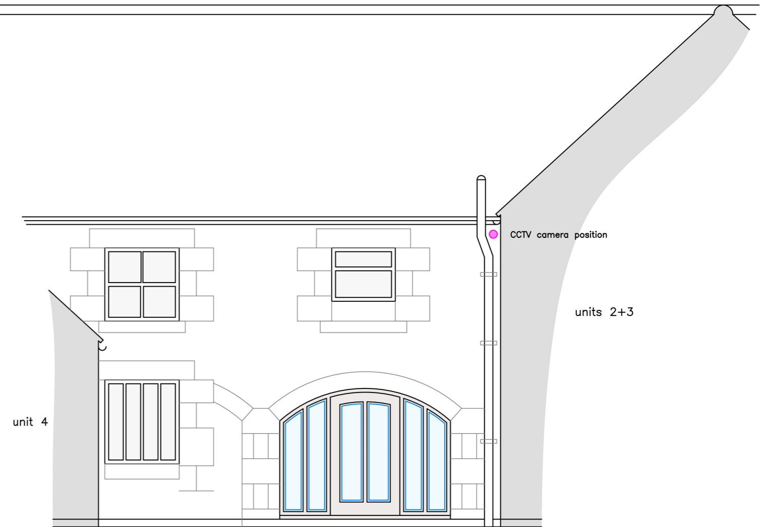
proposed elevation new disabled access door with side glazed panel infill to existing hemmel

General Notes: The contractor must check and verify the dimensions of the whole site and building, including levels, sewer inverts and locations of all services before commencing work. All dimensions indicated in metric (mm), do not scale. This drawing to be read with and checked against any specialist drawings, including structural engineers details prior to work commencement. The contractor must work in strict compliance with all British Standards, Building Regulations, Acts of Parliament. This drawing and the work shown are the copyright of Darryl Bingham and cannot be copied without consent.