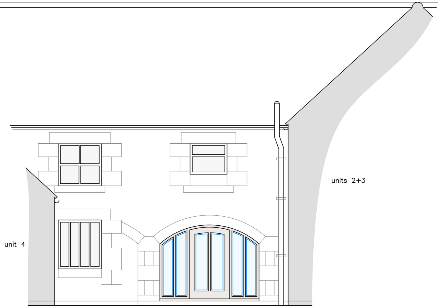
proposed elevation new disabled access door with side glazed panel infill to existing hemmel

General Notes: The contractor must check and verify the dimensions of the whole site and building, including levels, sewer inverts and locations of all services before commencing work. All dimensions indicated in metric (mm), do not scale. This drawing to be read with and checked against any specialist drawings, including structural engineers details prior to work commencement. The contractor must work in strict compliance with all British Standards, Building Regulations, Acts of Parliament. This drawing and the work shown are the copyright of Darryl Bingham and cannot be copied without consent.