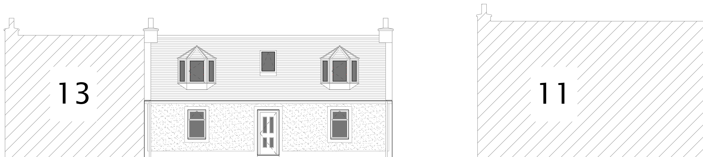
12 VICTORIA PLACE