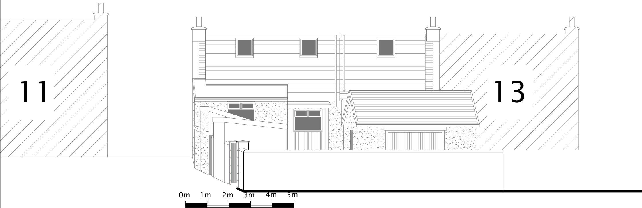
HARVEY PLACE EXISTING NORTH ELEVATION

E X T E N S I O N 12 VICTORIA PLACE, BANFF. AB45 1EL