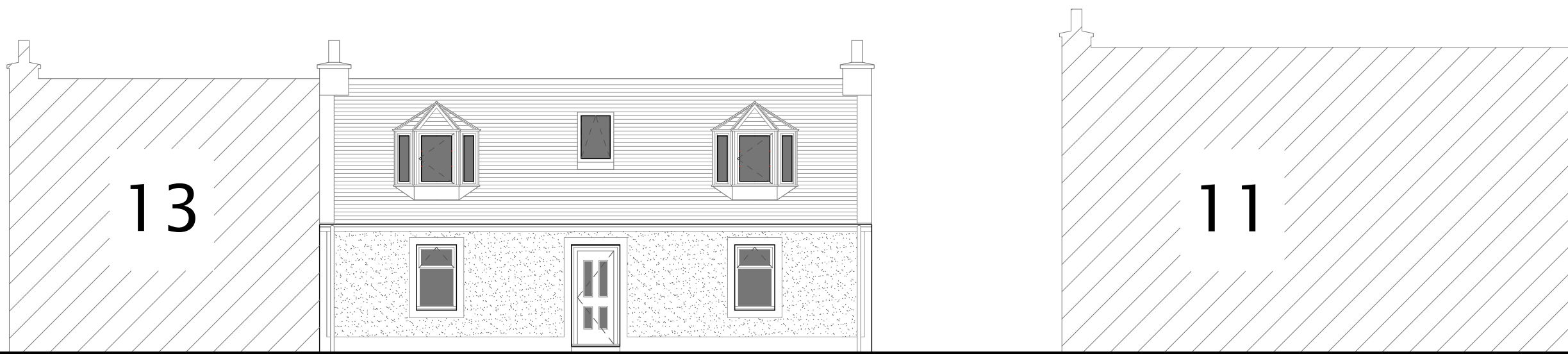
12 VICTORIA PLACE