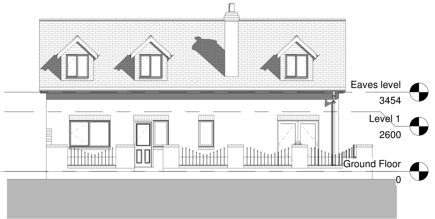
West 1 : 100