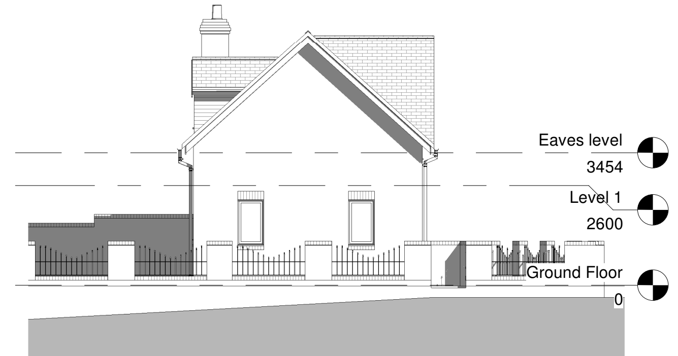
South 1 : 100