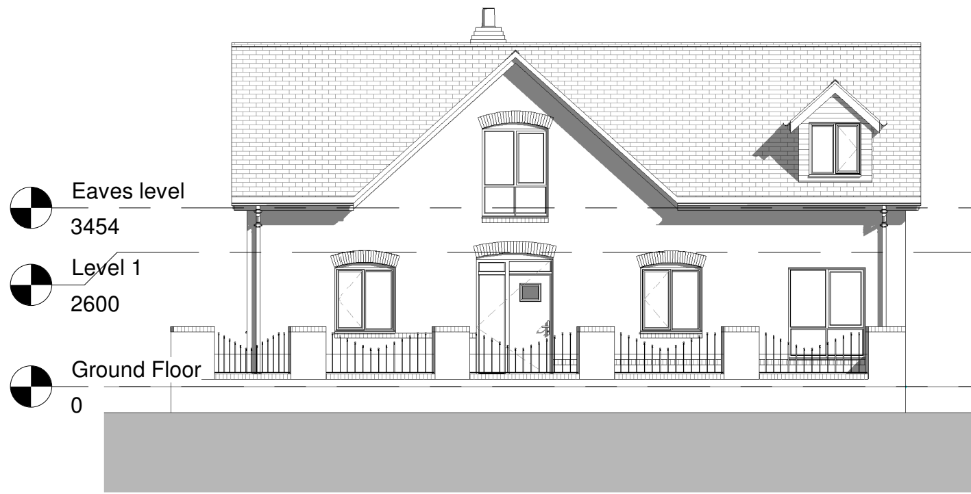
East 1 : 100