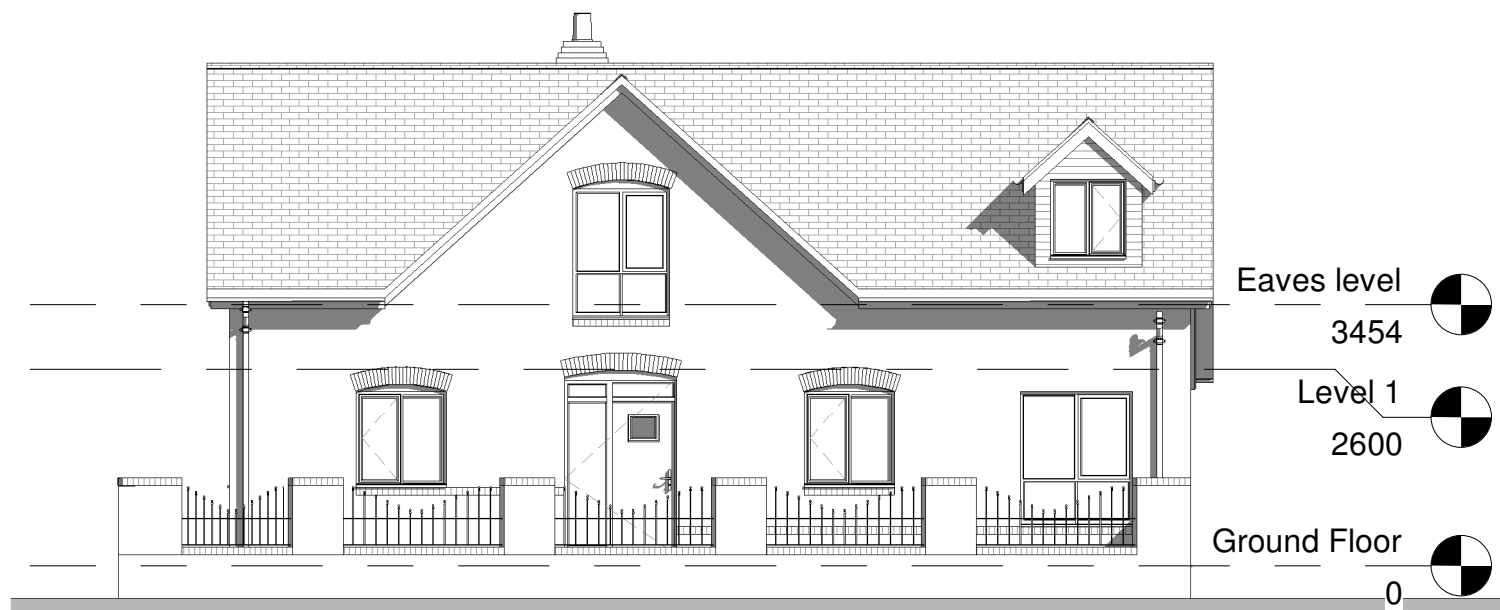
East 1 : 100