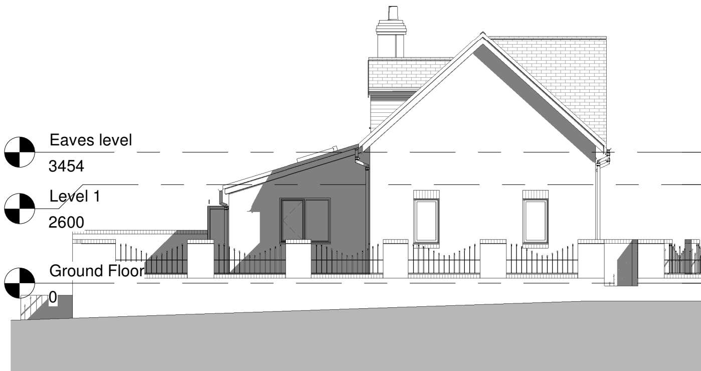
South 1 : 100