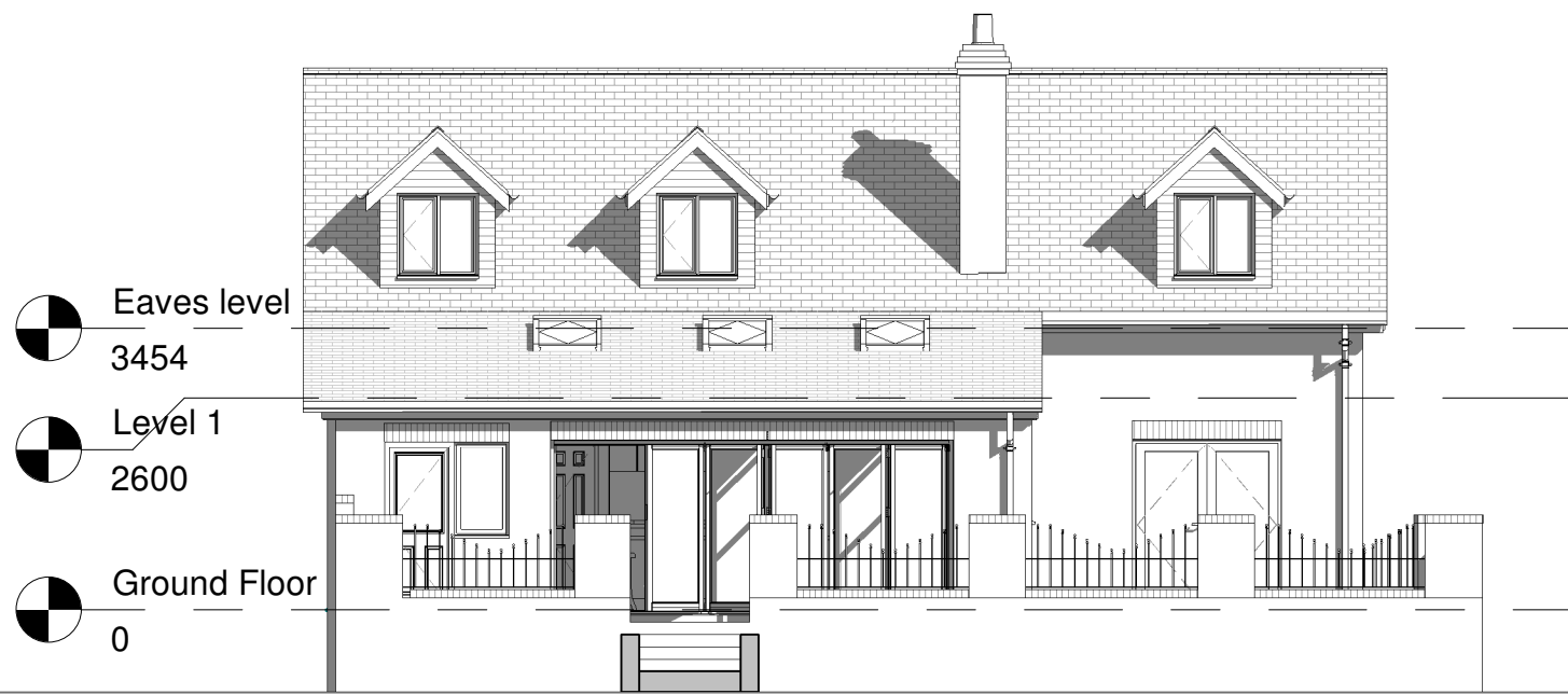
West 1 : 100