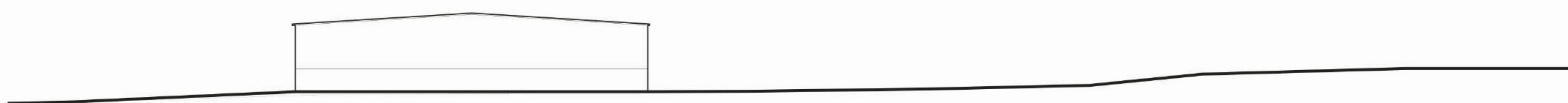
EXISTING SECTION B SCALE: 1:100 @A1

THIS DRAWING IS THE SOLE PROPERTY OF FRONT ARCHITECTURE LTD AND SHOULD NOT BE COPIED OR REPRODUCED WITHOUT PRIOR WRITTEN CONSENT. CONTRACTORS ARE TO CHECK ALL LEVELS AND DIMENSIONS BEFORE WORK COMMENCES ON SITE AND ANY DISCREPANCIES ARE TO BE REFERRED TO FRONT ARCHITECTURE. DO NOT SCALE WORK TO FIGURED DIMENSIONS ONLY.