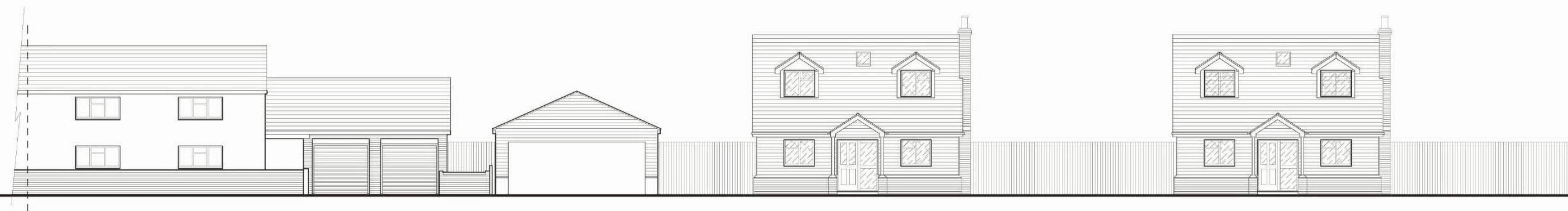
APPROVED SECTION A SCALE: 1:100 @A1