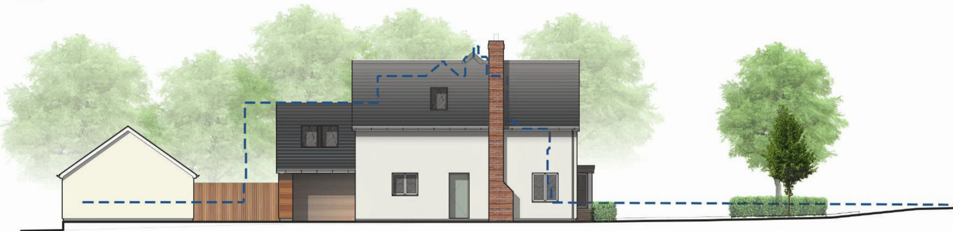
PROPOSED SECTION B SCALE: 1:100 @A1 BLUE OUTLINE REPRESENTS THE SCALE OF THE CURRENT APPROVAL