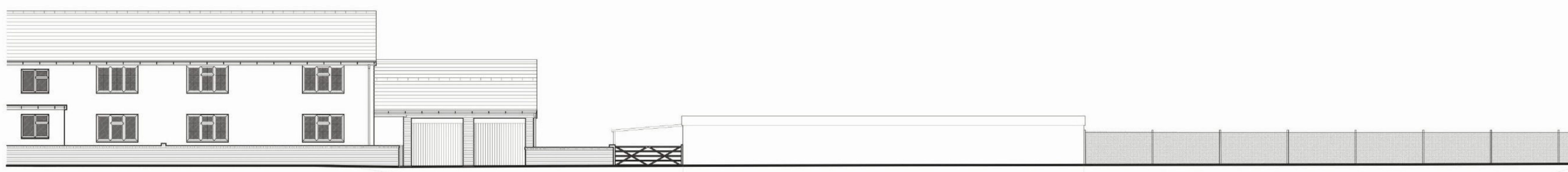
EXISTING SECTION A SCALE: 1:100 @A1