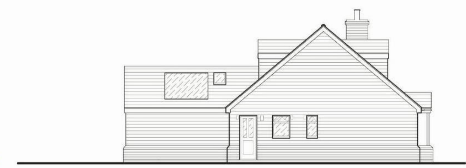
APPROVED SIDE ELEVATION - SECTION B RELATED SCALE: 1:100 @A1