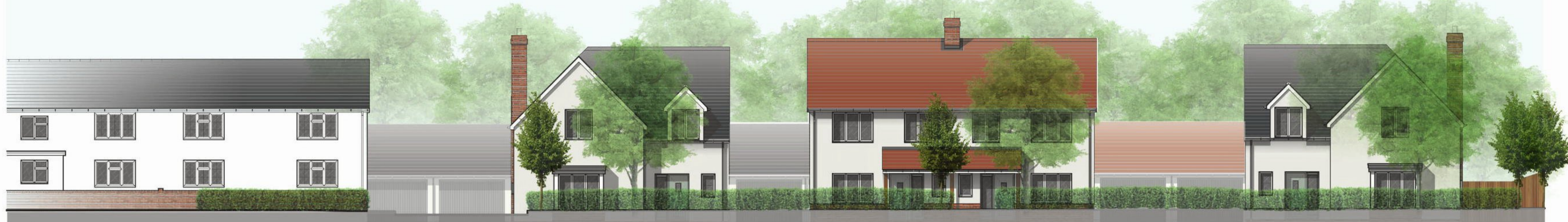
PROPOSED SECTION A SCALE: 1:100 @A1