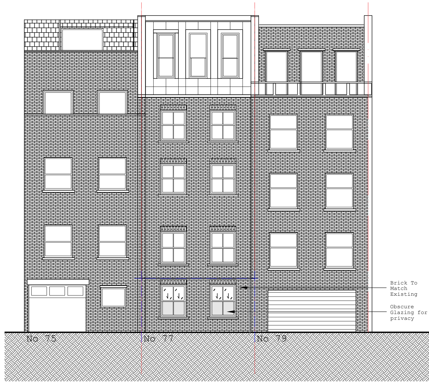
Proposed rear elevation Scale 1:100