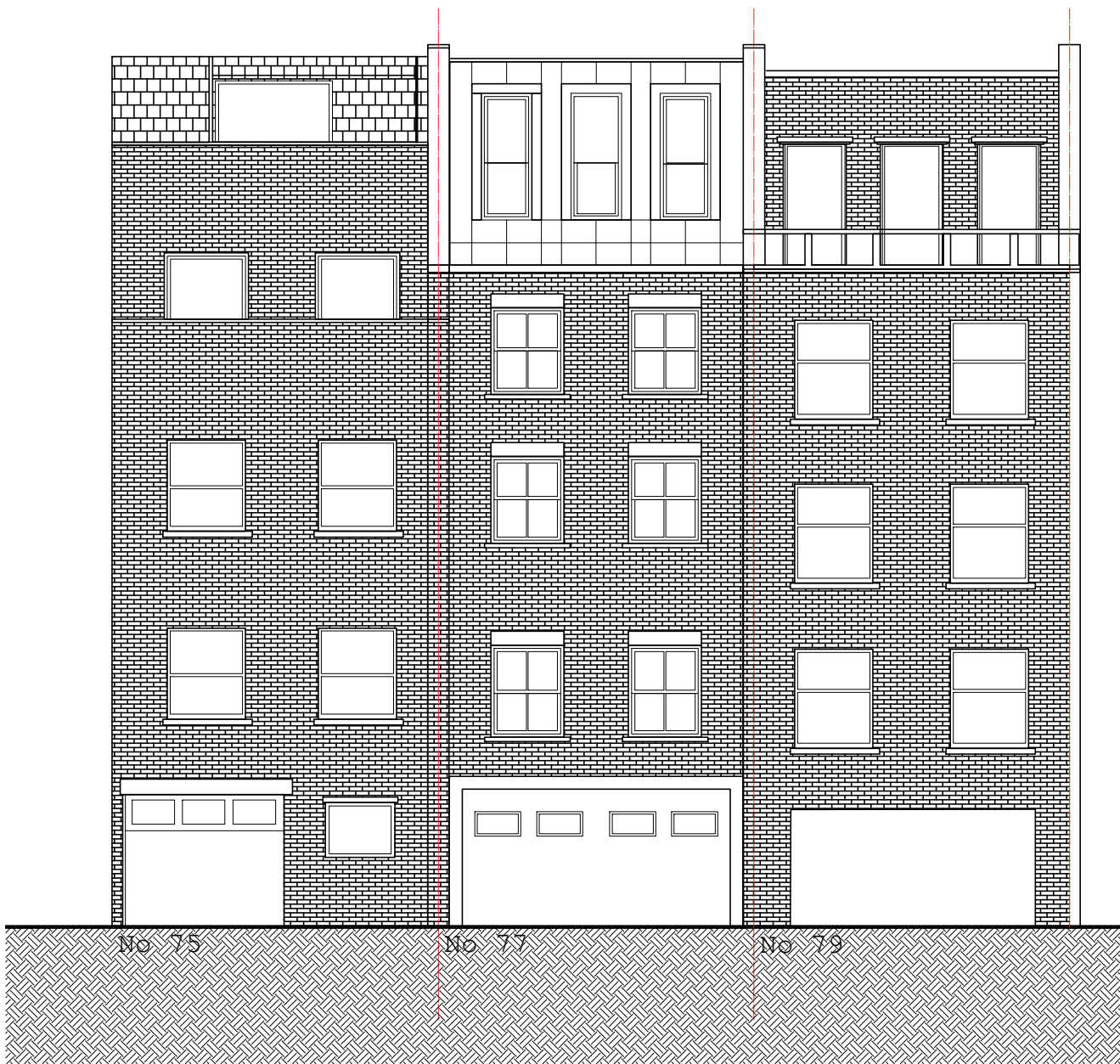
Existing rear elevation Scale 1:100