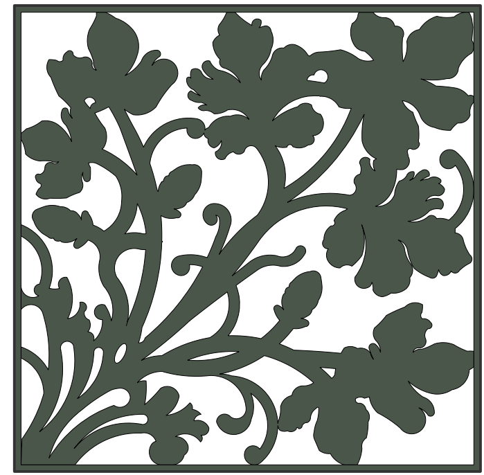
3 Railing Pattern Design Scale: 1:5