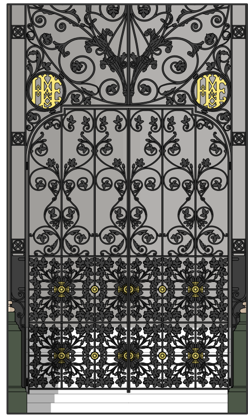
2 Existing Main Gate Scale: 1:50

NOTES: Do not scale off this drawing. Drawings are indicative only. All site dimensions shown are based upon either those taken from the local Ordnance Survey or information supplied to us by others. Forge Architects and Surveyors Ltd accept no responsibility for the accuracy of any site information conveyed in these drawings and it should not be relied upon as being accurate. This drawing and design is the copyright of Forge Architects and Surveyors Ltd and is not to be used for any purpose without their written consent.