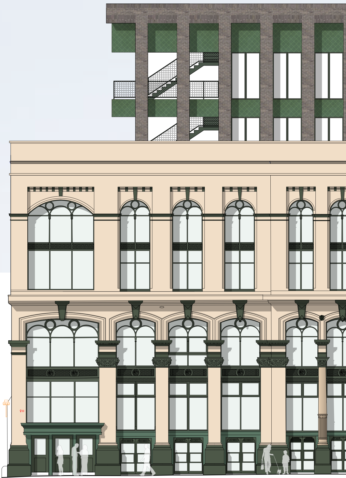
1 Bay Study - Front elevation end corner (left) Scale: 1:100