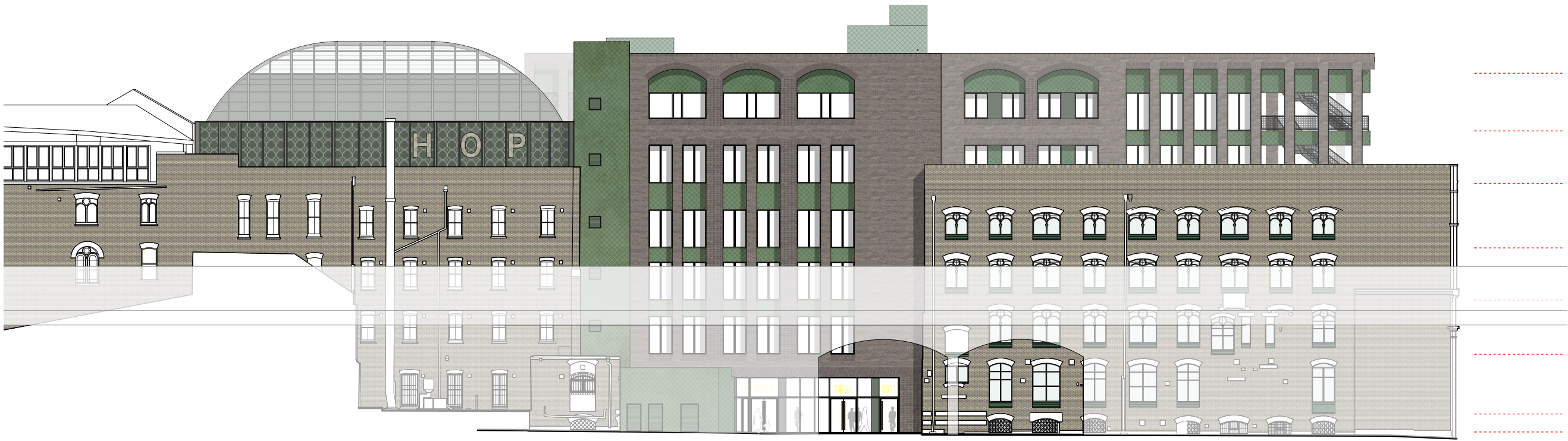
2 Proposed back elevation Scale: 1:300