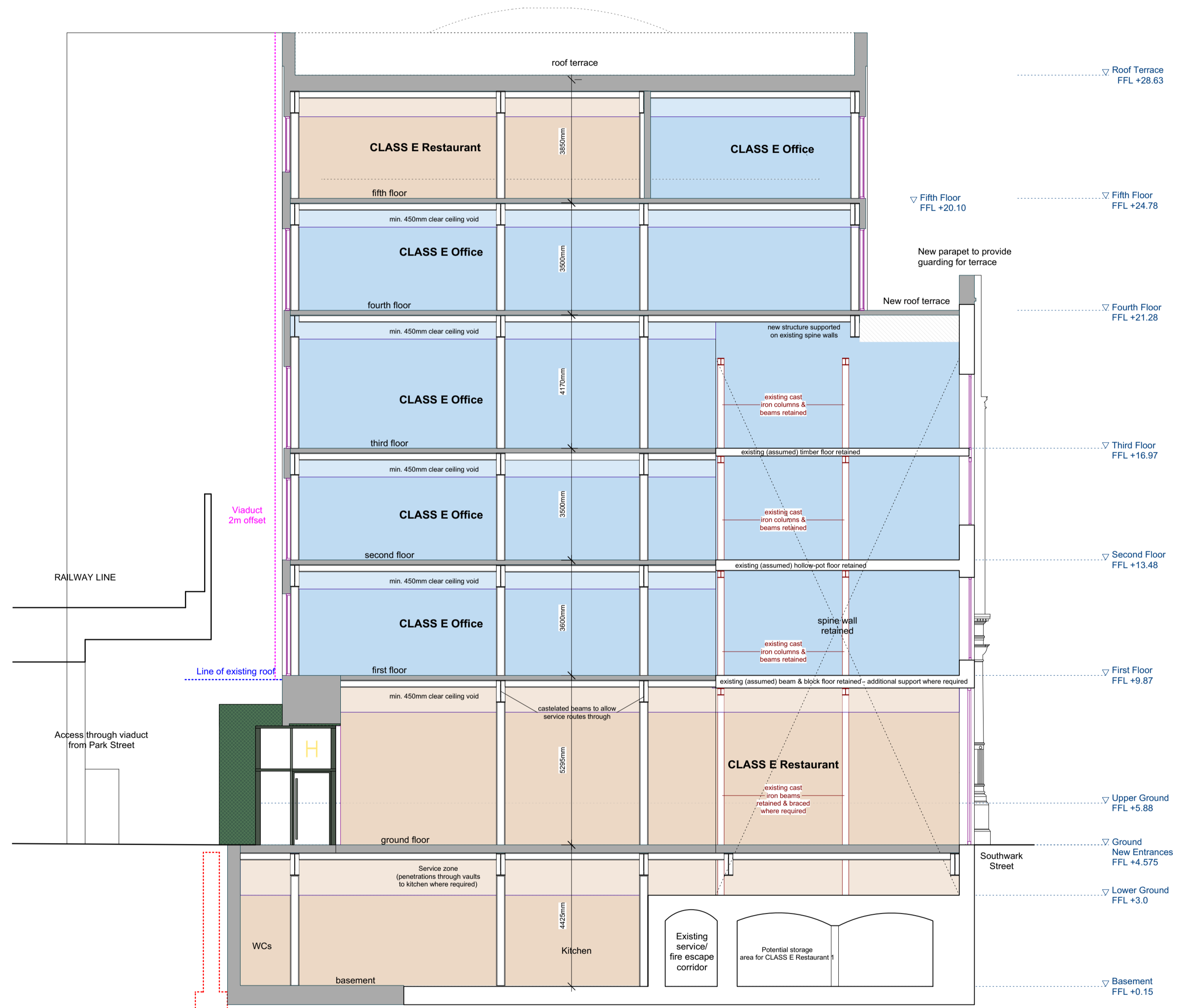
PROPOSED SHORT SECTION C-C