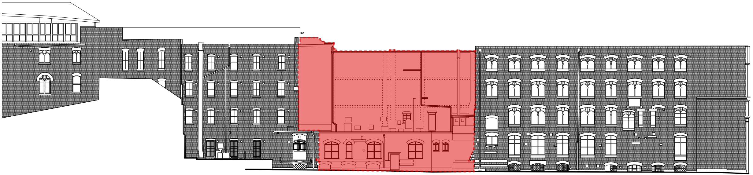
6 Demolition back elevation Scale: 1:300